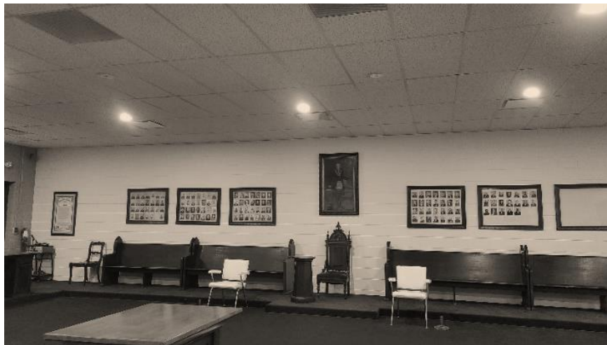
A view toward the South – new church pews, new spot for George Washington print, past masters photos on the wall.