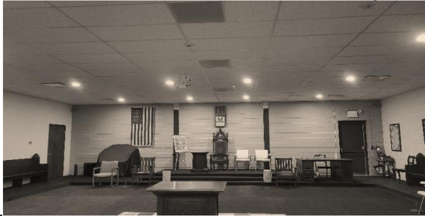
A view toward the East – new painted wall with new columns, flag hung permanently, secretary's desk changed direction.