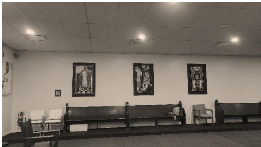
A view toward the North – new artwork on the walls, impressive in person. Youth flags are hung on the West walls.