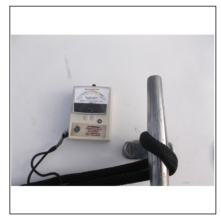
Moisture Meter At Foredeck