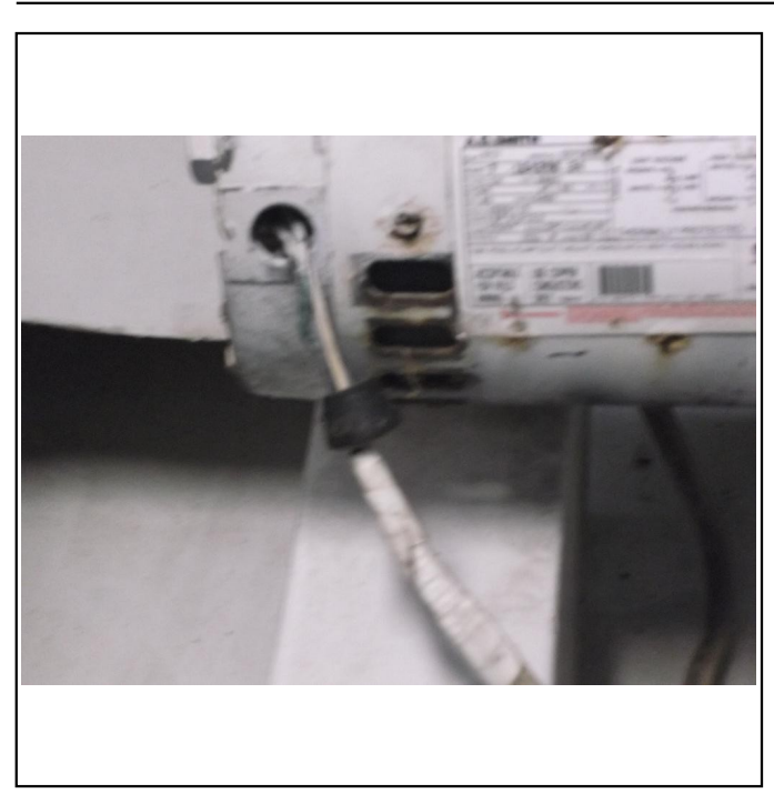
A/C Pump Wiring