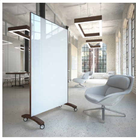
(M) go! Mobile Mag @ 50/10= $90.00 per board