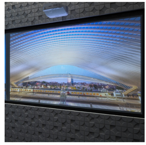
View 80" @ 50/10 = $109.00 per board