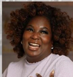
CHANEL SABADO Glowspa