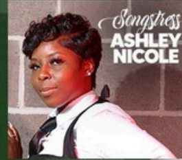
Songstress ASHLEY NICOLE