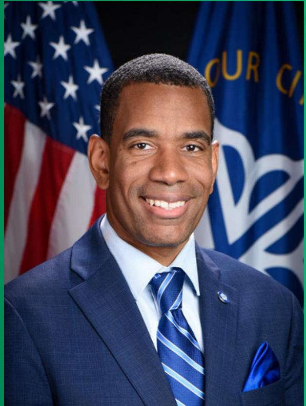
The Honorable Mayor of Rochester Malik Evans