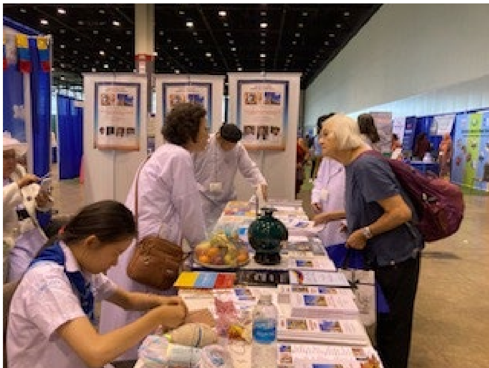
Communicating with visitors.