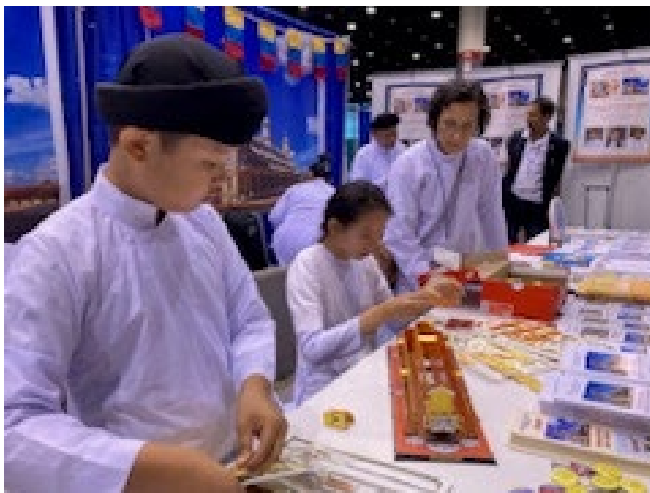
The kids were building a model of the Holy See.