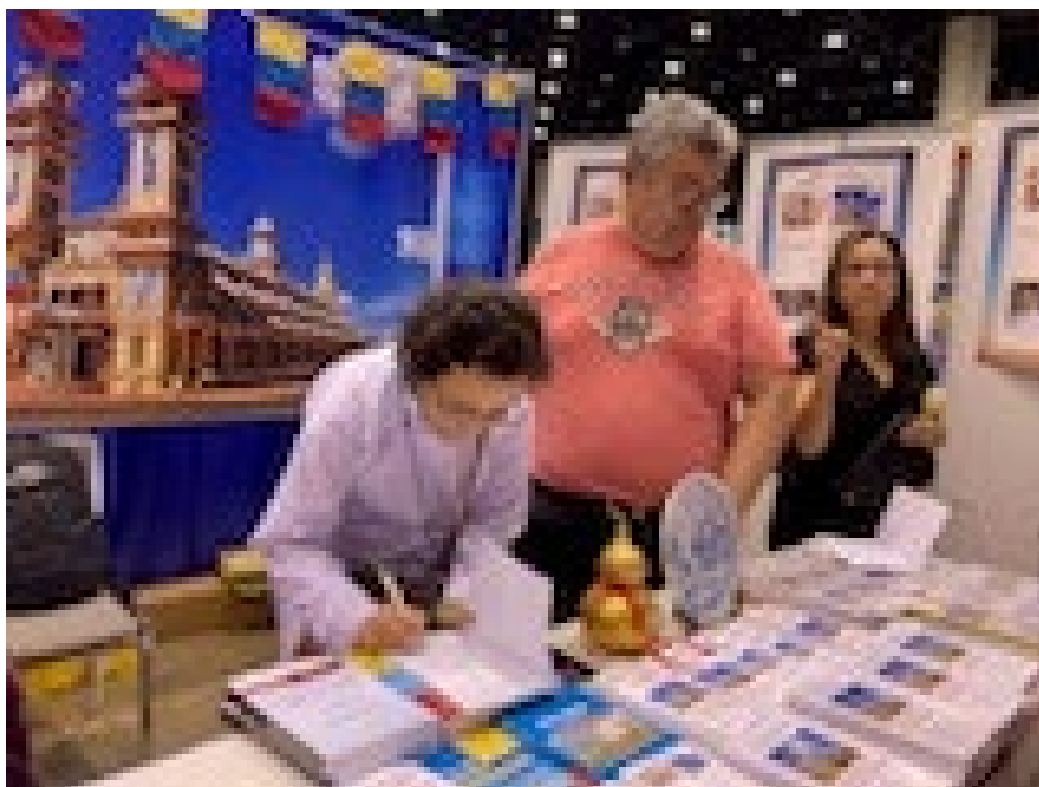
Signing books for visitors.