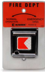
Single Gate & Key Switch on Mounting Plate