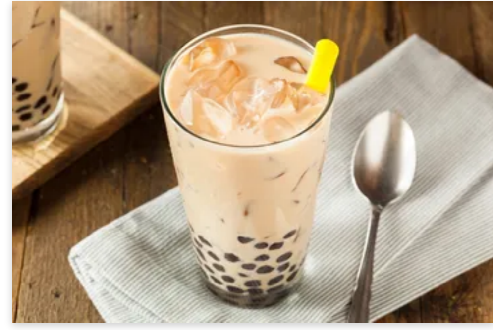
B2.Thai Iced Coffee $2.75