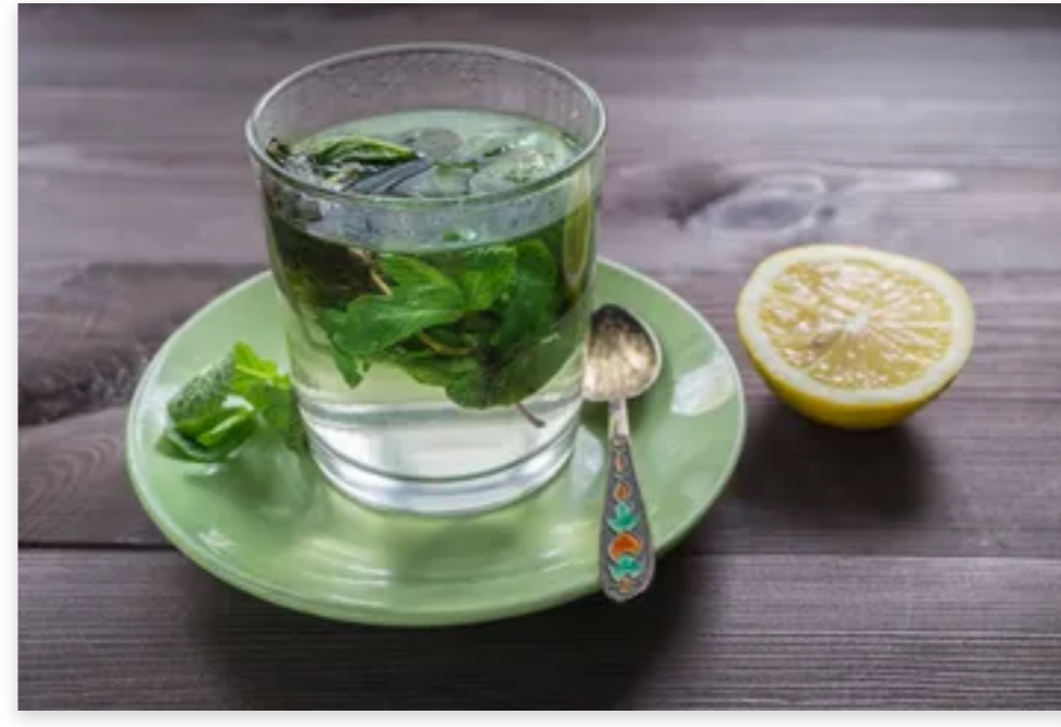
B3.Hot Green Tea $2.00