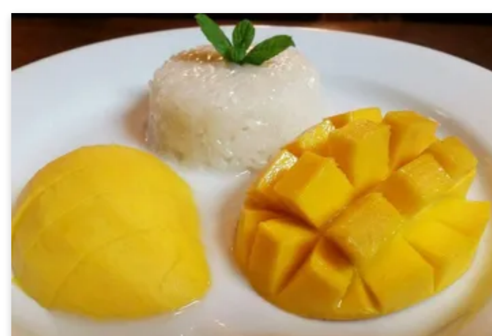
D1.Sweet Sticky Rice with Mango (Seasonal) $7.00