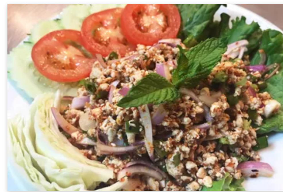
SL9. Larb Kai $10.00

Grilled pork with hot chili, red onions, green onions, peppermint, dill, lime juice and roasted rice. (SPICY)