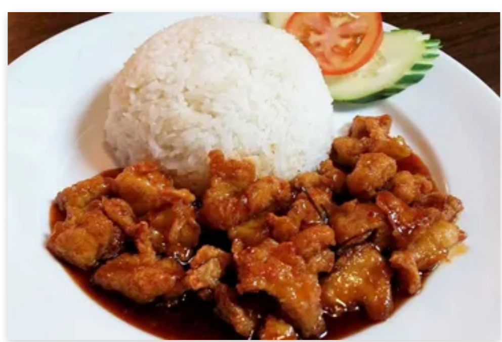
C10. Kai Pad Homemade Sauce $12.00

Stir fried broccoli, carrots with shrimp and soy sauce. Served with white rice.