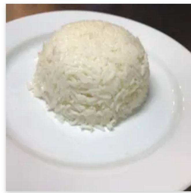
O1.Steamed White Rice $2.00

!! NOTICE !! Our food is prepared around and may contain fish, eggs, soy, milk, peanut, seafood, and other ingredients. We will not accept responsibility for allergic reactions. ** Prices are determined by the owner / manager.