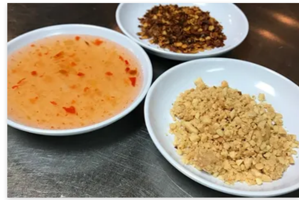
Peanut sauce, hot pepper or peanuts $1.00