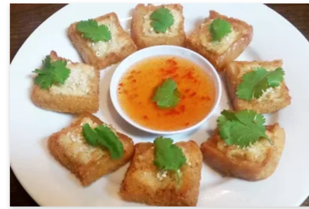
A3. Fried Bread with Minced Chicken Spread (8) $5.00

Deep fried wontons stuffed with ground pork served with sweet and source sauce.