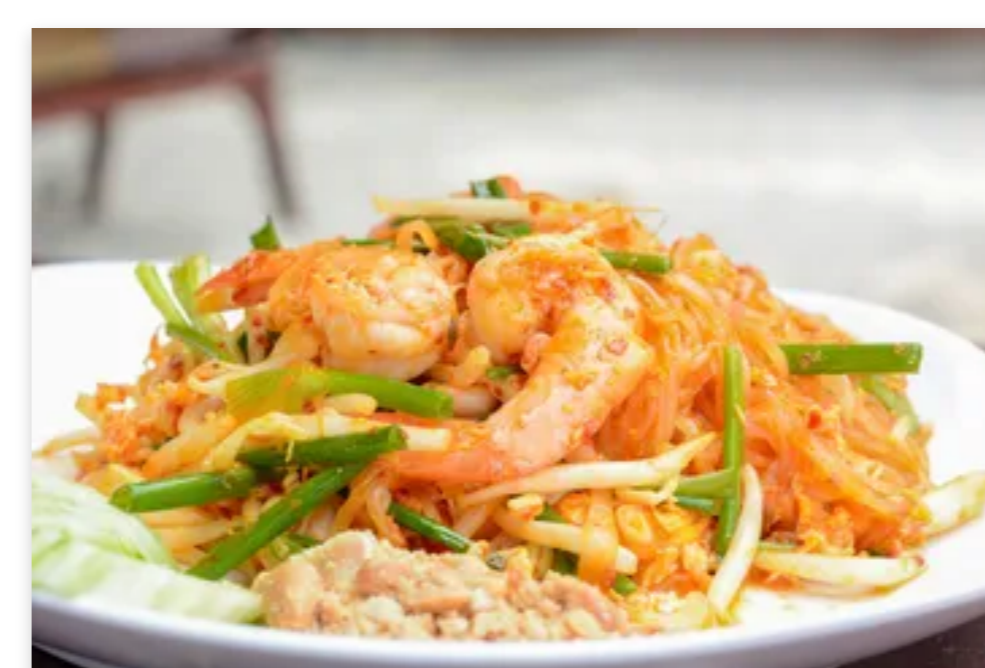
C3. Pad Se Ew $10.00

Stir fried curry powder with garlic, shrimp mixed with chili paste, eggs, fresh milk, celery, onions and chili. Served with white rice. (SPICY)