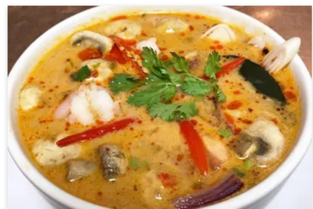
SC1. Tom Yum $10.00

Tofu + $1.00, Choice of Meat: Chicken or Pork + $1.00, Beef + $2.00, Shrimp + 3.00, Combination + $5.00