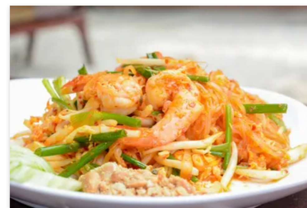
SC3. Pa Nang $12.00

Thai soup rich in coconut milk with fresh ingredients of lemongrass, galanga, kaffir leaf and lime juice.