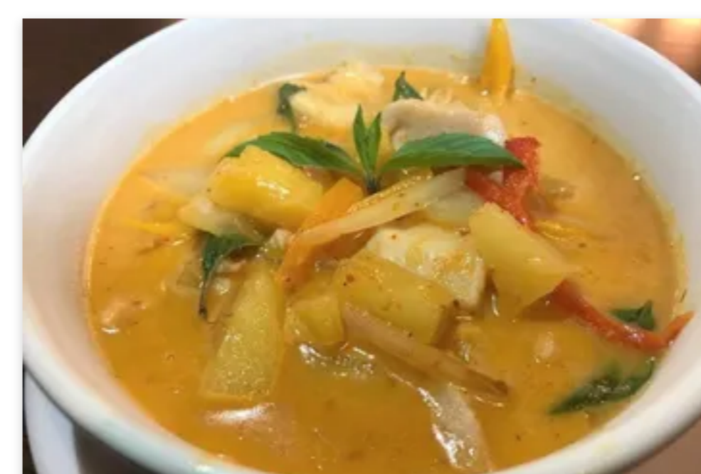
SC6. Pineapple Curry $12.00

Green curry paste with chicken, kaffir leaf, thai eggplants and red peppers in coconut milk.