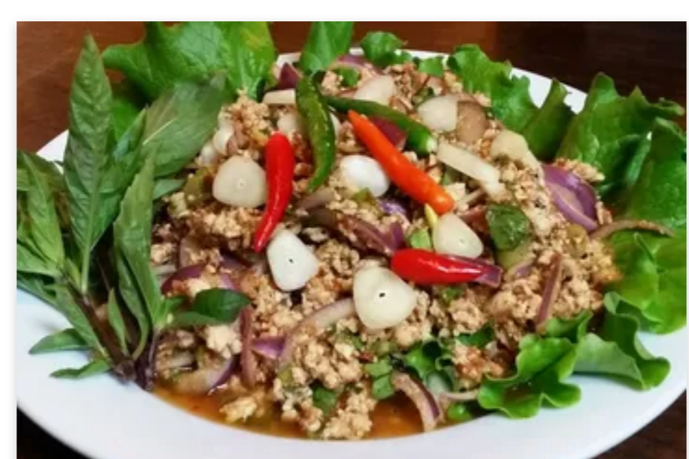
SL10. Larb Moo $10.00

Chopped chicken with red onions, green onions, chili peppers, peppermint, dill, lime juice and roasted rice. (SPICY)