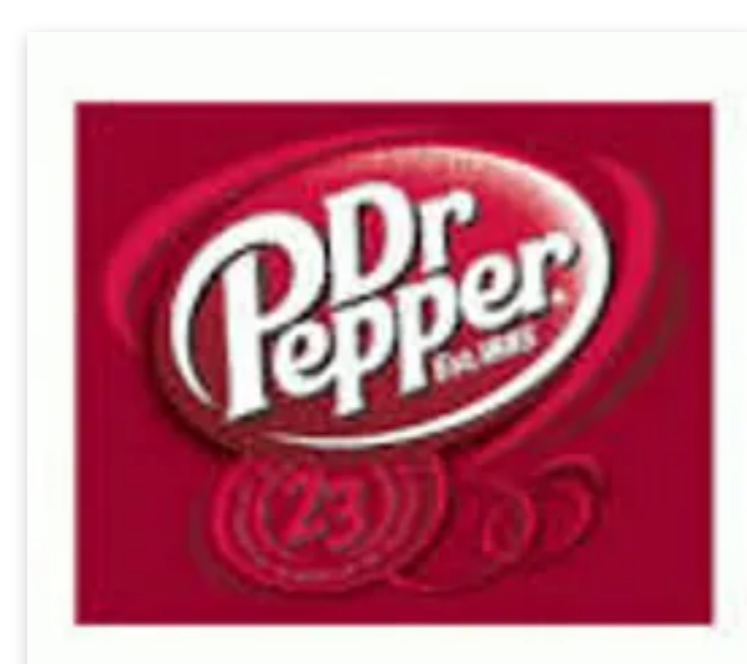
S4.Dr. Pepper $2.00