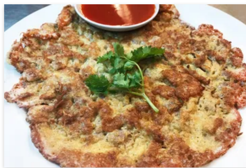
A5. Pork Omelette $6.00

Deep fried seasoned chicken served with sweet and sour sauce.