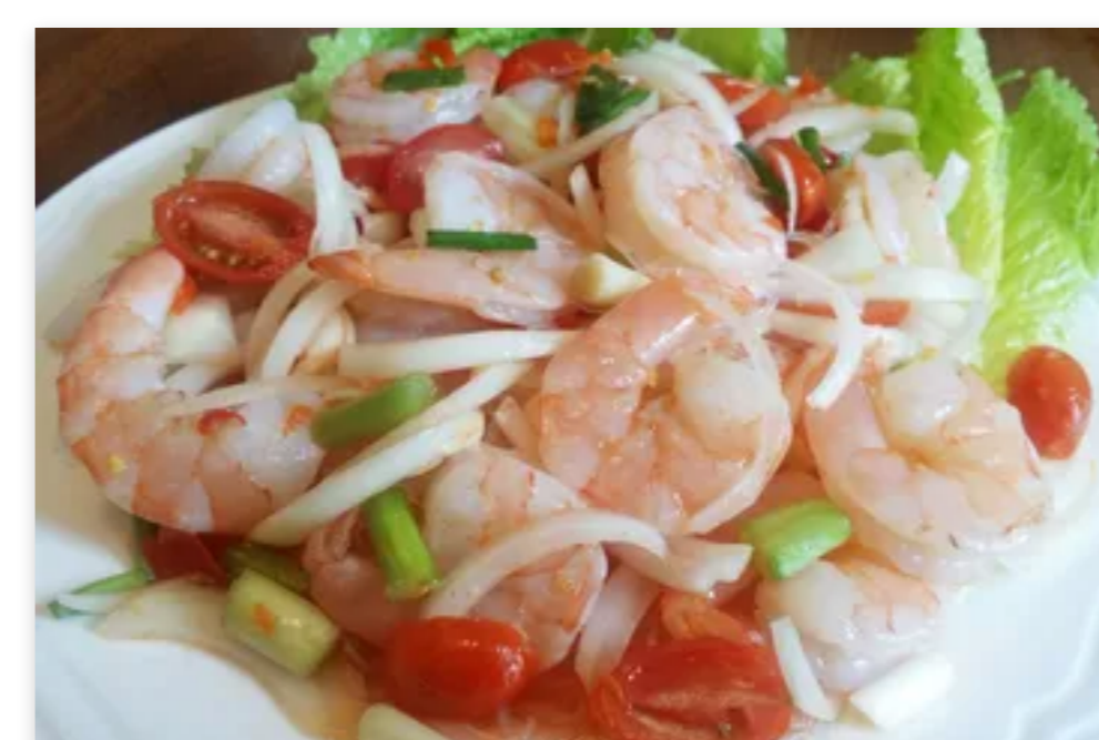
SL3. Yum Kung $15.00

Fresh cucumber with Thai chili, tomatoes, carrots, dried shrimp flakes, black crab, lime juice and fish sauce. (SPICY)