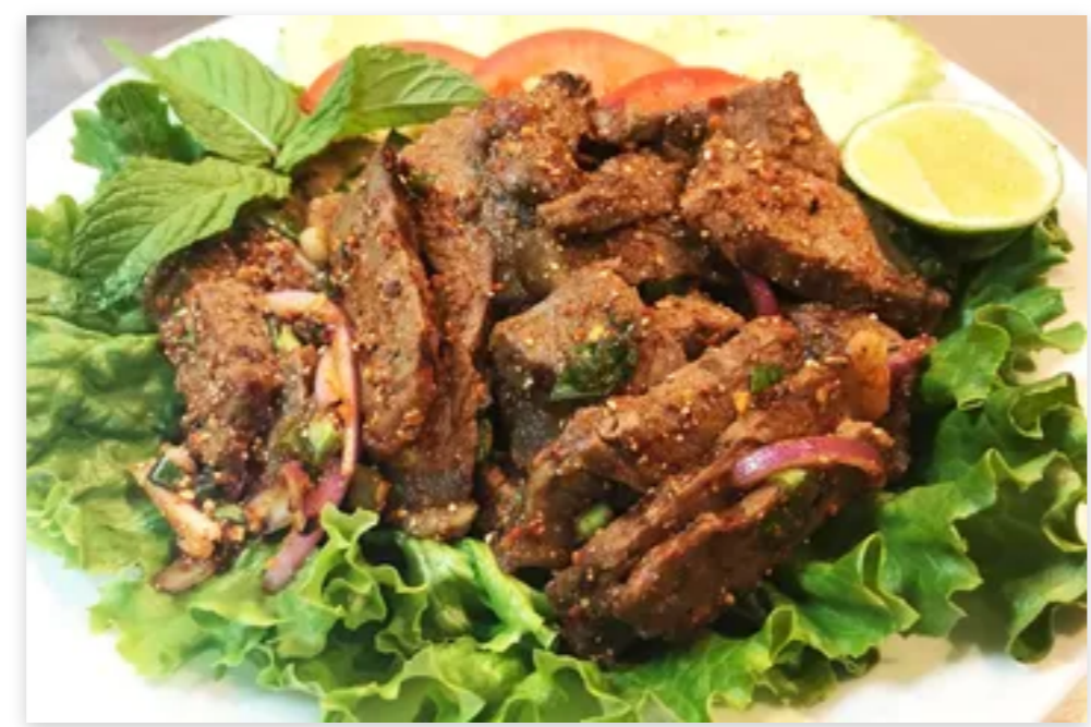
SL7. Yum Neur Yang $14.00

Grilled chicken tossed in our spicy lime dressing, onions, celery, chili peppers and tomatoes. (SPICY)