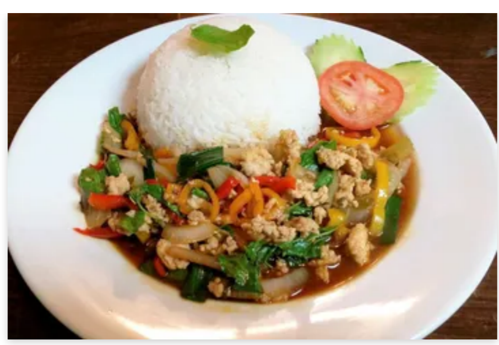
C4. Pad Kraprow $10.00

Stir fried red peppers, green peppers, garlic, onions and Thai basil with your choice of meat. Served with white rice. (SPICY)