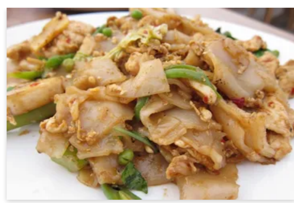
C5. Pad Rad Nah $10.00

Stir fried red peppers, green peppers, garlic, onions and Thai basil with your choice of meat. Served with white rice. (SPICY)