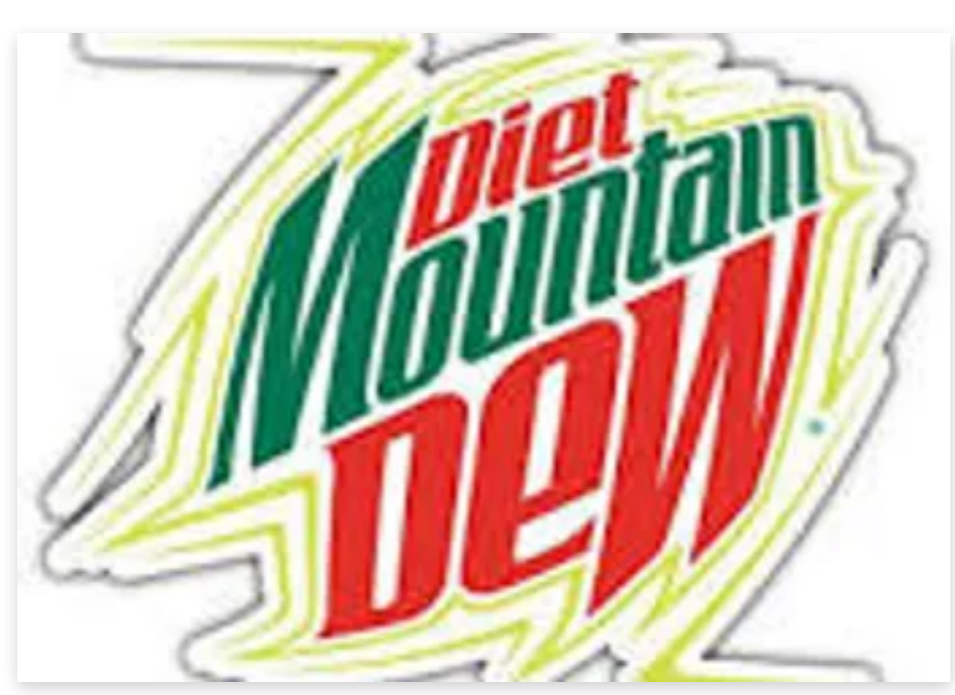
S7.Diet Mountain Dew $2.00