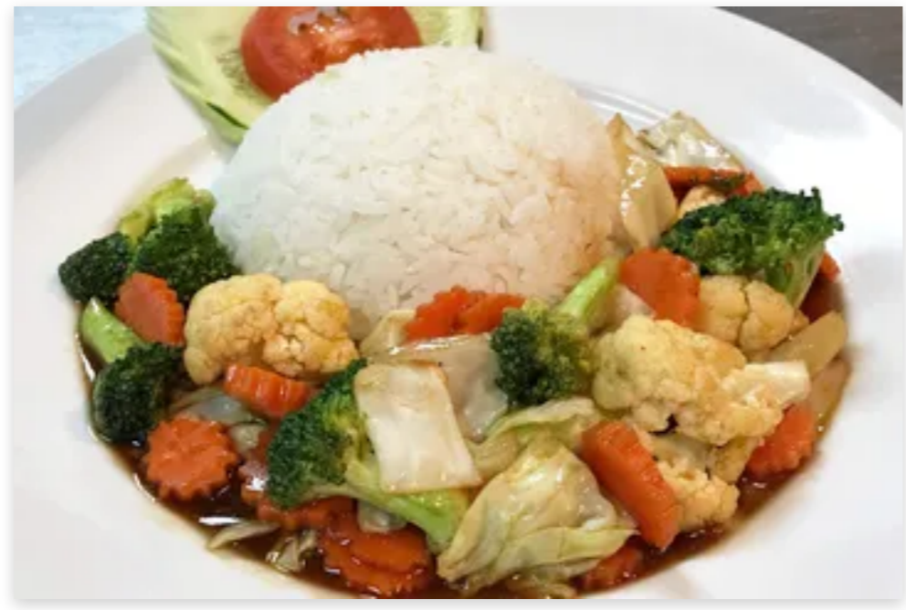
C7. Pad Puk Rom $10.00

Stir fried yellow noodles with cabbage, broccoli, carrots and eggs with your choice of meat.