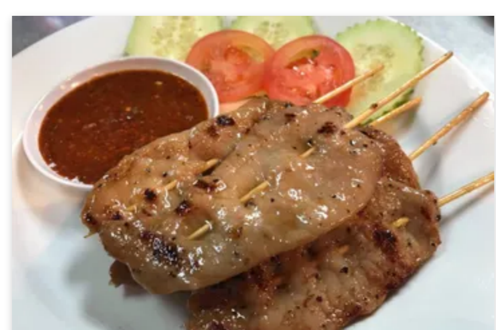
G4. Moo Ping (5) $9.00

Grilled marinated chicken on a stick served with sweet tamarind sauce.