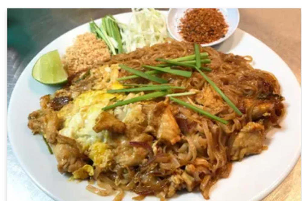
C1. Pad Thai $10.00

Tofu + $1.00, Choice of Meat: Chicken or Pork + $1.00, Beef + $2.00, Shrimp + 3.00, Combination + $5.00