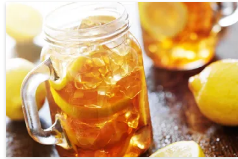
B5.Sweet Tea $2.00