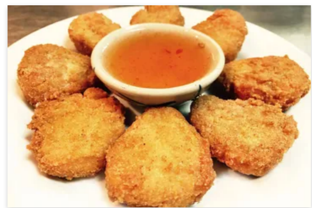
A4. Chicken Nuggets (8) $5.00

Deep fried seasoned ground chicken and bread served with home made sauce.