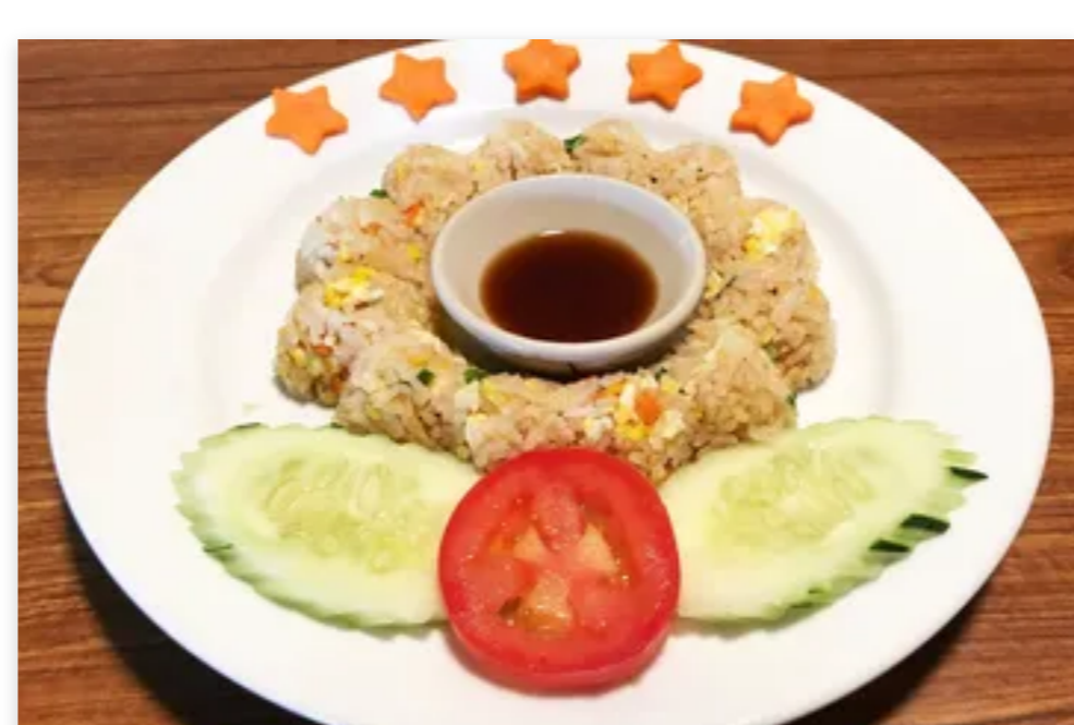
K2. Fried Rice Flower $6.00

Fried rice with carrots, eggs, green onions and soy sauce with your choice of style.