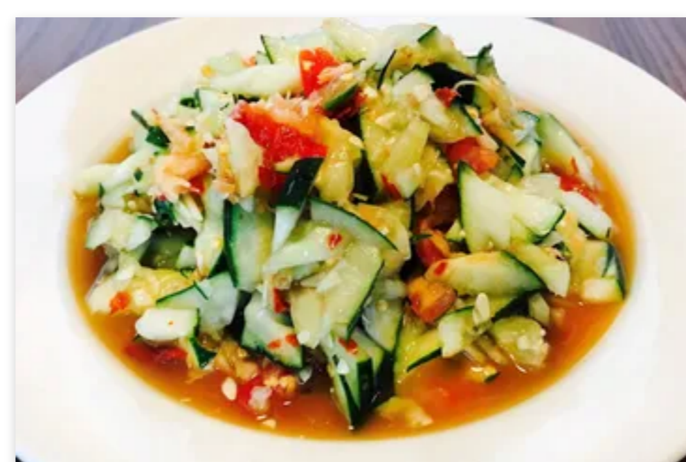
SL2. Tom Tang $9.00

Fresh green papaya with Thai chili tomatoes, carrots, dried shrimp flakes, black crab, lime juice and fish sauce. (SPICY)