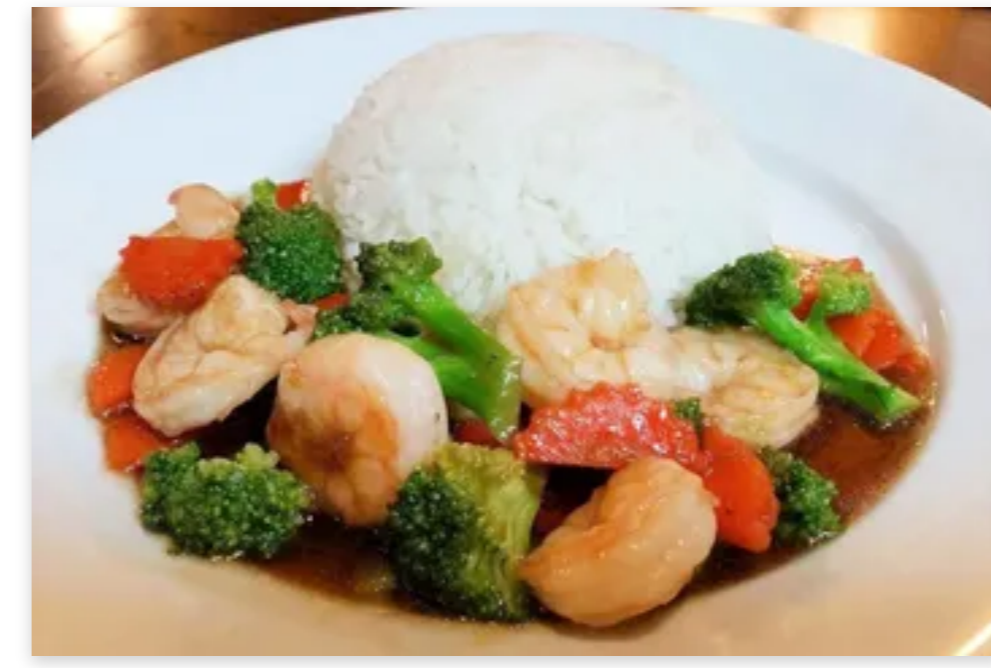
C9. Kung Pad Broccoli $13.00

Stir fried bell peppers, ground pepper, onions, broccoli with homemade sauce with your choice of meat. Served with white rice. (SPICY)