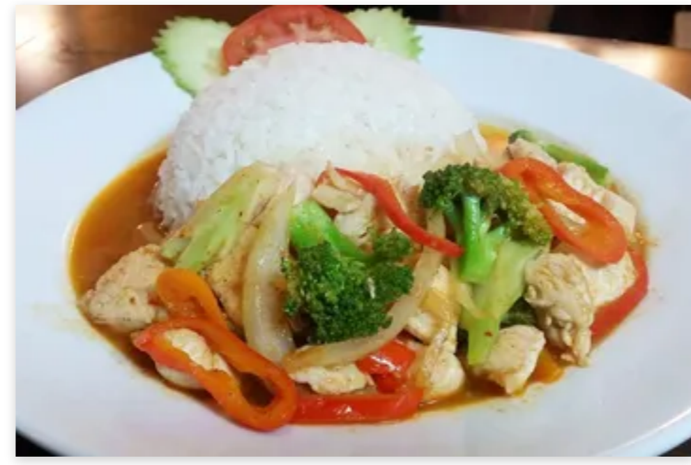
C8. Pad Prik $10.00

Mixed vegetables stir fried with homemade soy sauce with your choice of meat. Served with white rice.