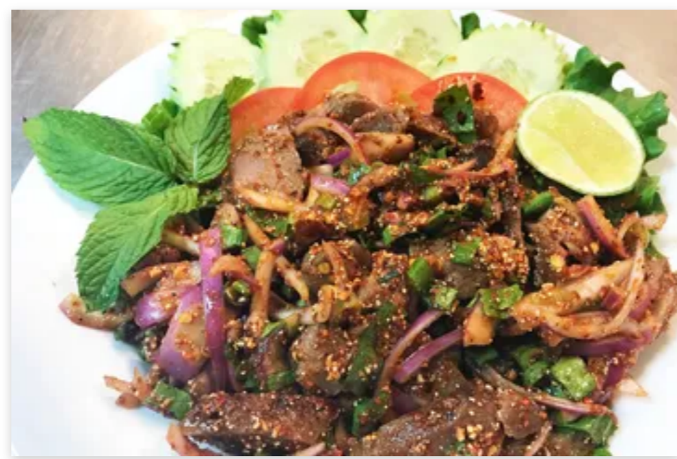
SL8. Yum Moo Yang $13.00

Grilled beef with hot chili, red onions, green onions, peppermint, dill, lime juice and roasted rice. (SPICY)