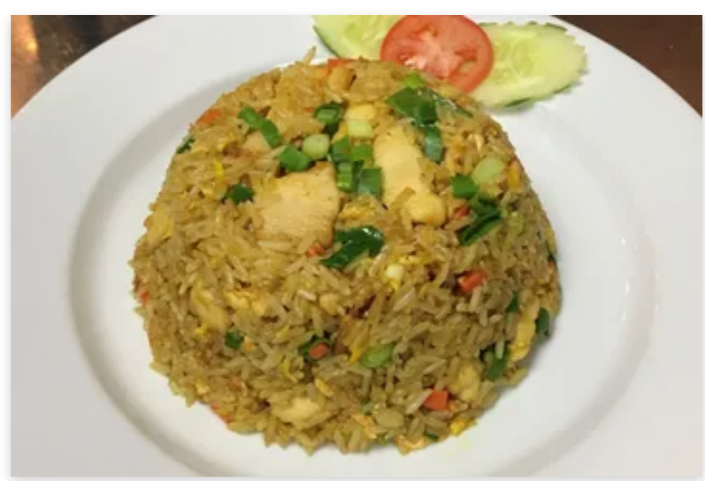
C13. Fried Rice with Eggs $9.00

Stir fried with beef, bell peppers, onions, black pepper with sauce. Served with white rice. (SPICY)