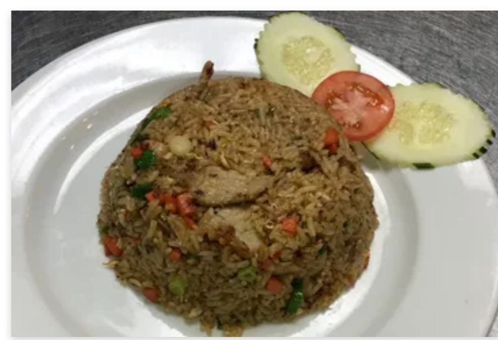
C14. Fried Rice Curry $12.00

Fried rice with carrots, eggs and green onions with your choice of meat.