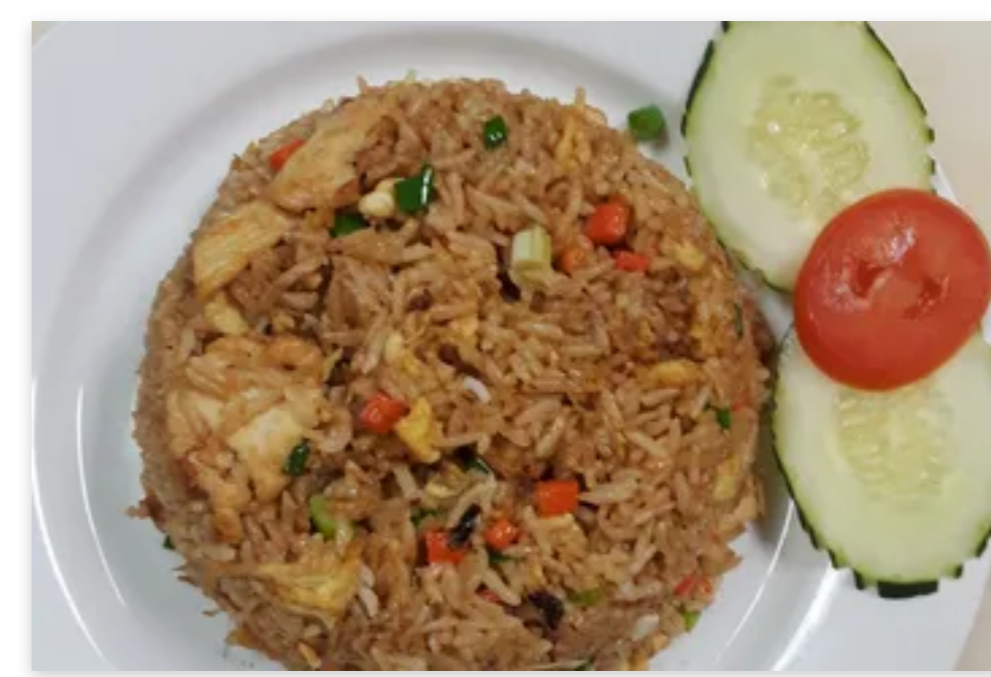
C15. Fried Rice with Chili Paste $12.00

Fried rice with curry powder, carrots, eggs and green onions with your choice of meat.