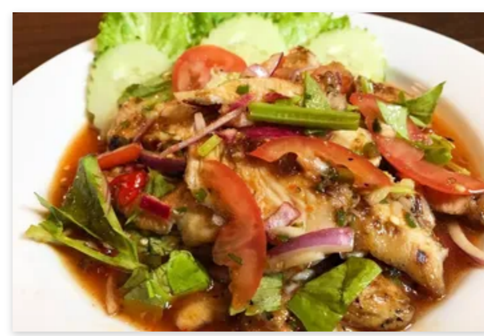
SL6. Yum Kai Yang $12.00

Glass noodles mixed with ground pork, shrimp, garlic, onions, celery, chili peppers, tomatoes, lime juice and herbs. (SPICY)