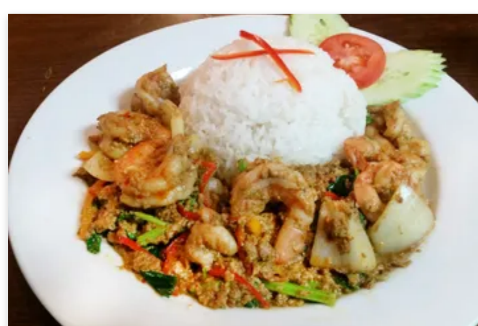
C2. Kung Curry $13.00

Rice noodles stir fried in flavorful sauce with cabbage, eggs and garlic chives with your choice of meat.