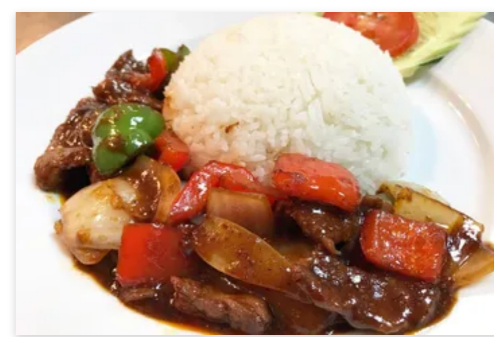
C12. Pepper Steak $12.00

Stir fried with pineapple, onions, bell peppers, with homemade sweet and sour gravy with your choice of meat. Served with white rice.