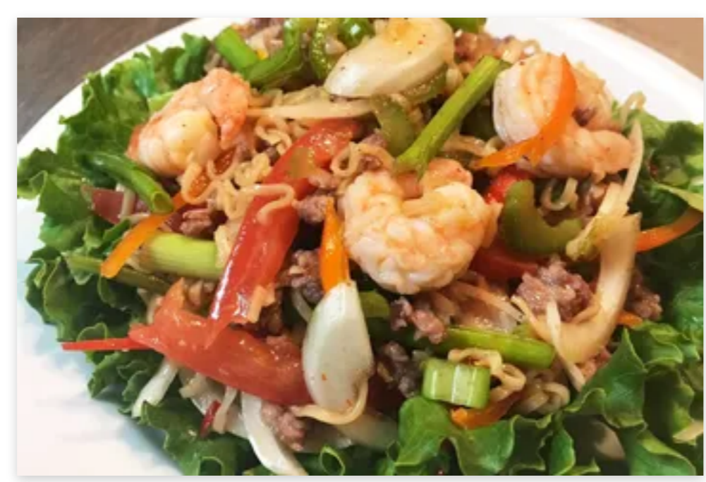
SL4. Yum Raman Noodle $13.00

Raman noodles mixed with ground pork, shrimp, onions, celery, chili peppers, carrots and lime juice. (SPICY)