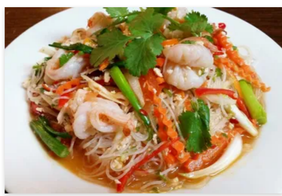
SL5. Yum Woon Sen $13.00

Raman noodles mixed with ground pork, shrimp, onions, celery, chili peppers, carrots and lime juice. (SPICY)