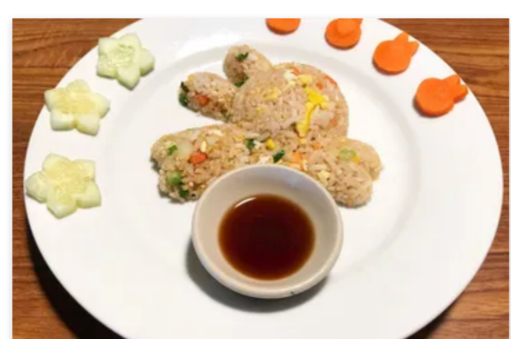
K1. Fried Rice Bunny $6.00

!! NOTICE !! Our food is prepared around and may contain fish, eggs, soy, milk, peanut, seafood, and other ingredients. We will not accept responsibility for allergic reactions. ** Prices are determined by the owner / manager. Kids 3 and under eat FREE with the purchase of 1 Adult meal, Dine-In ONLY.