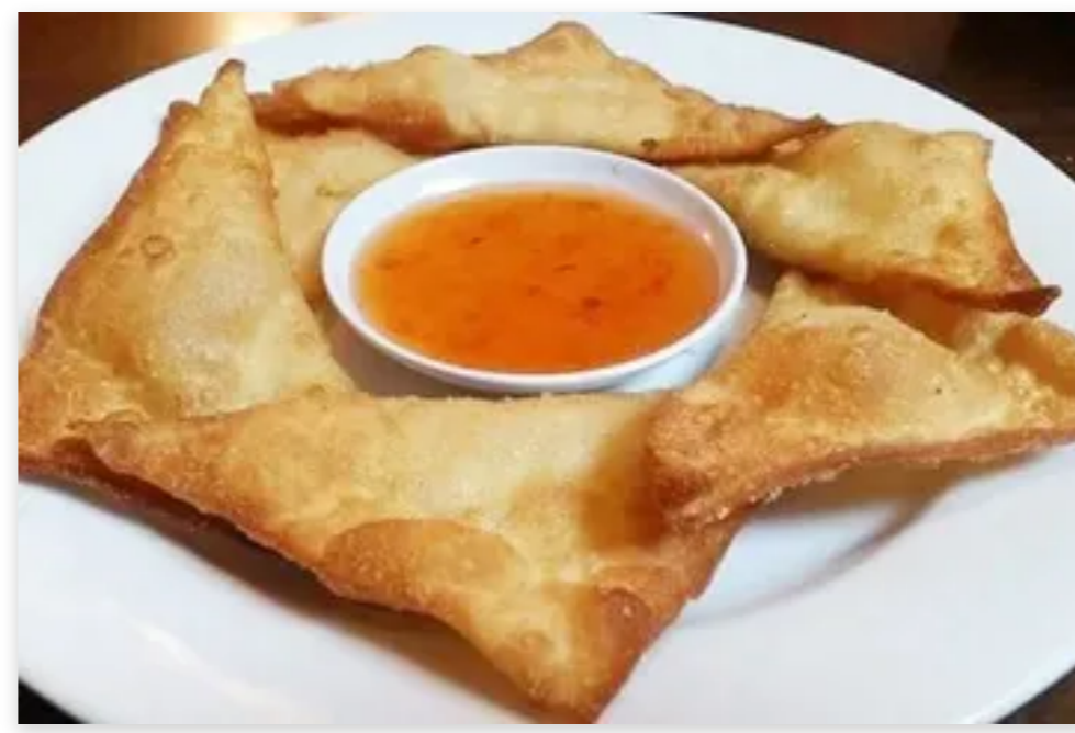
A2. Crispy Wontons (6) $5.00

Stuffed with ground chicken, vegetables and glass noodles served with sweet and sour sauce.