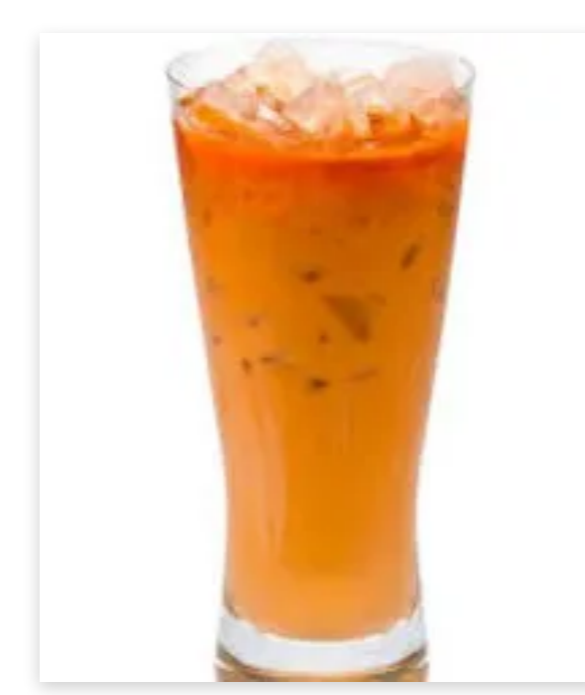
B1.Thai Iced Tea $2.75