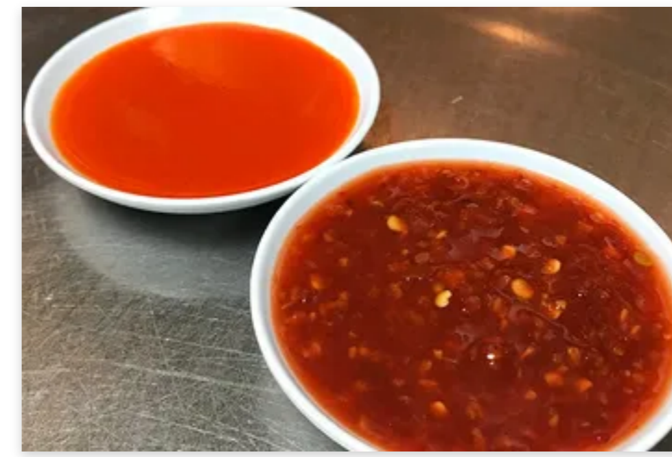
Sweet Siracha sauce or Hot Siracha sauce $1.00