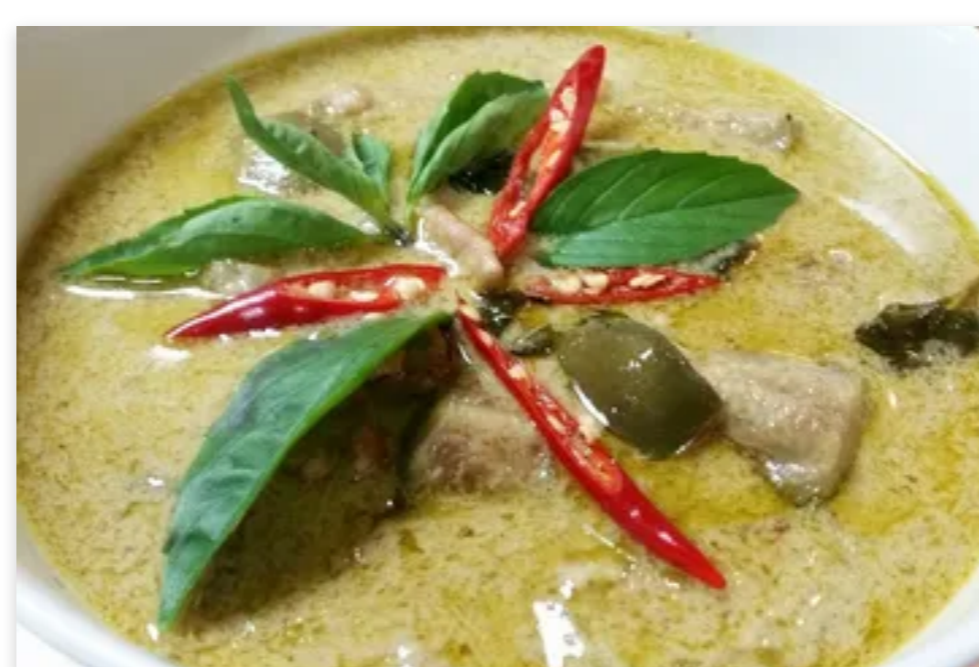
SC5. Gang Keiow Wan $12.00

Massaman curry paste with chicken in coconut milk flavored with peanut, potatoes and onions.