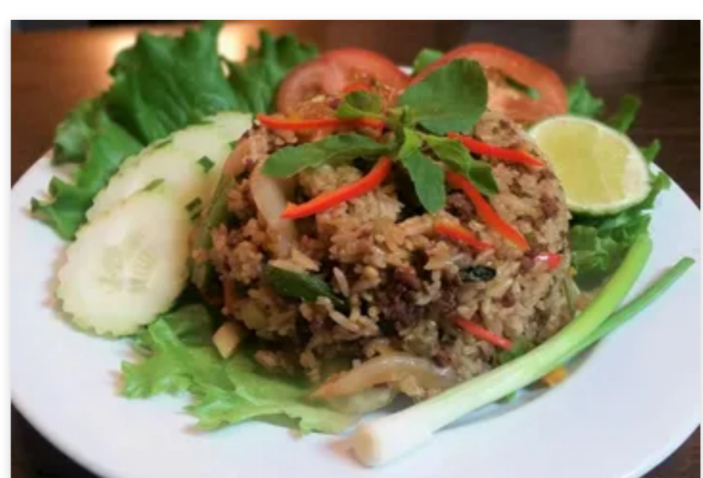
C16. Fried Rice Kraprow $12.00

Fried rice with chili paste, carrots, eggs and green onions with your choice of meat. (SPICY)