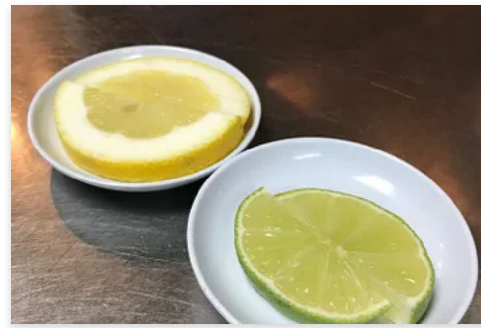
Lemon or lime slices $1.00