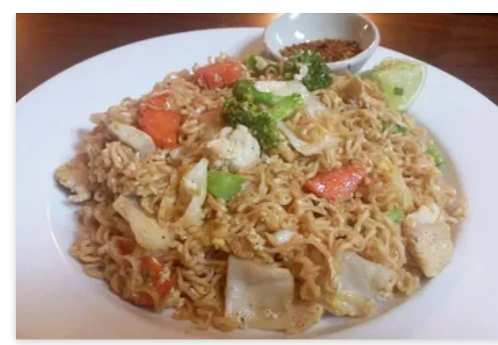
C6. Pad Raman Noodle $10.00

Classic stir fried noodles topped with kale and carrots in a light gravy sauce with your choice of meat.