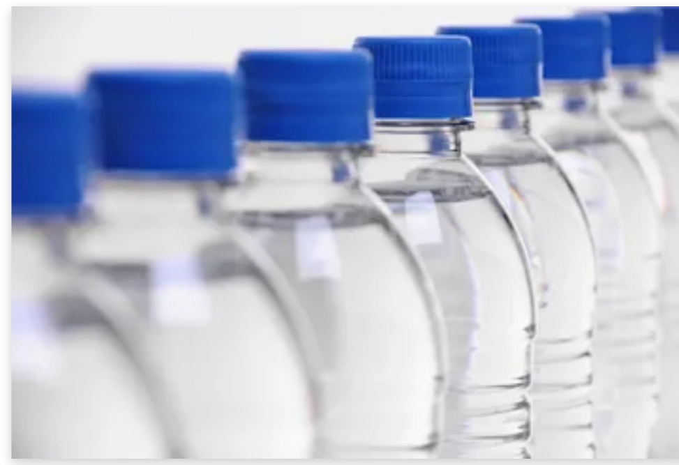
B6.Bottled Water $1.00