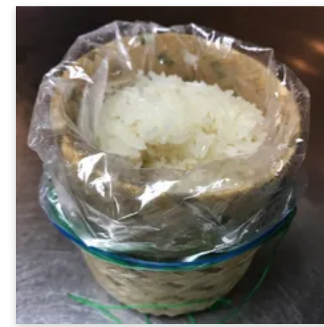
O2.Sticky Rice $2.50