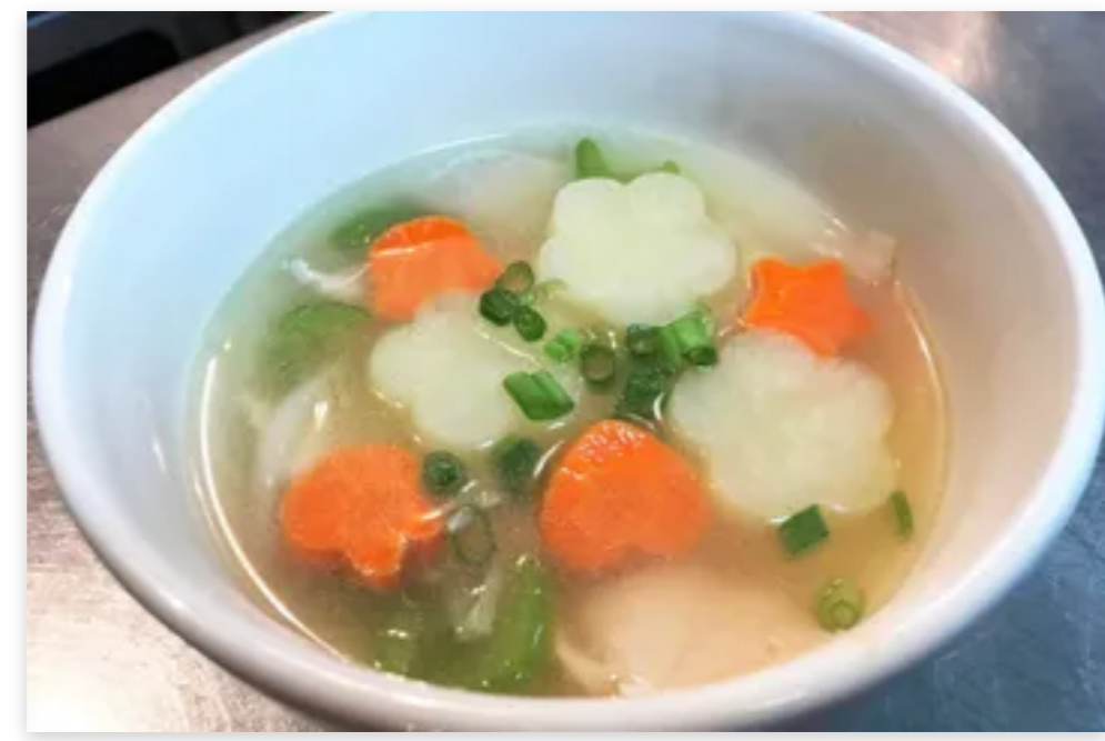
K4.Chicken Broth $6.00

Chicken slice in soup with carrots, potato, onions, green onions and celery.