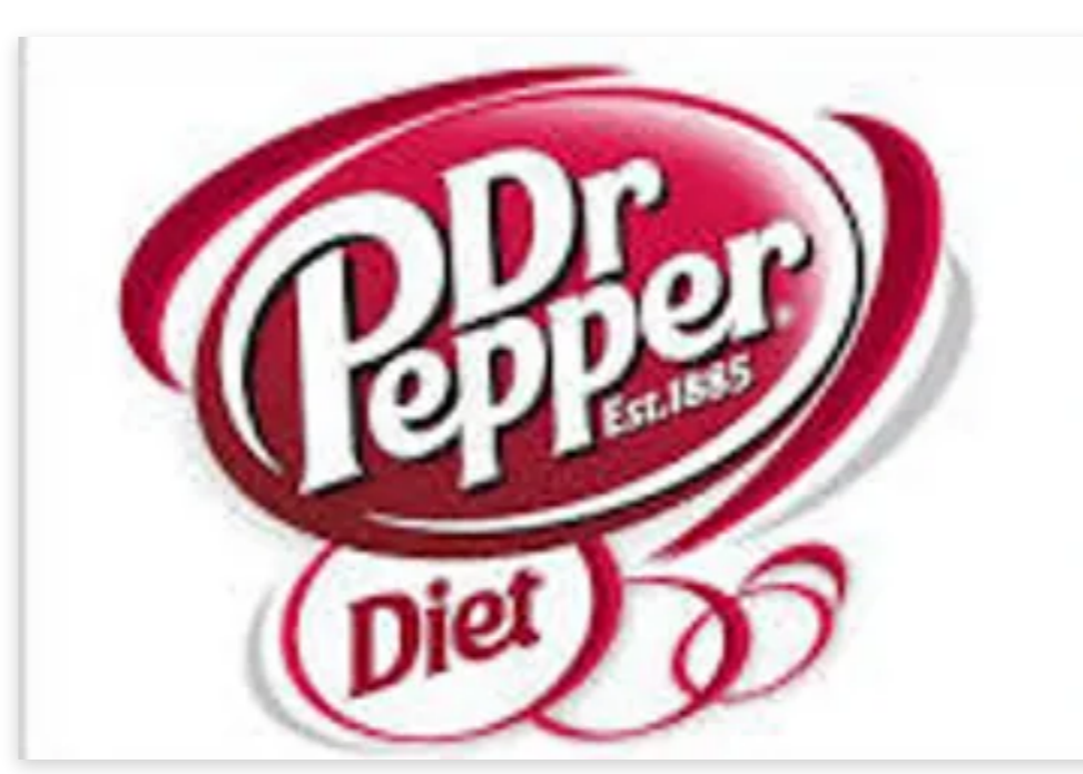
S8.Diet Dr. Pepper $2.00