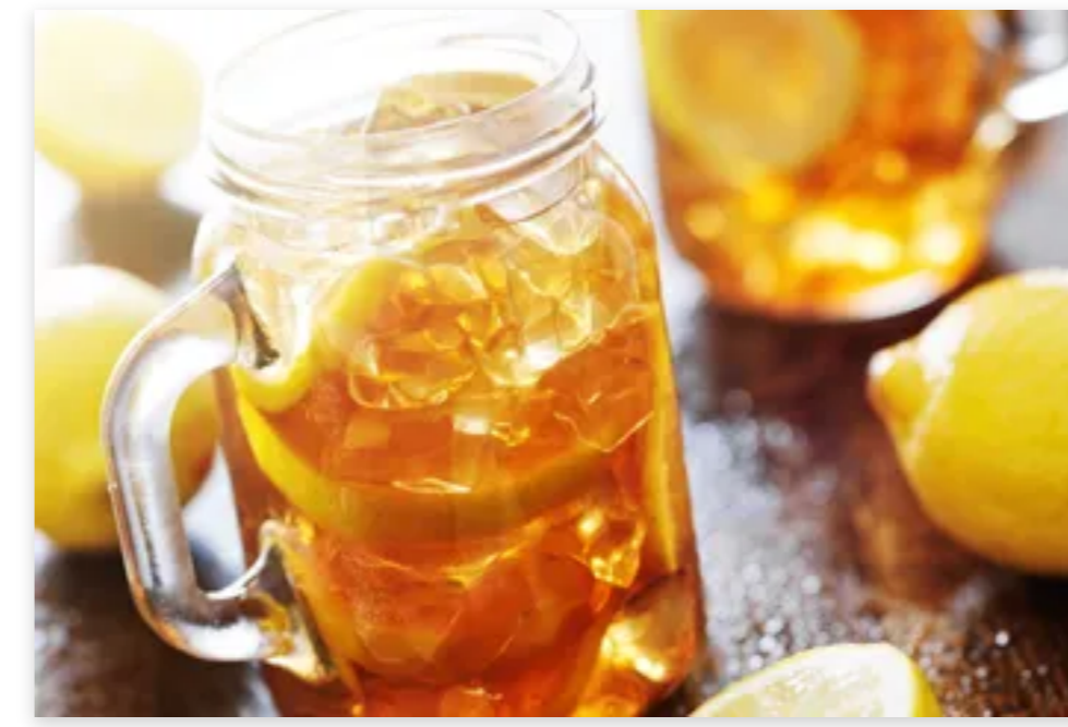
B7.Unsweet Tea $1.50