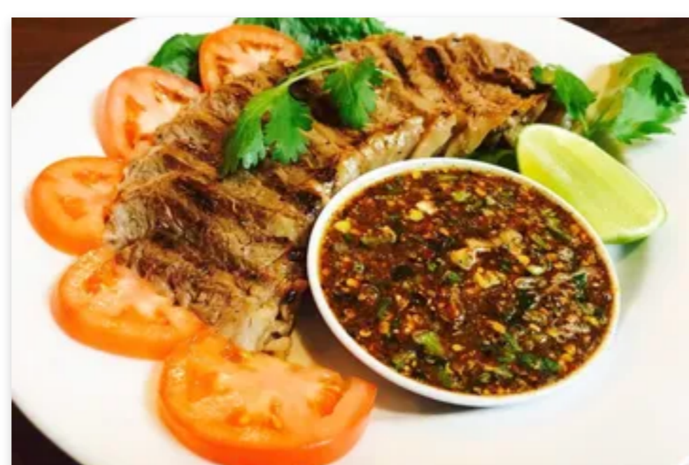
G2. Neur Yang $13.00

Grilled pork marinated served with sweet tamarind sauce.