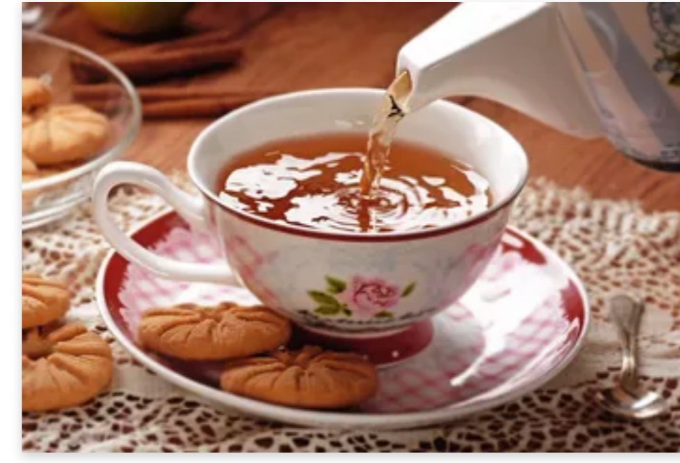
B4.Hot Tea $2.00