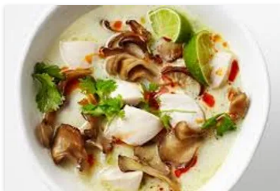
SC2. Tom Kha $11.00

Hot and spicy sour soup. Lemongrass, galanga, kaffir leaf, mushrooms, tomatoes and lime juice.