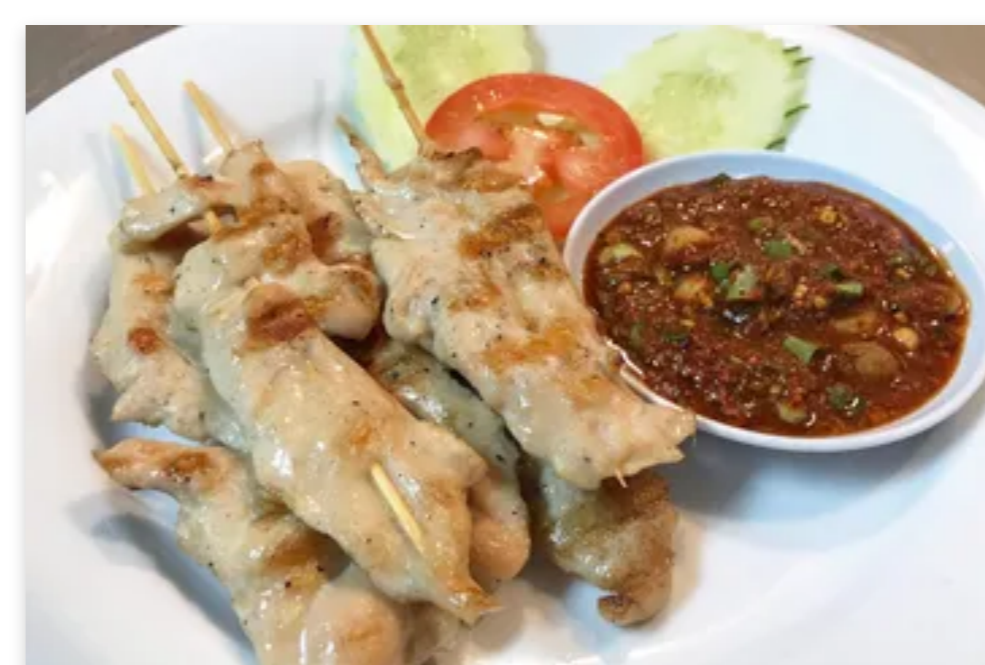
G3. Kai Ping (5) $9.00

Grilled beef marinated served with sweet tamarind sauce.