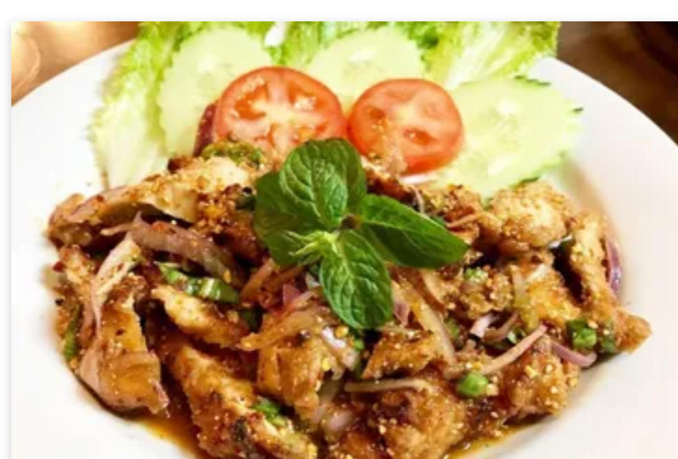
SL11. Larb Kai Tod $12.00

Chopped pork with red onions, green onions, chili peppers, peppermint, dill, lime juice and roasted rice. (SPICY)