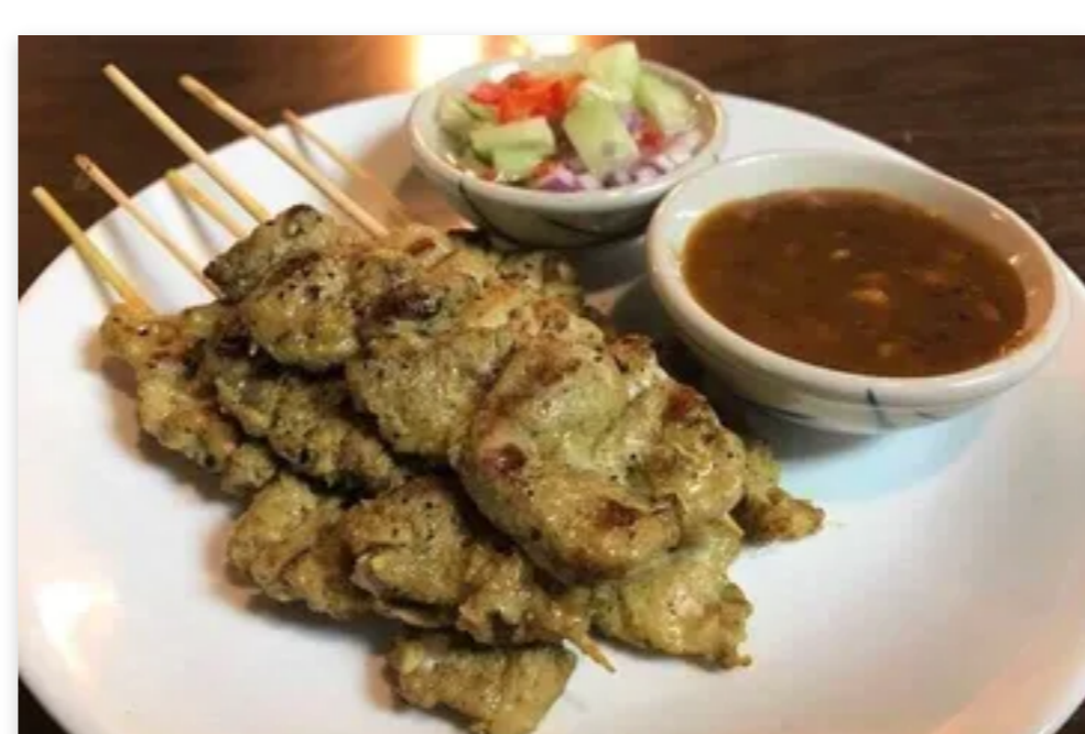
G5. Kai Satay (5) $10.00

Grilled marinated pork on a stick served with sweet tamarind sauce.