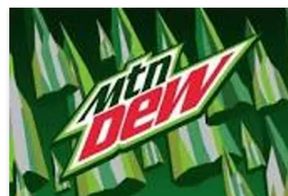
S3.Mountain Dew $2.00