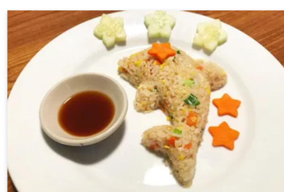
K3. Fried Rice Dolphin $6.00

Fried rice with carrots, eggs, green onions and soy sauce with your choice of style.