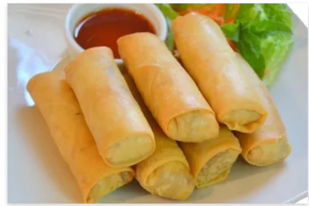
A1. Egg Rolls (5) $5.00

!! NOTICE !! Our food is prepared around and may contain fish, eggs, soy, milk, peanut, seafood, and other ingredients. We will not accept responsibility for allergic reactions. ** Prices are determined by the owner / manager.