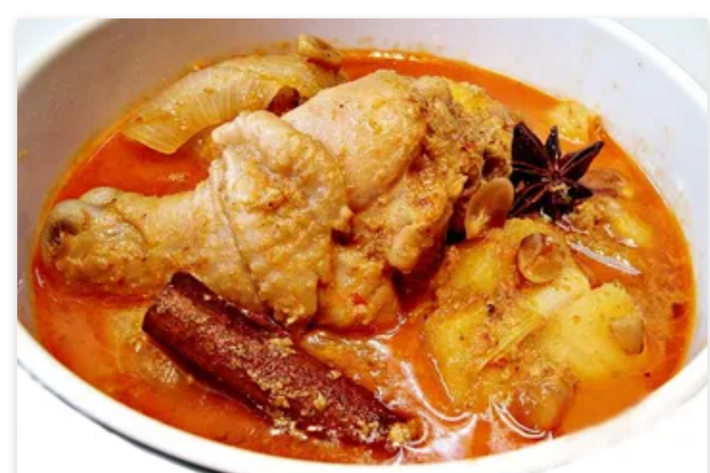
SC4. Massaman Kai $12.00

Panang curry, kaffir leaf, red peppers and broccoli in coconut milk.