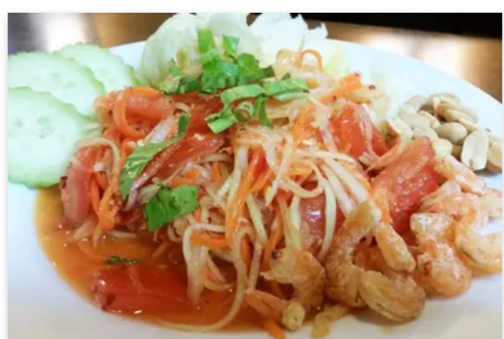
SL1. Som Tom $10.00

!! NOTICE !! Our food is prepared around and may contain fish, eggs, soy, milk, peanut, seafood, and other ingredients. We will not accept responsibility for allergic reactions. ** Prices are determined by the owner / manager.