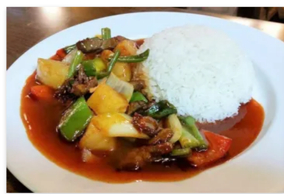
C11. Sweet & Sour with Pineapple $12.00

Deep fried chicken tossed in our flavorful homemade sweet and sour sauce. Served with white rice. (SPICY)