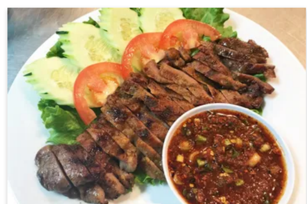
G1. Moo Yang $12.00

!! NOTICE !! Our food is prepared around and may contain fish, eggs, soy, milk, peanut, seafood, and other ingredients. We will not accept responsibility for allergic reactions. ** Prices are determined by the owner / manager.