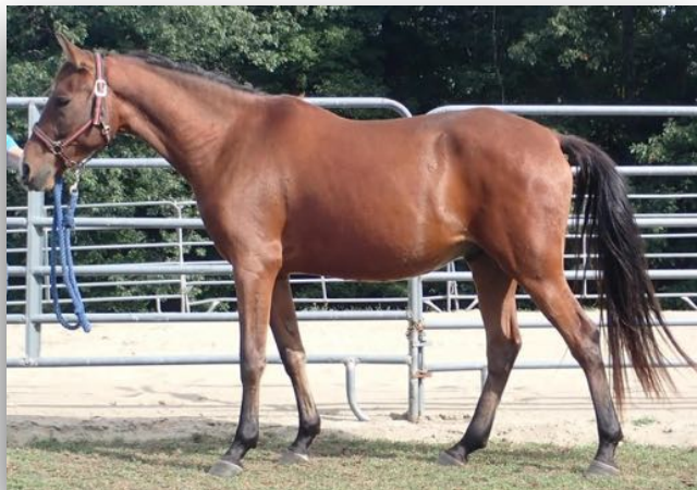
Halo SHG #ShA-21-238 (*Hadban USA x Stardancer by Starwalkerl)

Numbers are for: Type, Head, Neck, Body, Legs, Walk, Trot, Canter