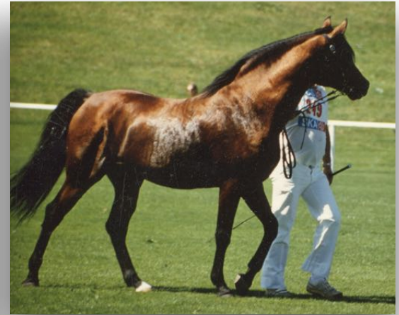
Reineke Zett carries the Dahoman sire line through his great grandsire Daikir