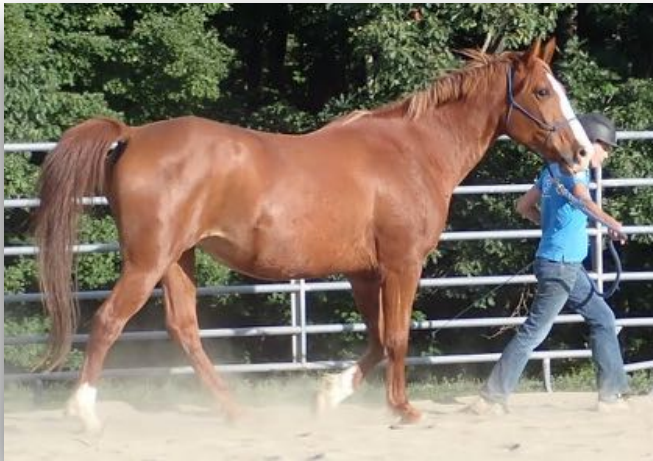
Silhouette's walk