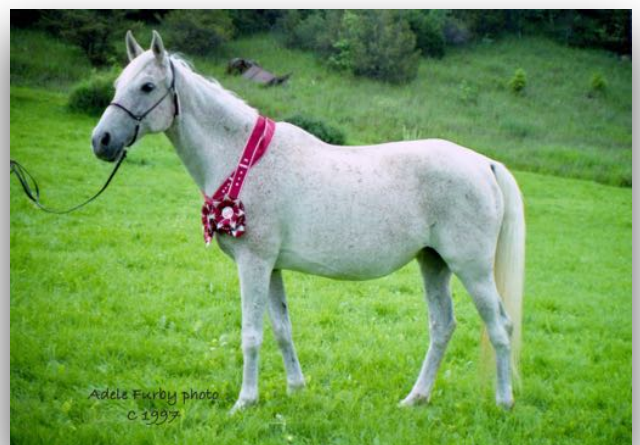
*Biala, dam of Bayram, at age 20