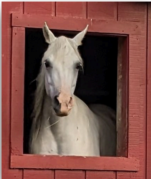
Empressa

Empressa's sire, *Magic Domino++++// , was originally imported from Great Britain into Canada, and then was brought to the US in 2000. Standing 16 hands tall and with excellent type, he became known as a superior producer of sport horses with mares of various breeds, and he earned the high honor, Legion of Supreme Excellence. Domino's pedigree is entirely of classic Crabbet Arabian breeding, combining many of the well-known horses from those lines, such as two lines to the Rissalix son Blue Domino , the Oran son Silver Vanity , and the Raktha son Indian Magic .