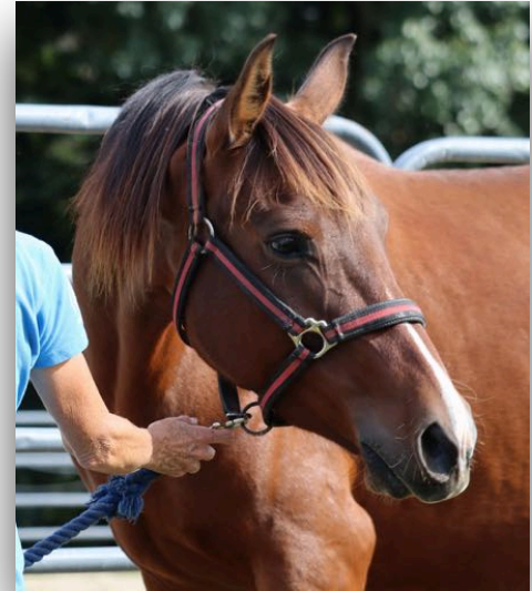
Halo

Halo's dam Stardancer is one of my favorite mares. A daughter of Starwalker , her dam *Szikra was imported from Germany and has been featured in previous NASS publications. A Saphiro daughter, she is of classic Bábolna lines including Siglavy Bagdady, Gazal, O'Bajan, Kuhaylan Haifi, Shagya, and Kuhaylan Zaid. Starwalker himself was of mostly Bábolna-derived lines and he was a great-grandson of Saphiro himself. His pedigree also contains one unusual line—that of Panama VII , a mare of Yugoslavian bloodlines containing once again the precious blood of Amurath and other lines developed in Radautz.