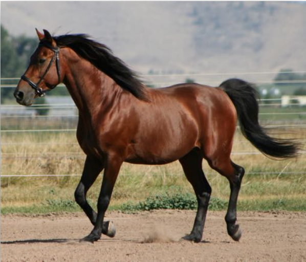
*Hadban USA at inspection