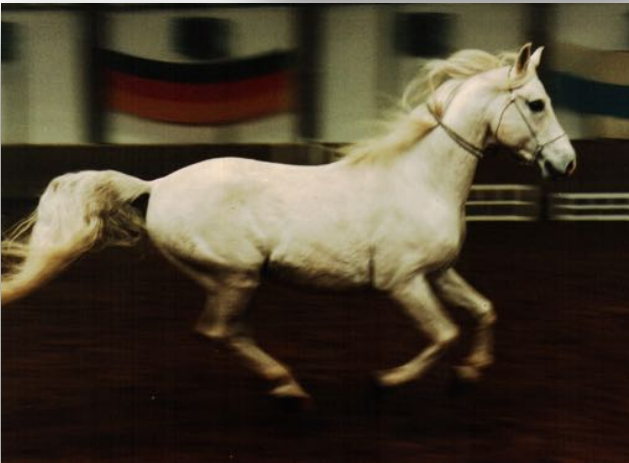
*Szikra's sire, Saphiro, who also was the sire of Navarra (mentioned in Sahara SM's pedigree)