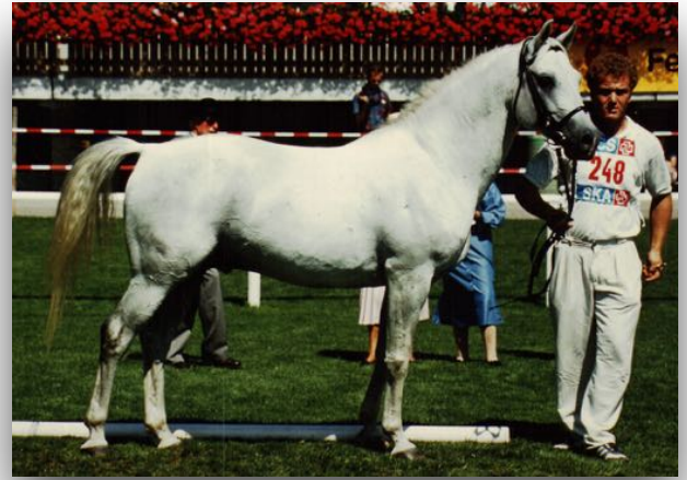
Navarrah by Saphiro x Nedda