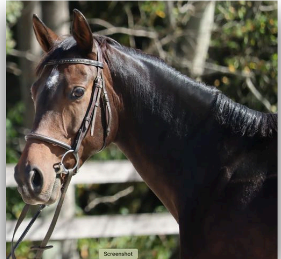
Fiona

Fiona’s dam Floyo was by the purebred Arabian Wind Khufu , and the dam was the Thoroughbred mare Fantacharm . Wind Khufu’s pedigree is a mixture of Polish Arabian blood from the famous Polish Arabians Witraz and Balalajka on the top side, and Egyptian from the EAO on the bottom side. Floyo’s Thoroughbred dam Fantacharm was a great granddaughter of Bold Ruler .