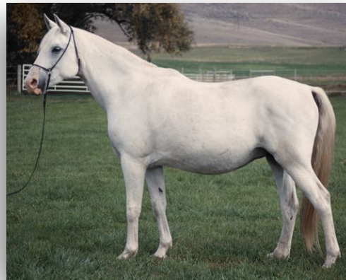
Estelle at age 8