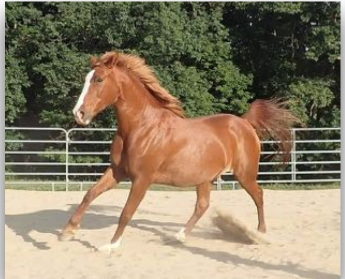
Silhouette's gallop