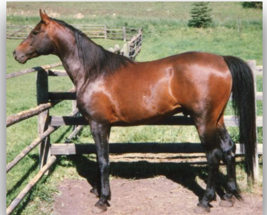
*Oman in 1989 at my place