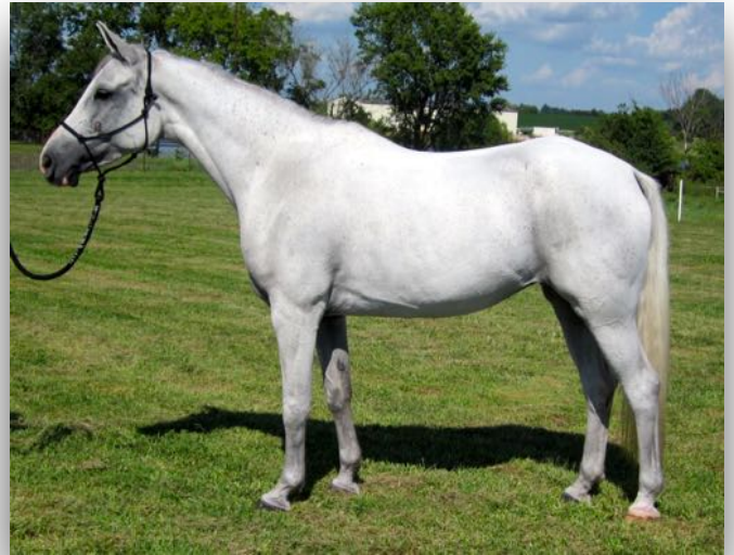
Stardancer at inspection