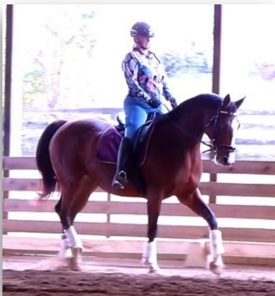
Kontessa AF (Shandor x Kadence)