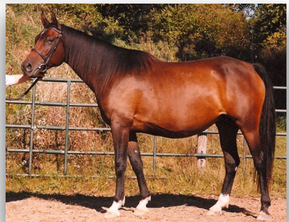
SW Selabration, dam of Sahara, at NASS Inspection