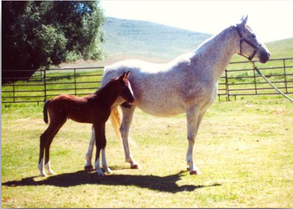
Empress Estelle AF as a foal with her dam Echo Daal