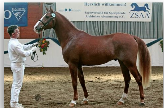
Sire of Silhouette, Reineke Zett