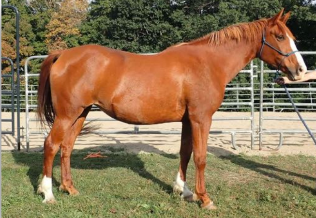
* Siglavy Bagdady Silhouette SHG #ShA-16-332 ( Reineke Zett x * Siglavy Bagdady Blanka by 3795 Siglavy XV-5 )