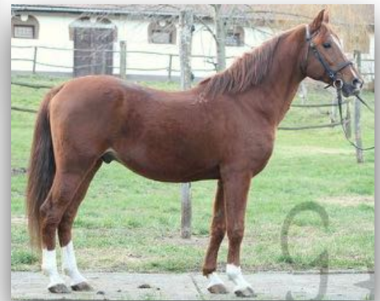
Blanka's sire, 3795 Siglavy Bagdady XV-5