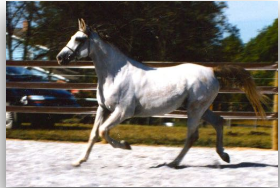
Shagya Scherzo AF at Inspection 1994