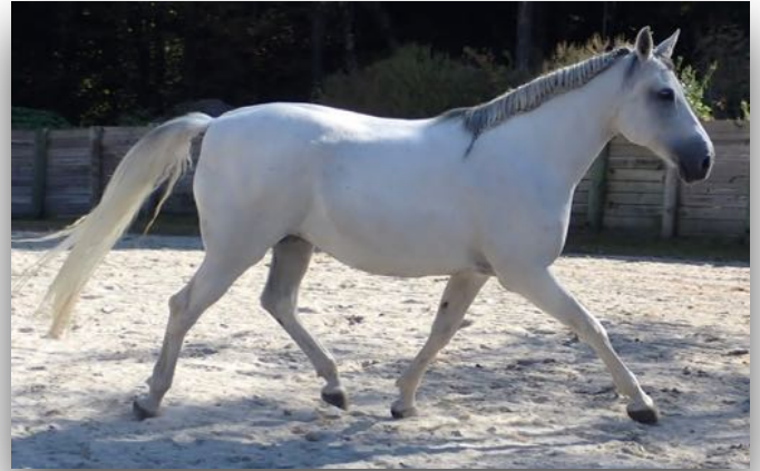
Miracola Stella