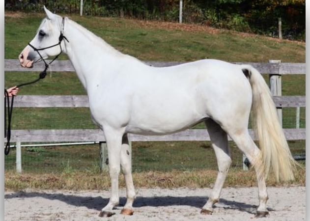
Magic Empressa #PShA-16-274 (* Magic Domino AHS ox x Empress Estelle AF by * Shandor )

Eight year old Purebred Shagya-Arabian mare. Breeder: Hallie Goetz, Owner: Hallie Goetz Height: 15.3 hh, 160 cm., Girth: 81.5 in., 207 cm., Cannon: 21.5 cm. Scores: 7,6,7,7,7,8,7,7, Average 7.0 Approved Book I A very large Shagya-Arabian mare shown in somewhat overweight condition. A rather large head which is not yet dry set on a riding horse neck. Steep shoulder, good withers and saddle area. Loins are a bit long and croup is a bit short and steep, stifles are a bit high and humerus a bit short. Good legs but the hocks are a bit small and gaskins undeveloped. Long ground-covering walk. Trot and canter could not be adequately shown.