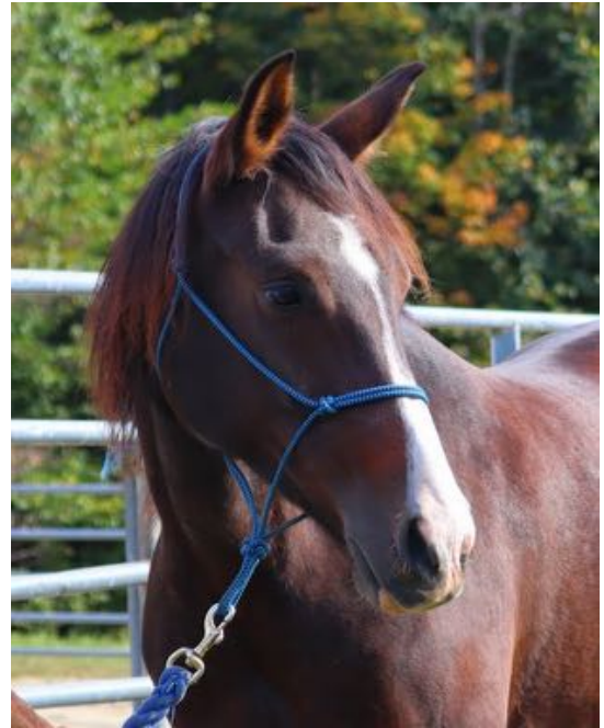
Shugaree, Jamie Bratt photo

Next we looked at Silhouette's maternal half sister, the 6 year old Siglavv Bagdady Shugaree SHG by the black stallion Onyx AF . Standing nearly 15.1 hh, her 19.5 cm cannon bone was more than sufficient for her height. She also was a bit overweight, but we were impressed enough by her classic O'Bajan type to give her a 9 for type. She had a typical O'Bajan head and a good neck with a good topline, so she received 8's for both her head and neck. Her excellent shoulder, withers extending well into her back, good topline and strong hindquarters all served to give her an 8 for body as well. Her legs not only had good bone, they were also correct, with strong joints and well-developed gaskins, thus raising her score to a 9, which is rarely given for legs. Her long and correct walk and good canter deserved 8's as well, so Shugaree's average score worked out to 8.125, the highest score of the day.