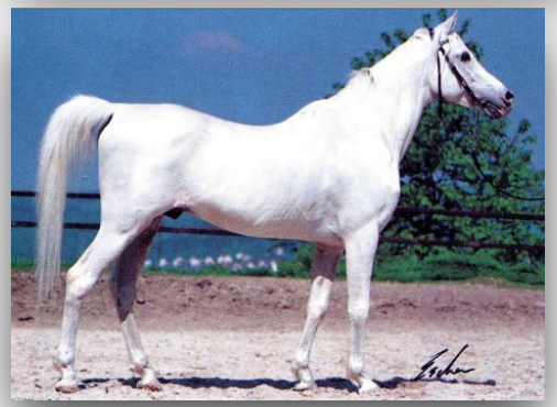
Faraq, 1962 EAO