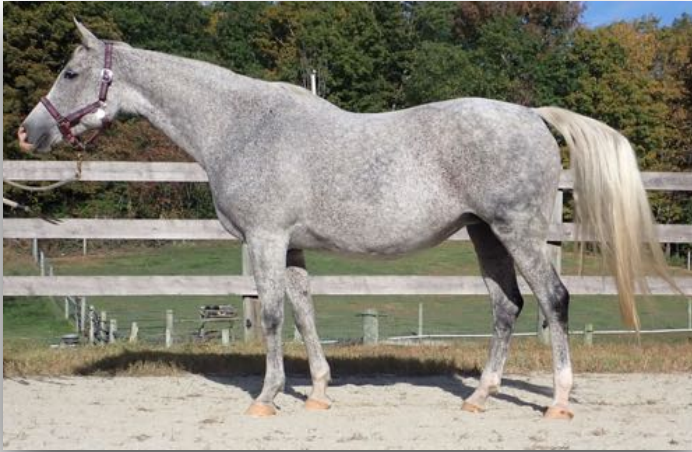
Sahara SM #ShA-11-287 (* Olivero x SW Selabration by * Oman )

Numbers are for: Type, Head, Neck, Body, Legs, Walk, Trot, Canter