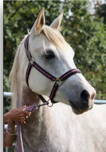
Bardot

Bardot's sire, FCF Oberon's Vanity , was approved for NASS breeding in 2017. He had gotten very good scores at his 70-day stallion test in Oklahoma and has done well at sport horse shows. On the top side of his pedigree his bloodline is all Crabbet, his grandsire being the famous Oran son, Silver Vanity . On his dam's side he is the product of Brumarba breeding which was very successful for many years. It combines Azraff blood, which brings in the Crabbet blood again, with lines deriving from several other sources. Probably the most well-known stallions from the Brumarba program were Oberon's Vanity's great grandfathers Barich de Washoe , 1965, and Comar Bay Beau , 1963.