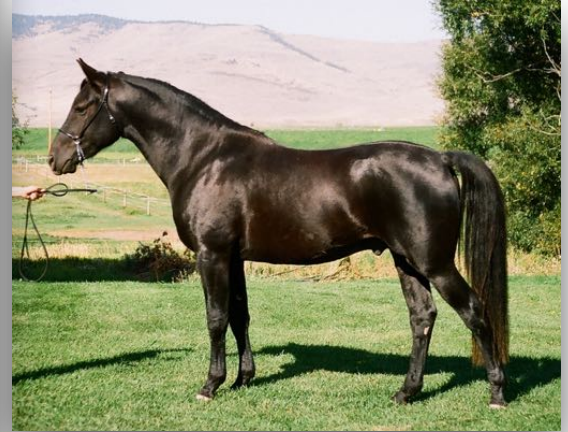
Onyx AF, sire of Shugaree, inspection 2009 photo

The Assembly of Delegates of the Shagya-Arabian Society International (ISG) 2025 will take place from 18 to 20 July as part of the XXXIII National Shagya-Arabian Show of the Czech Association (SVAZ) and the International ISG European Championships at the Martinice Horse Centre, Breznice in the Czech Republic. A very successful event had already taken place at the same venue in 2017.