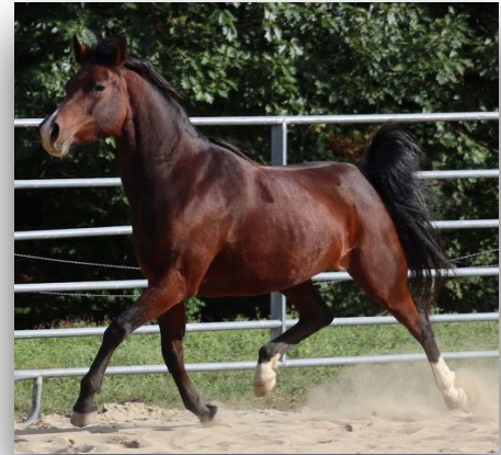
Okalani