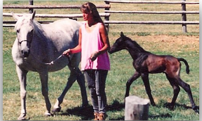
Bayram, one day old at my Open House