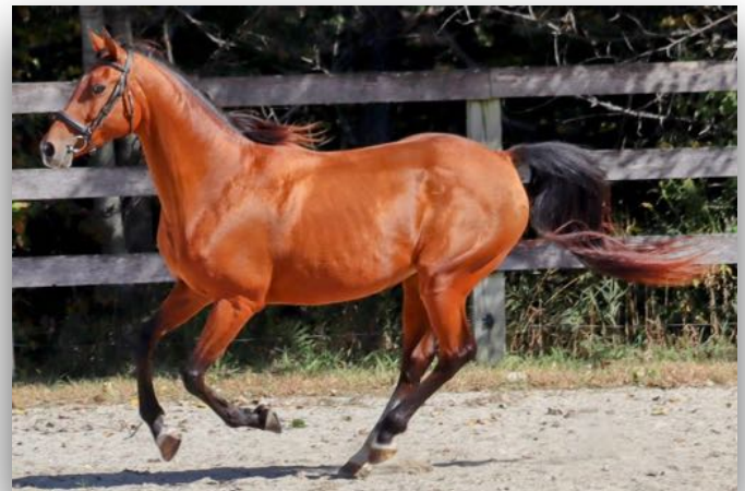
Jessica's good gallop, Skye Pechie photo