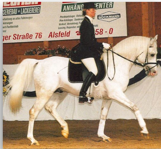
Ramiro by Hadban XVI-8