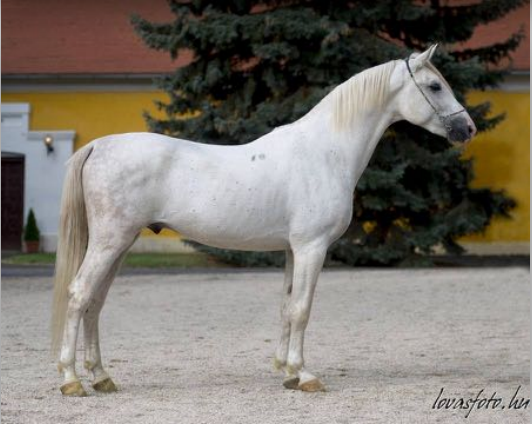
Blanka's approved son in Hungary, Siglavy Bagdady Bendeguz