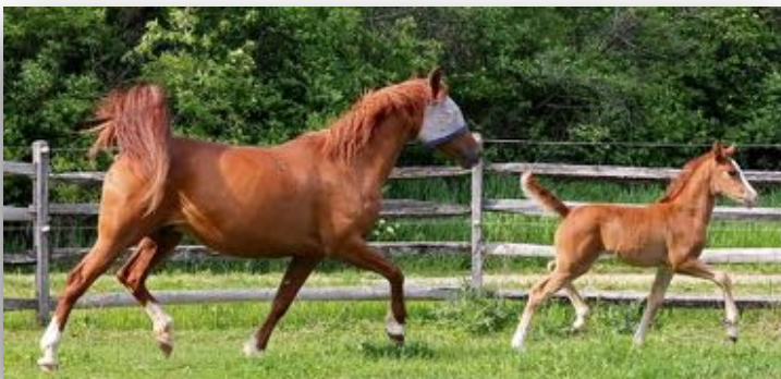
*Siglavy Bagdady Blanka with Silhouette