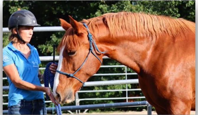
Hallie and Silhouette, Jamie Bratt photo

Following our inspection of Okalani SHG we had the interesting experience of inspecting three daughters out of Hallie's imported mare 'Blanka' by three different stallions—ages eight, six, and four. The first mare was the eight year old chestnut *Siglavy Bagdady Silhouette SHG , who was imported in utero. Silhouette impressed us as a big mare with a lot of substance. She stood 15.3 hh and her cannon bone was unusually large at 21.5 cm. She was also a little overweight which may have contributed to the impression of her big size. Her head was rather large also and not yet dry. She had some good riding horse features such as her neck and saddle area. Her long ground-covering walk was her best gait and gained her an 8. Unfortunately she was a bit too excited to show her trot and canter well, so her average score was a 7.0, and she was approved for breeding.