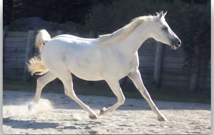
Empressa's 'impressive' trot