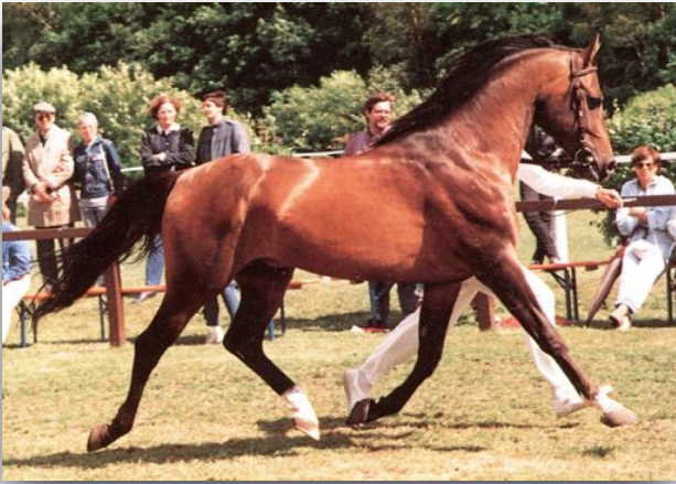
Nasrallah by Bartok x Nedda