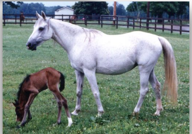
*Szikra, dam of Stardancer, (with *Oman)