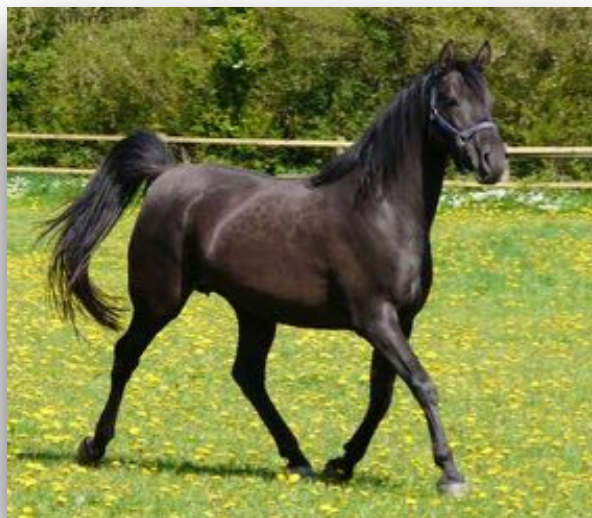
*Thassia in Germany