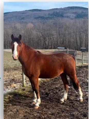
Siglavý Bagdady Sunshine SHG

We had a great time meeting all the horses presented for breeding inspection and evaluation in September here in Vermont. Please get your Shagya-Arabian horses registered and organize an inspection site in your region. It's a great way to preserve the breed here in the USA. Also, remind your friends who are breeding their mare(s) to breed to a Shagya-Arabian. There's so many to choose from. Tally ho!”