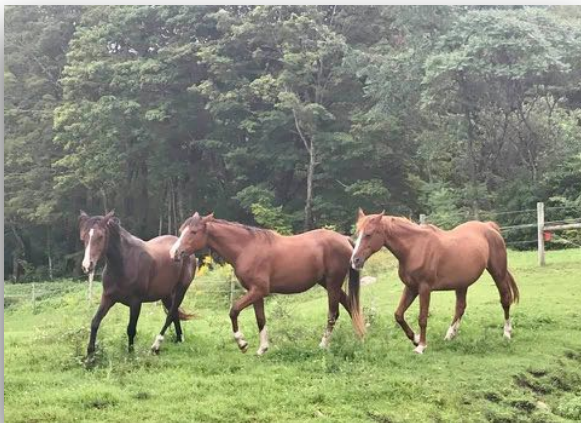
Left to Right: Siglavý Bagdady Shugaree SHG , Siglavý Bagdady Sunshine SHG and their imported dam, our mare, *Siglavý Bagdady Blanka

“ Siglavý Bagdady Sunshine SHG was in training and missed the inspection, but she came home for Christmas. We look forward to attending an inspection in 2025 with her and her full brother, Siglavý Bagdady Banko SHG .’