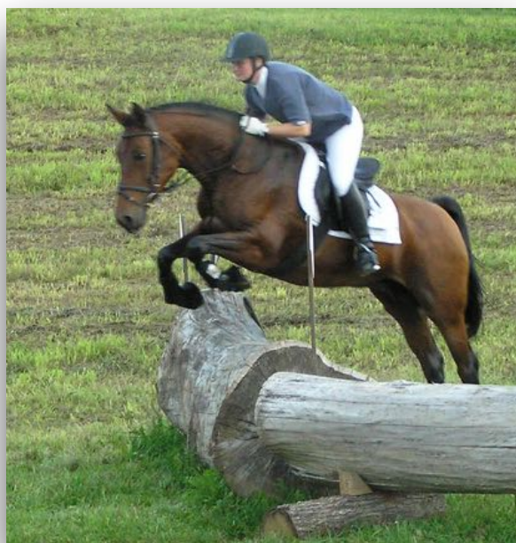
Thirza, dam of *Thassia