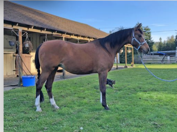
Bajara Silver SH