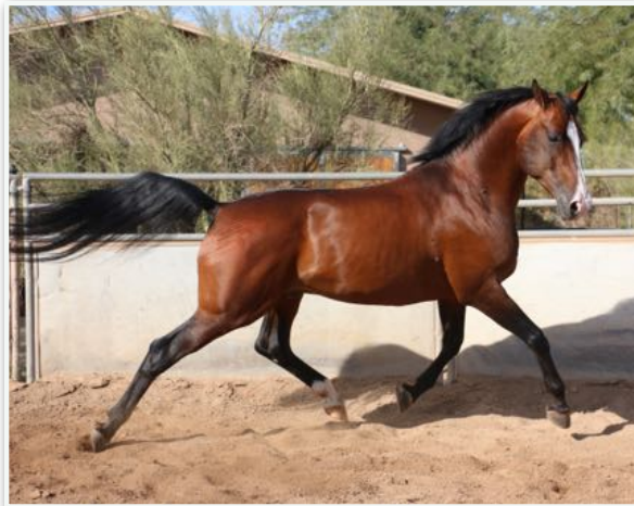
Nicolette's Revelation AF (Shagya Royal AF by *Shandor x *Nicolette)