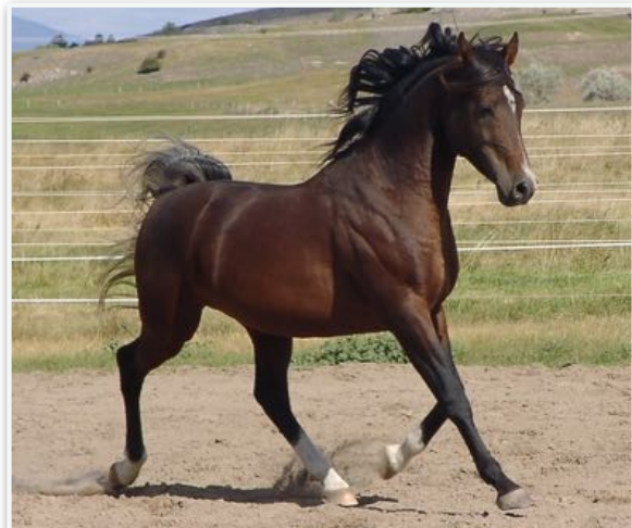
Shagya Raja AF (Shagya Scherzo AF by *Shandor x Rachelle AA)