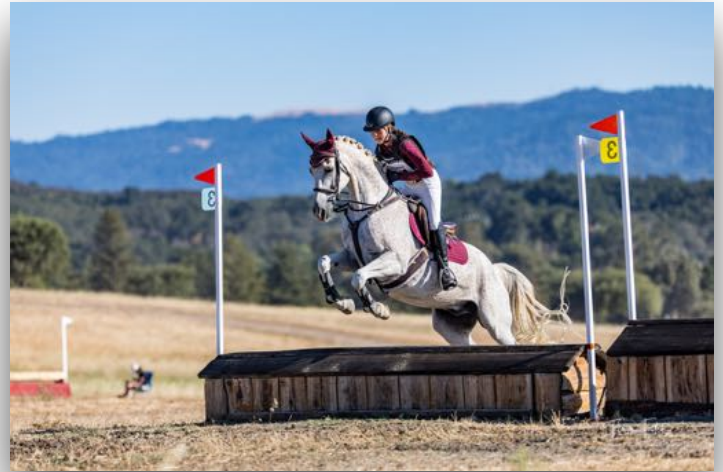
Theo the Wonder Horse