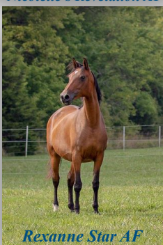
Rexanne Star AF