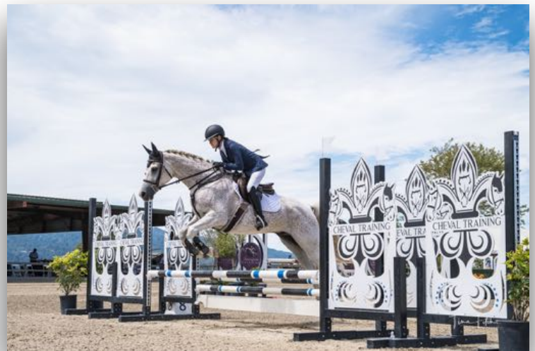
Theo the Wonder Horse