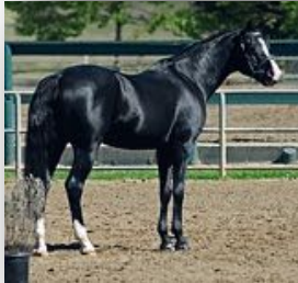
KB Omega Fahim ++++//