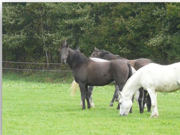
*Thassia in Germany