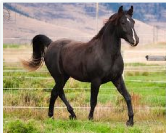
Onyx AF (Janos x MJL Shaleez by *Shandor)