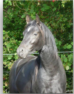
KB Tarif Fahim in Germany