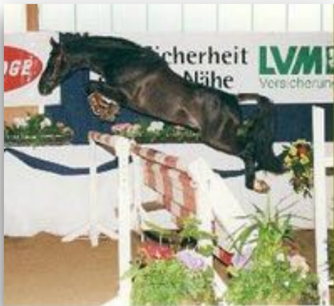
Bahadur, sire of *Thassia