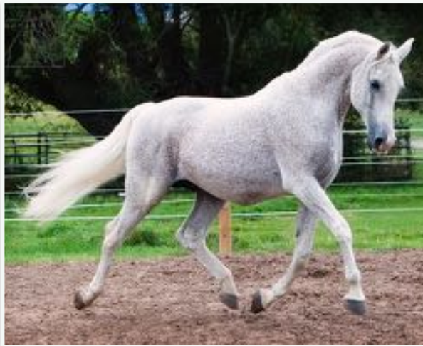
*Shandor (Shagal x 41 Shagya XXXIX) at age 23.