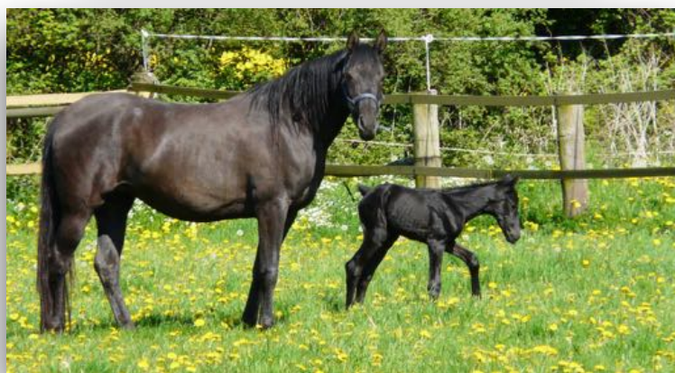
*Thassia with Shabaan in Germany