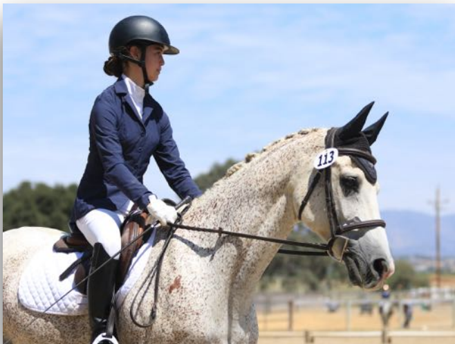
Theo the Wonder Horse