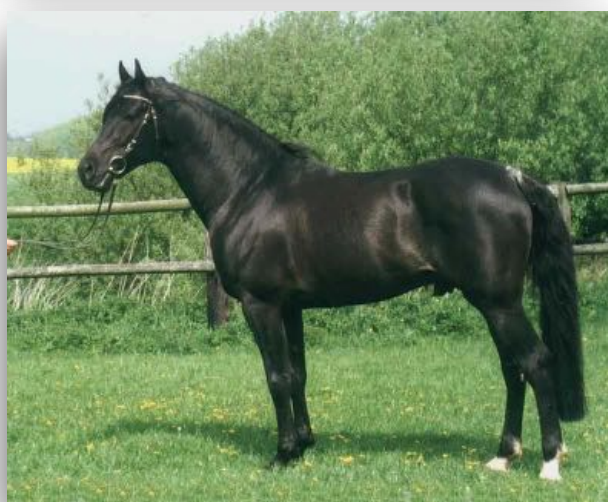
Bahadur, sire of *Thassia