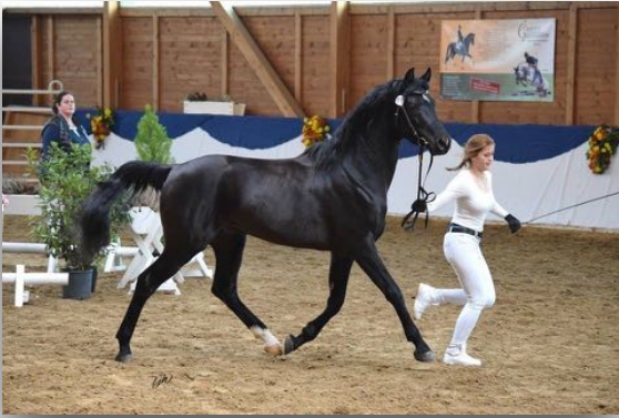
KB Tarif Fahim in Germany

*Thassia's foals by KB Omega Fahim++++// (ox)