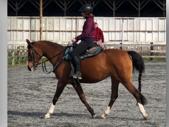
Bajara Silver SH

Endless possibilities with this pretty, flashy, big eyed and bushy tailed Shagya-Arabian filly that is also HAHR registered. She's a big, straight mover with lots of impulsion. She's very inquisitive and nothing seems to unnerve her. At nearly 10 months old, her temperament is an 8 on a scale of 1 to 10. Arabian sire (approved for Shagya-Arabian breeding), KB Omega Fahim ++++//, is highly accomplished at grand prix dressage, sport horse disciplines and multi-day endurance. Shagya-Arabian dam, Bajara Silver SH , is a lovely talented mare that is just starting her under saddle career, showing beautiful gaits and lovely disposition.