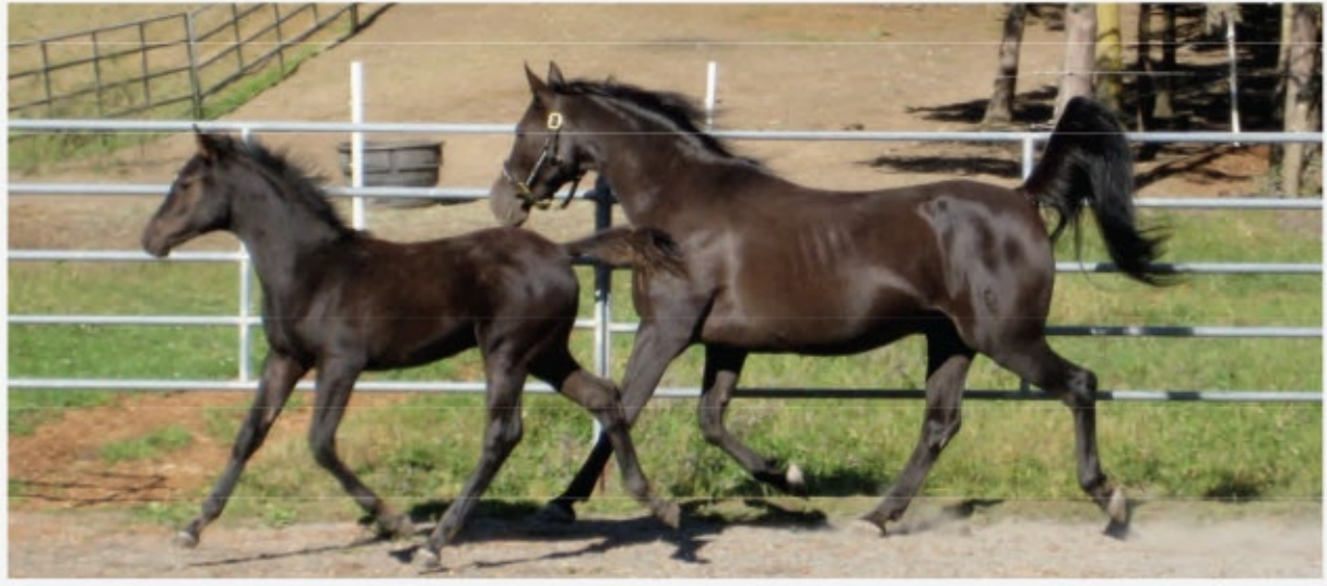
*Thassia (Bahadur x Thirza) and her 2012 colt, KB Thor Fahim, by KB Omega Fahim++++// (ox).