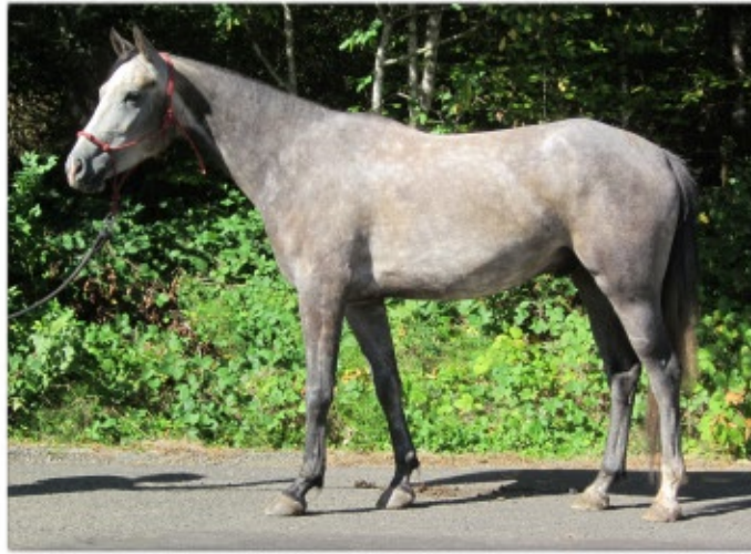
Serrano #P-Sh-11-269 (Bonus PFF x Jewel Triple Seven, Appaloosa by Brujo's Blackjack) Four year old Part-Shagya gelding Breeder: Paradise Flat Farm, Owner: Robin Fegner Height: 15.1 h, 155 cm., Girth: 67 3/4 in, 172cm., Cannon: 19.25 Scores: 7,8,8,7,7,7,7,7, Average 7.25. Evaluation An attractive Part-Shagya/Appaloosa gelding with a willing and calm attitude. Handsome head showing strong Arabian influence set on a refined neck with an undeveloped topline. Excellent saddle area. His croup is too pointed and high at the moment. Broad deep pelvis. clean dry legs. Good walk and trot, not always correct behind. Well-balanced canter for his age