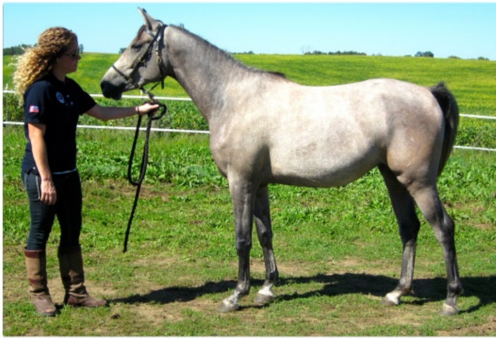
CHF Freestyle (*Hadban USA x Mattingley Freedom x Stetson)