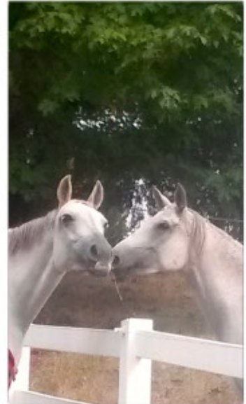
Hera AF and Sheherazade AF