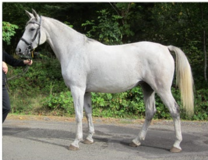
Cantata #ShA-11-297 (Atman PFF x Capri PFF by Sarvar PFF) Four year old Purebred Shagya-Arabian mare Breeder: Paradise Flat Farm, Owner: Carla Christian Height: 15.2 h, 157.5 cm., Girth: 76.5 in., 194 cm Cannon: 19 cm Scores: 8,7,7,8,7,8,7,7, Average 7.375. Approved Book I A calm big-bodied substantial Shagya mare showing a willing disposition. A Shagya head with a straight profile and a somewhat small eye. Good triangular riding-horse neck. Deep well-balanced body, smooth topline. Long shoulder a bit steep. blemished legs with especially good bone, good hock angulation. Front cannons a bit offset, long elastic ground-covering walk. Flat rhythmic trot, ordinary canter. Demonstrated carefulness and willingness though jump chute.