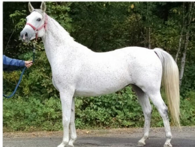
Musica PFF #ShA-05-294 (Bold Bravo AF x Shomani's Moonlight Serenade by *Budapest AF) Ten year old Purebred Shagya-Arabian mare Breeder: Paradise Flat Farm, Owner: Jeri Randall Height: 14.3 h, 145.5 cm., Girth: 73 in., 185 cm., Cannon: 19 cm Scores: 8,8,8,7,6,6,7,7, Average 7.125. Approved Book I A substantial energetic Shagya mare with a typical Shagya head with a big black eye and a straight profile. A good riding horse neck with a curved topline and a clean throatlatch set on a deep body. The back and loins are strong but long. Strong hindquarters and steep shoulder. Legs with good bone, front legs with offset cannons and toeing in. Pasterns are a bit short and her heels are low. Rather short and quick walk and canter, energetic trot.