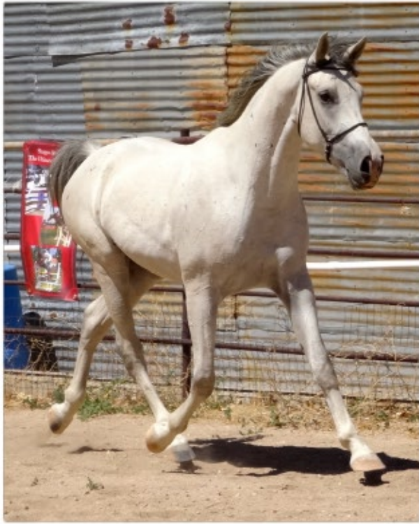
Sterling's Brigadier shows his dressage chops