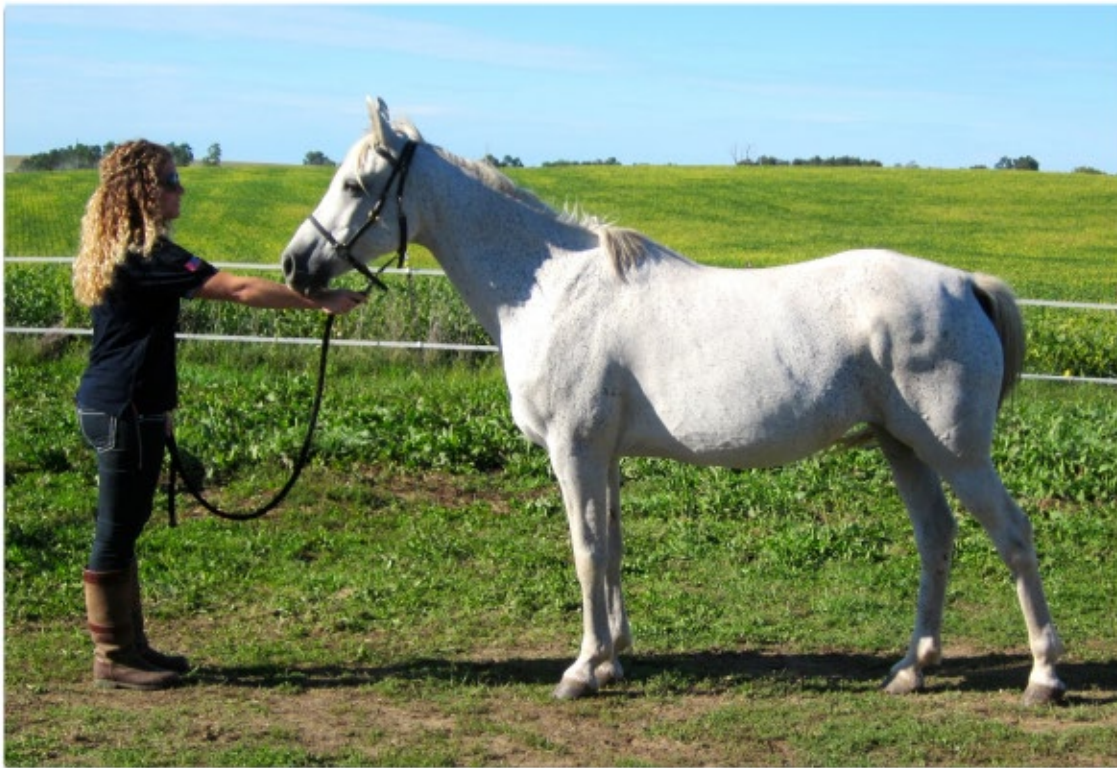
Granny's Scarlet, a registered Half-Arabian with many endurance achievements