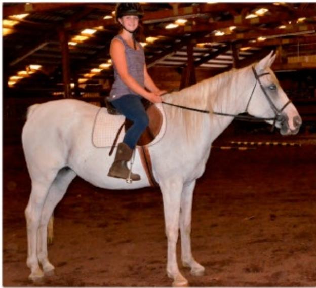
Capri PFF, ex-broodmare, now riding horse with SEO volunteer rider

The third mare we looked at was Amazing Grace, so named, I assume, because it was amazing that she survived her circumstances. "Gracie", as she is known, was in utero when her dam was rescued. Her dam, who was 22 years old at the time, had a old injury which was badly infected and she was severely underweight, so it was uncertain whether or not the filly inside of her would survive her gestation.