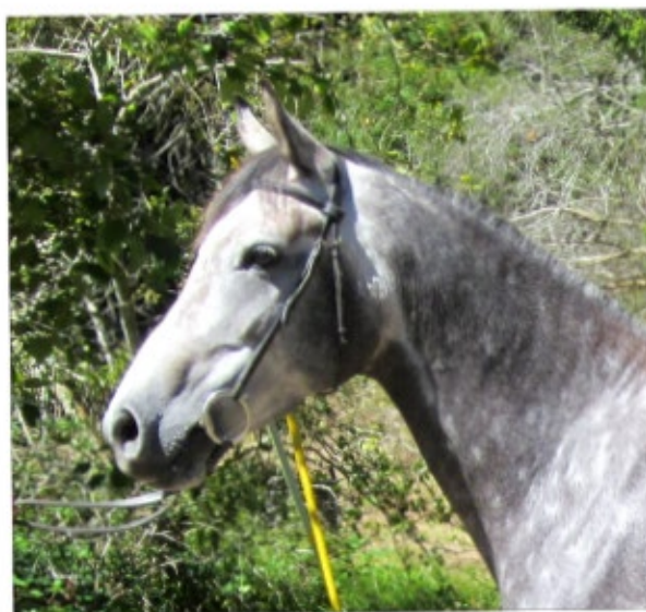
My True Companion exhibited an exceptionally fine Anglo-Arabian type