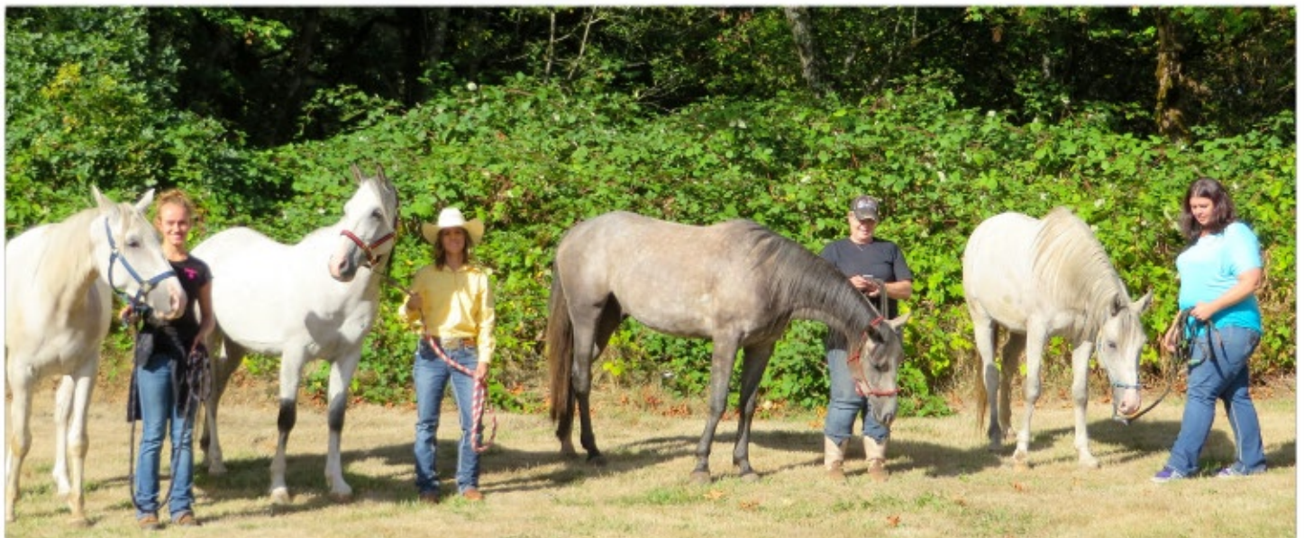
The gelding lineup: Caress' Bold Mover, Balakrishna PFF, Serrano, Badger