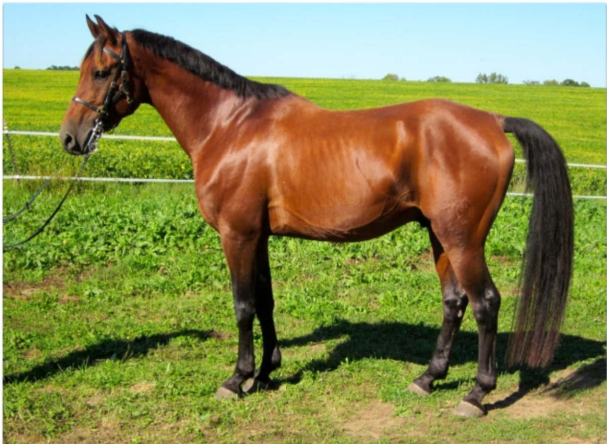
America's most successful Shagya-Arabian endurance stallion: *Hadban USA by Harapnik