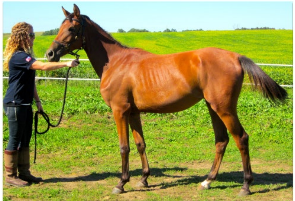
Freestyle's full sister, the yearling CHF Holiday