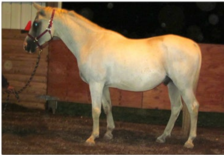
Atman #ShA-02-302 (Almos x Sjonja AA by Hungarian Bravo) Thirteen year old Purebred Shagya-Arabian gelded stallion Breeder: Paradise Flat Farm, Owner: Sound Equine Options Height: 15.2 1/2 hh, 159.5 cm., Girth: 72 in., 183 cm., Cannon: 20.5 cm. Scores: 9,9,9,8,7,9,8,7, Average 8.25 Approved Book I A majestic masculine, typey Shagya-Arabian with an expressive head with a kind eye and well-formed jawl. A triangular-shaped riding horse neck with a curved topline, and a good throatlatch set on a long sloping shoulder. Good saddle area, deep harmonious body. Strong correct legs with numerous blemishes due to injuries. Long forearms, short cannons. Long elastic walk with good rhythm and use of back. Ground-covering trot with good impulsion. Good canter.