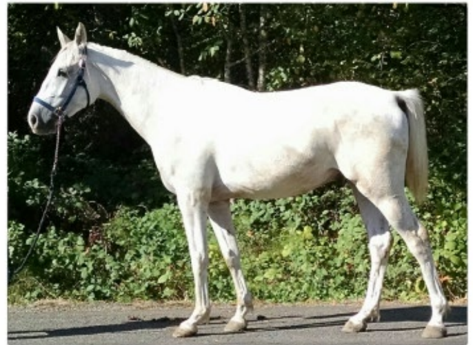
Caress's Bold Mover #ShA-12-296 (Bold Bravo AF x Capri by Sarvar PFF) Three year old Purebred Shagya-Arabian gelding Breeder: Paradise Flat Farm, Owner: Sound Equine Options Height: 15.2 h, 157.5 cm., Girth: 69.5 in, 176 cm., Cannon 18.5 cm Scores: 8,7,7,6,7,7,7,--:Average 7.0. Evaluation A good-sized Shagya-Arabian gelding with a somewhat heavy head at the moment. Undeveloped neck with good throatlatch. Good withers extending well into the back. Shoulders a bit steep and hindquarters are broad but a bit short and lack angulation. Legs with good bone. Front legs lack muscle and the pasterns are too sloping. Correct walk and trot. Canter not shown due to recent surgery.

Eureka, CA, hostess Elaine Kerrigan: Judges: Adele Furby, Kathy Richkind, Hallie Goetz