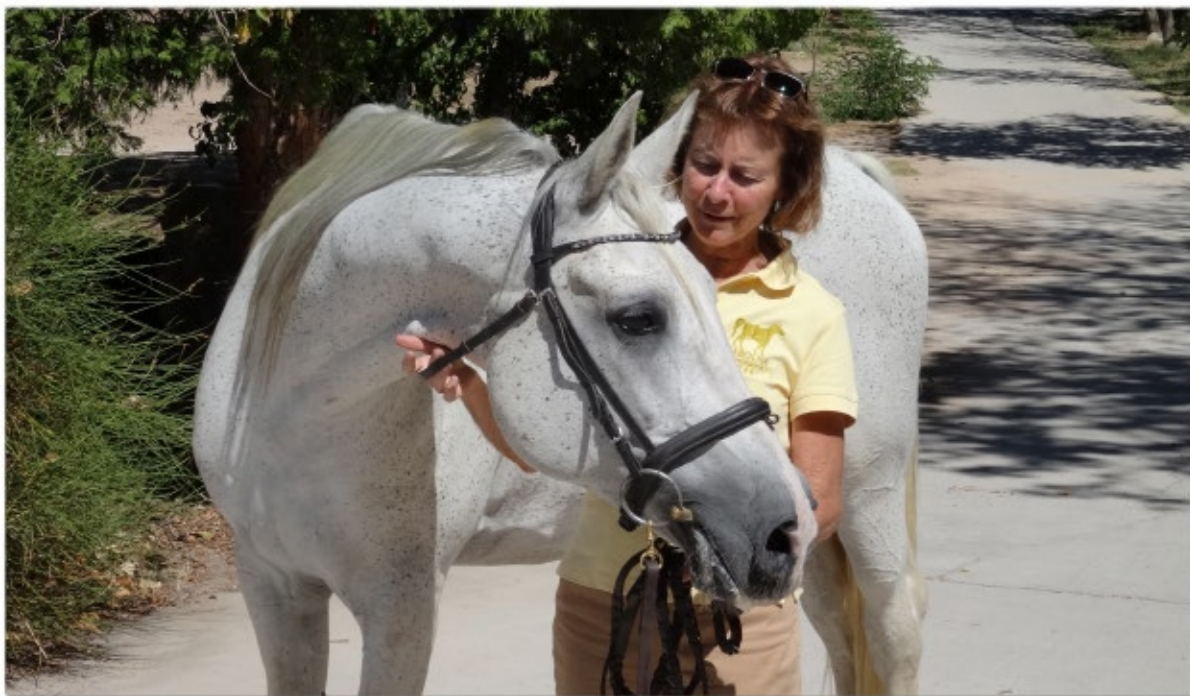
A little reunion for Sterling Silver AF and me