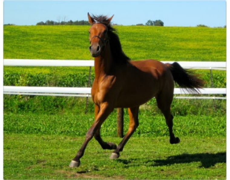
Two more views of CHF Locamotion (*Hadban USA x Granny's Scarlet)