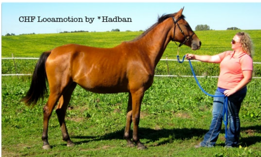
CHF Locamotion by *Hadban