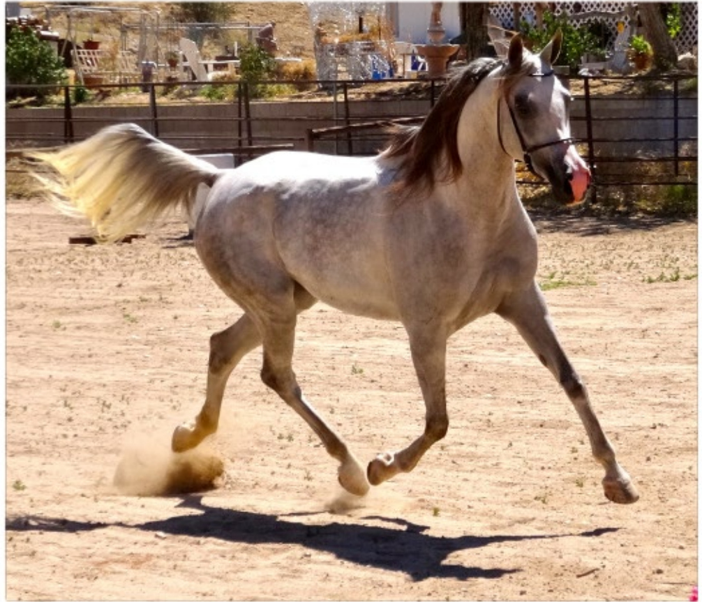
TR Amazing to Me, Arabian mare approved for Shagya breeding