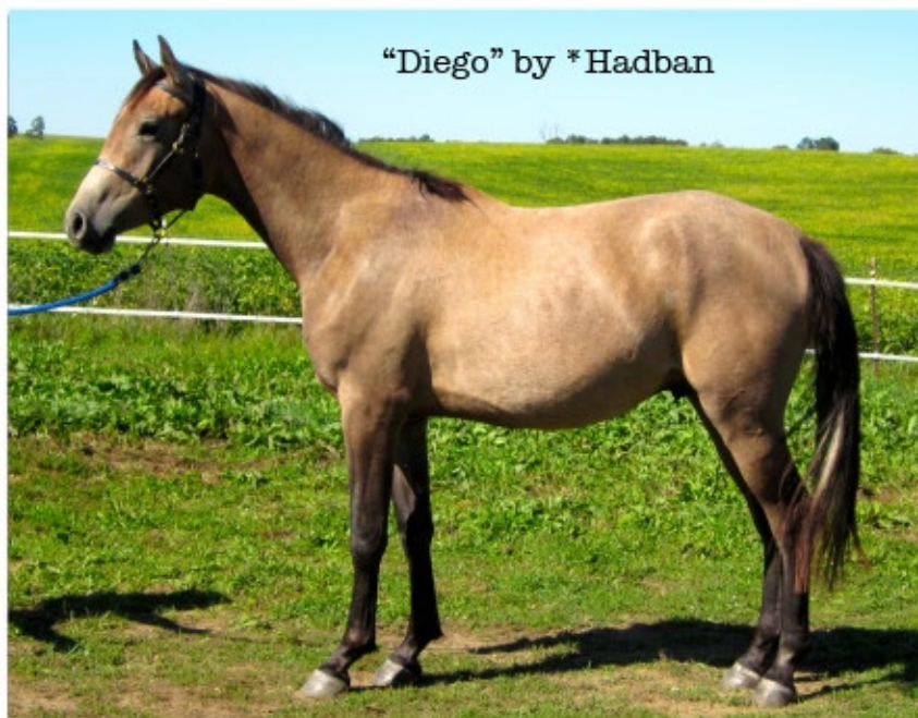
“Diego” by *Hadban

day. Diego is the the gelding's name, and he is a big, stout colt that shows excellent promise for an endurance horse. At this time he also has a very interesting "golden" color that reminds one of an Akhal-Tekke. This is of especial interest because *Hadban's bloodline from Romania has influences through the Asian horses which emigrated west into Romania. *Hadban himself is a bright bay and we have always commented on the special shiny "copper-penny" look to his coat too. Perhaps he shares some special color genetics with Akhal-Tekke ancestors and he has passed this on to Diego?