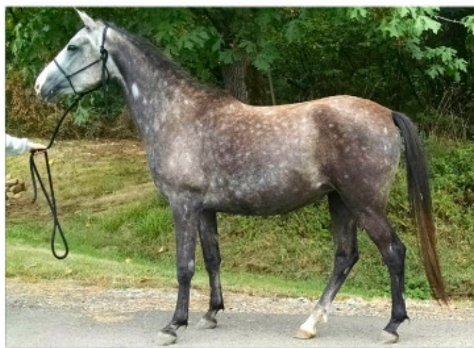
Amazing Grace #ShA-12-298 (Bold Bravo AF or Atman pending DNA x Caress PFF by *Oman) Three year old Purebred Shagya-Arabian filly Breeder: Paradise Flat Farm, Owner: Judy Auble Height: 14.1 1/2 h, 148.5 cm., Girth: 67.5 in., 171 cm., Cannon: 17 cm Scores: 7,8,7,7,7,7,8,7, Average 7.25. Evaluation An immature feminine mare exhibiting signs of gestational nutritional deficiencies consistent with her history, with a big soft eye and a straight profile. Undeveloped neck set a bit low and set on a long steep shoulder. Deep body, good withers and saddle area. Topline still developing. Broad strong pelvis lacking muscular development at this time. Hind legs with good angulation. Long forearms and short cannons, back a bit at the knees. Walk with good rhythm, back a bit stiff. Free ground covering elevated trot, ground covering undeveloped canter.