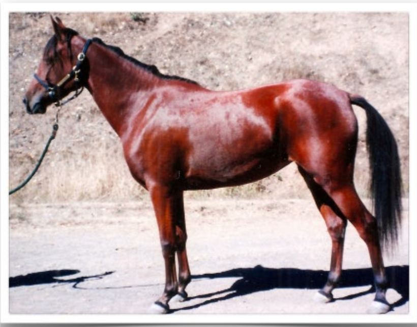
Shomani's Moonlight Serenade by *Budapest AF

At the inspection, I explained to the judges the girls' early hardships, and they were quite sympathetic. Many of the Shagyas and part-Shagyas present had been seized from their breeder and placed in rescue a few years ago. A couple of the horses present had even been born in rescue. Most of the horses had found good homes, and were now being restored to their heritage.