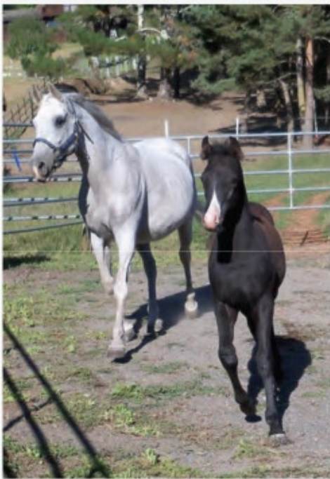
Above: Samantha (*Amurath Samurai x *Kornelia) and KB Samson Fahim her 2012 colt by KB Omega Fahim++++// (ox)