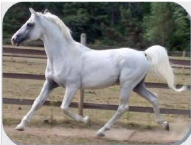
Above--Atman PFF, and below--his sire Almos, following their rescue