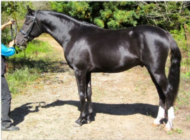
KB Tomega Fahim #ShA-13-291 (KB Omega Fahim +++++// ox x *Thassia by Bahadur)