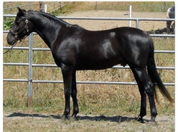
KB Thor Fahim #ShA-12-284 (KB Omega Fahim++++//ox x*Thassia by Bahadur) Three year old Purebred Shagya-Arabian stallion Breeder: Elaine Kerrigan Owner: Elaine Kerrigan Height: 15 h, 152.5 cm., Girth: 68.5 in., 174 cm, Cannon 19 cm Scores: 8,8,7,8,7,7,8,7 Average 7.5. Approved Book I An immature young Shagya-Arabian stallion with a soft kind eye on a wedge-shaped head. A good well-set riding horse neck with a slightly strong underline. A well-balanced, harmonious body, good shoulder and hindquarters. Smooth topline. Correct legs with good bone, hind leg angles a bit straight and toeing out slightly. Floating walk with good rhythm, moving a bit base wide behind. Free ground-covering trot showing good potential for lengthening. Well balanced canter for his age. Fulfilled free jumping requirement.