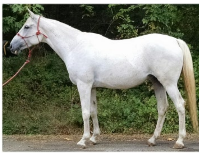
Capri PFF #ShA-05-295 (Sarvar PFF x Caress PFF by *Oman) Ten year old Purebred-Shagya-Arabian mare Breeder: Paradise Flat Farm, Owner: Sound Equine Options Height: 15.3 h, 160 cm, Girth: 75 in., 190 cm., Cannon: 19.5 cm. Scores: 8,7,7,7,6,7,9,7, Average 7.25. Approved Book I A large feminine Shagya mare with a straight profile and a kind, expressive eye and agreeable attitude. Undeveloped neck set a bit low with a dip in front of the withers. Strong body, good saddle area, the loins somewhat long and the croup a bit pointed and steep. Somewhat straight shoulder, good sloping pelvis. Legs with good bone, not well-muscled. Short cannons, soft, short pasterns, offset front cannons. Somewhat stiff walk with correct rhythm. Ground-covering, flying expressive trot. Long somewhat undeveloped canter.