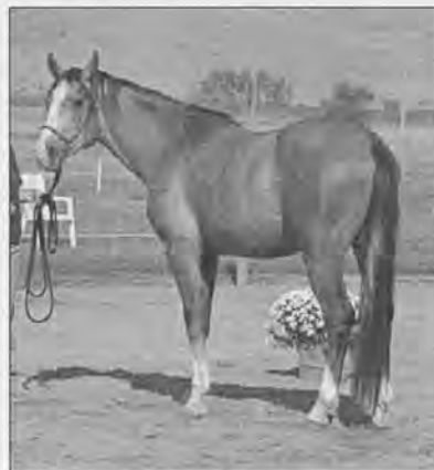
Evanescent Star AF (*Starwalker x Empress Estelle AF)