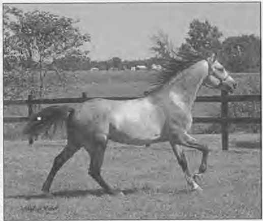
MAX (*Amurath Samurai x Kornelia) who was inspected and approved in 2003 showed his gaits at the Noble, IL, inspection site.