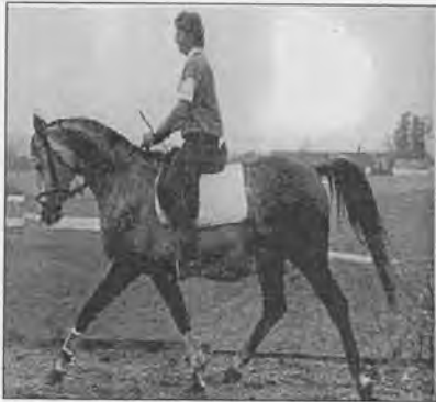
Sulayman (Nasrallah x Semira)