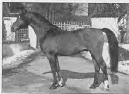
NASRALLAH (Bartok x Nedda)

pedigree contains many prominent Shagya champions.