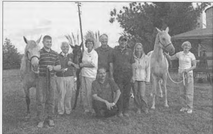
Participants, spectators and Judges pose for the camera after completing the last leg of the tour.