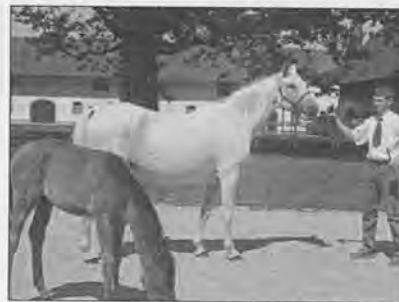
DAPHNE & *Dante as a foal at Arco.