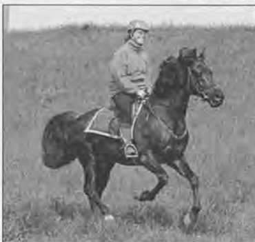
BAHADUR (Herold x Bajgala)

Bahadur's sire Herold was a rare black son of Gazal VII. Most people don't think of the Gazal line as producing blacks, and especially not the famous grey Gazal VII, whose parents were both grey. But Gazal VII apparently was not homozygous for the "Agouti" gene (the dominant gene that limits the black color to the legs, mane, and tail, and consequently makes a genetically