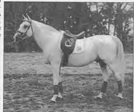
SHAGYA SCHERZO AF (*Shandor x *Aminah)

I had retained some breeding rights to Scherzo, and in 2001 I decided to breed my two Hungarian Bravo daughters Rachelle AA and Echo Daal to Scherzo. I received one shipment of semen from Scherzo, and inseminated both mares the next day. Eleven months later the two paternal half sisters foaled within ten minutes of each other!! Luckily, Scherzo proved himself to have the necessary stallion qualities to carry on this significant bloodline as a sire line.