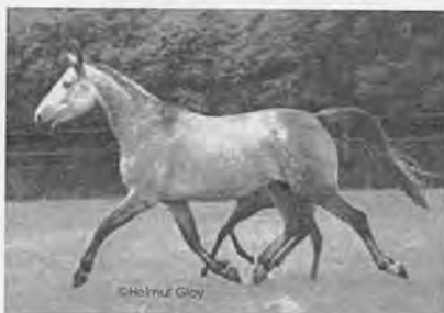
Thaya (Shagya XXXIX-11 x Tobrok-62)