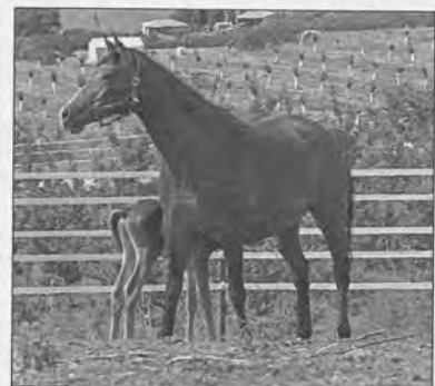
*N'Obaya (O'Bedu x Natali).