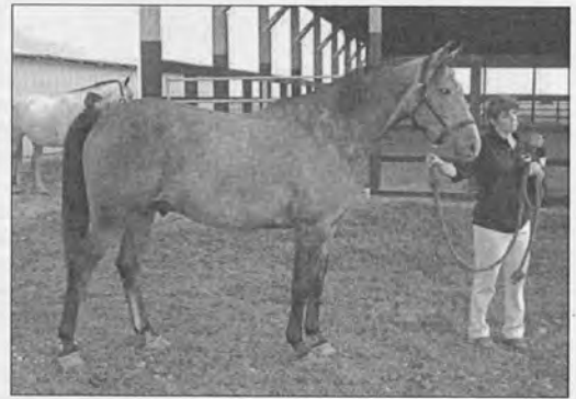
Above: Signs for the weekend. One of Wineglass Farm's geldings waits his turn for branding.