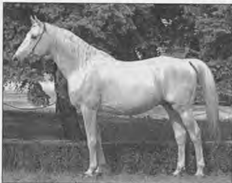
PARIS (Bartok x Pamina) (Gazal XIX at Bábolna)