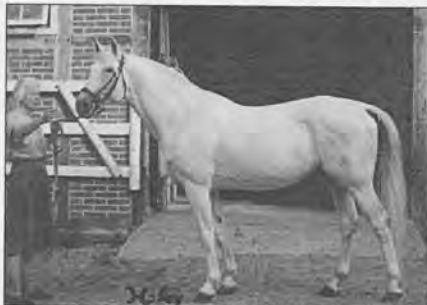
Shagya XXXIX-11 (Shagya XXXIX-1/XLVI x Drau (169 Shagya XXXII-2)

Their dam, *N'Obaya, is sired by O'Bedu (Obelisk x Kemira). Obelisk is a full brother to a stallion that should be familiar to NASS members, none other than *OMAN (O'Bajar x Marzalla). *N'Obaya (O'Bedu x Natali). Her dam, Natali, was sired by IBN GALAL-6 (Ibn Galal ox x 31 O'Bajan X) and out of *NEDDA's namesake, Nedda (Jussuf VII x 288 O'Bajan X). Nedda is also the dam of the stallion NAVARRA by Saphiro who readers may recognize as the sire of *AMURATH SAMURAI. For additional information on the Atams' mare lines please see the Inspection Tour 2003 issue of NASS News.