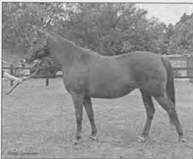
WINEGLASS SHERRY (*Budapest AF x Wineglass Voodoo ox) 1999 Chestnut Part-Shagya-Arabian Mare. Breeder & Owner: Linda L. Rudolphi. Measurements: Height: 148 cm (14.2 1/2). Girth: 191 cm. Cannon: 18.5 cm. Scores: 7,7,7,7,8,8,7. Average: 7.25. Chestnut Shagya mare with deep body and wide chest. The neck is a bit low set. Long body well muscled & good positioned croup. Good Legs. Ground covering walk w/swinging back. Trot w/good rhythm & energy. Canter could have more forward impulsion. Approved for Shagya Breeding.