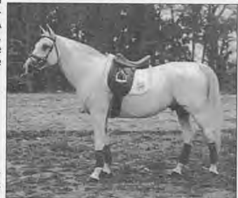
SHAGYA SHERZO AF (*Shandor x *Aminah)

I had retained some breeding rights to Scherzo, and in 2001 I decided to breed my two Hungarian Bravo daughters Rachelle AA and Echo Daal to Scherzo. I received one shipment of semen from Scherzo, and inseminated both mares the next day. Eleven months later the two paternal half sisters foaled within ten minutes of each other!! Luckily, Scherzo proved himself to have the necessary stallion qualities to carry on this significant bloodline as a sire line.