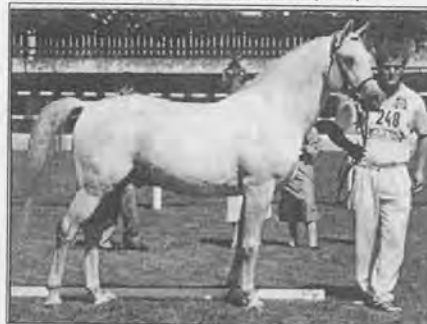
Navarra (Saphiro x Nedda)