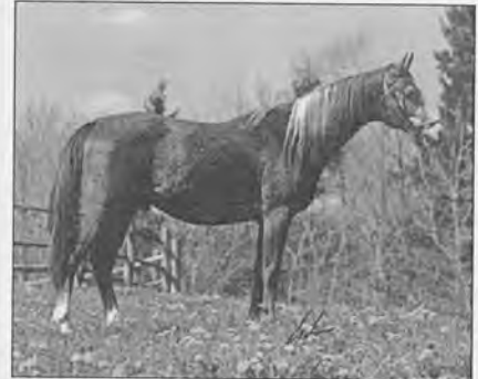
Lenkoran II: Lenkoran as a coming three year old.

ously represented in North American Shagya bloodlines through the imported mares *Aminah and *Kornelia.