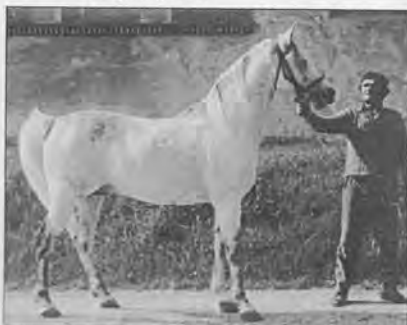
Tobrok ox (Anter ox x Tanta ox)