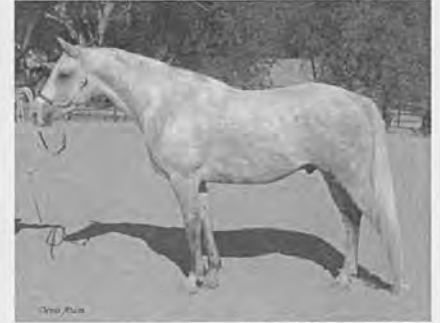
SHALOM PFF (Almos x Sjonja AA) 2001 Grey Gelding Breeder: Nancy Skakel. Owner: Richard Sacks. Measurements: 157 cm (15.2). Girth: 188 cm. Cannon: 20 cm. Scores: 7,7,6,8,7,8,7,9. Average: 7.38. Strong powerful gelding w/good proportions. Friendly head. Neck could be a bit longer. Good topline, w/good saddle area & well muscled hind-quarters. Joints could be more pronounced for his size. Trot w/good knee action. Powerful uphill canter w/good rhythm. Good Character. Evaluation.