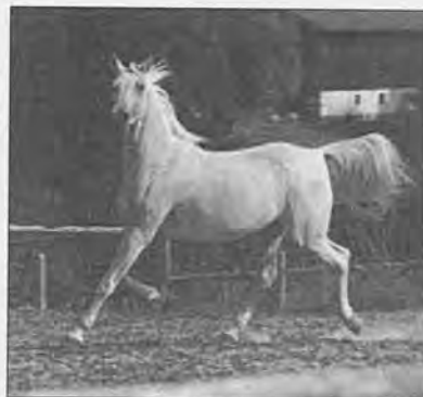
Nedda (Jussuf VII x 288 O'Bajan X)

ously represented in North American Shagya bloodlines through the imported mares *Aminah and *Kornelia.