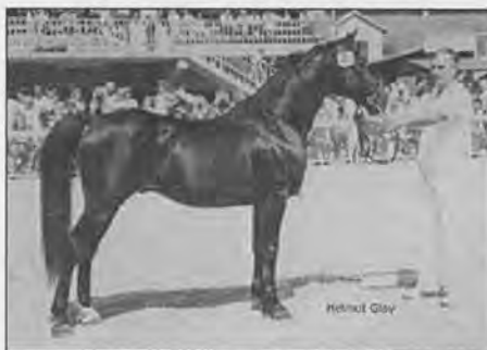
HEROLD (Gazal VII x Hera)