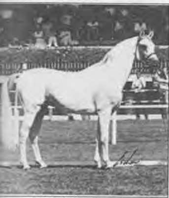
PAMINO (Bajar x Pamira)

and worsening heart-disease. He was remains one of the most popular Shagya breeding stallions at Bábolna and his semen is still available.