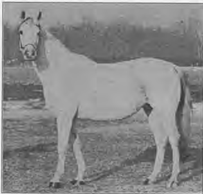
SEMIRA (Sambesi ox x 4 O'Bajan XIII)