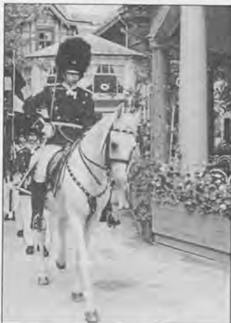
Above: Koheilan -I (Koheilan X x 98 Shagya XXXIII) (DK) Photo Ulla Nyegaard.

Please see the NASS News Inspection Issue 2003 for additional information and photos of the aforementioned horses.