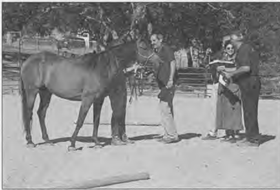
The Inspection Team at work, Sacramento, CA site.

walker and Harapnik. It was very interesting to see these beautiful representatives of such a variety of bloodlines. Unfortunately the young and immature Harapnik son had suffered a recent injury and could not move to best advantage so it was recommended that he be evaluated again in three years. Two *Shandor daughters and one Janos daughter were then presented, with one of the highest marks of the tour going to the elegant Sheherazade, sired by Shandor out of the *Oman daughter Sapphire.