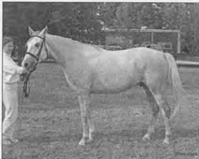
SHAGYA EMIR AF (Shagya Scherzo AF x Echo Daal) 2002 Grey Gelding Breeder: Adele Furby. Owner: Theresa L & Phillip Hey. Measurements: Height: 156 cm (15.1 1/2). Girth: 190 cm. Cannon: 20.5 cm. Scores: 7,6,6,7,6,7,9,8. Average: 7.00. Sturdy Shagya gelding. Neck could be a little bit longer. Well pronounced withers. Wide chest. Good back. Hindquarters could be deeper. Leg joints could be stronger. Walk could be more ground covering. Wonderful swinging trot w/ much expression. Uphill canter. Typical sporthorse prospect. Evaluation.