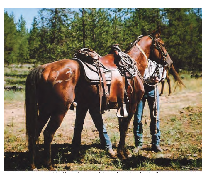
Hadban having his pulse checked after trotting out