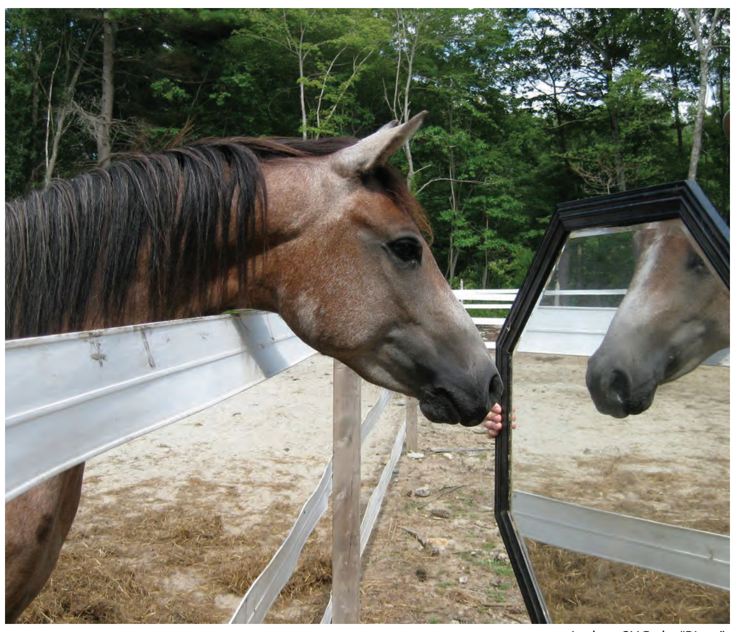
Ledger SHG aka "River"