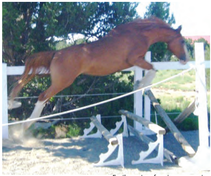
Emilagra in a free jump exercise