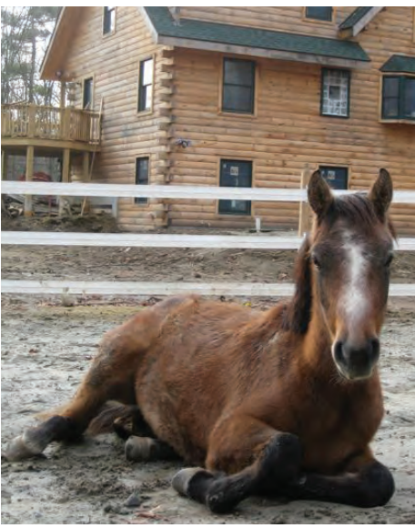
Ledger SHG, aka "River"

I got my first Shagya, Ledger SHG (Neddor/*Lutka-62 by Lumbusch - 51), aka "River", a 2008 bay-goinggray gelding. He joins my 1987 Polish Arab mare and my husbands' aged spotted draft gelding, and we are absolutely crazy about him. He has been a joy from the beginning, including during his move, settling into a brand new facility, training, etc.