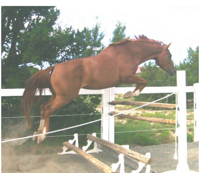
Like mother like daughter! WS Elodie free jumps, too.