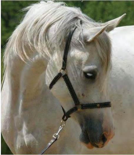
Lily Creek Diva Dance