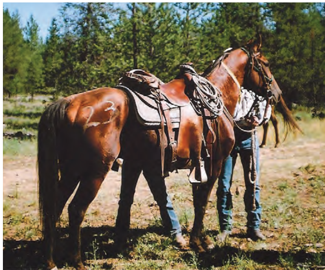
Hadban having his pulse checked after trotting out