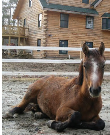
Ledger SHG, aka "River"

I got my first Shagya, Ledger SHG (Neddor/*Lutka-62 by Lumbusch - 51), aka "River", a 2008 bay-going-gray gelding. He joins my 1987 Polish Arab mare and my husbands' aged spotted draft gelding, and we are absolutely crazy about him. He has been a joy from the beginning, including during his move, settling into a brand new facility, training, etc.