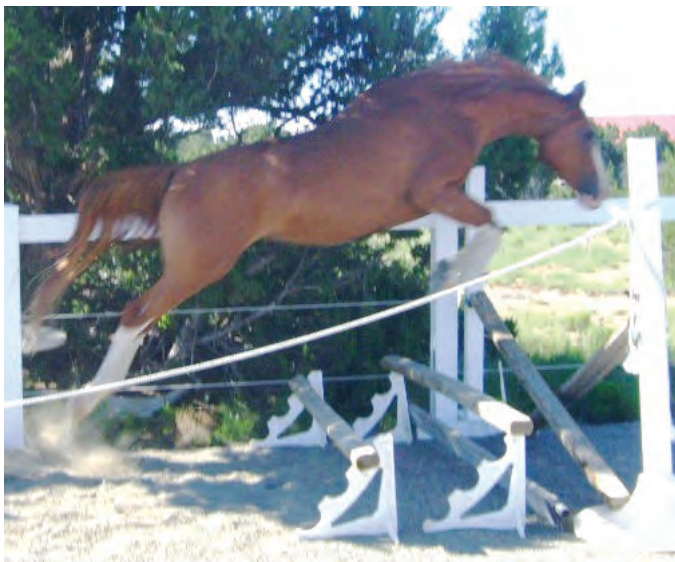
Emilagra in a free jump exercise