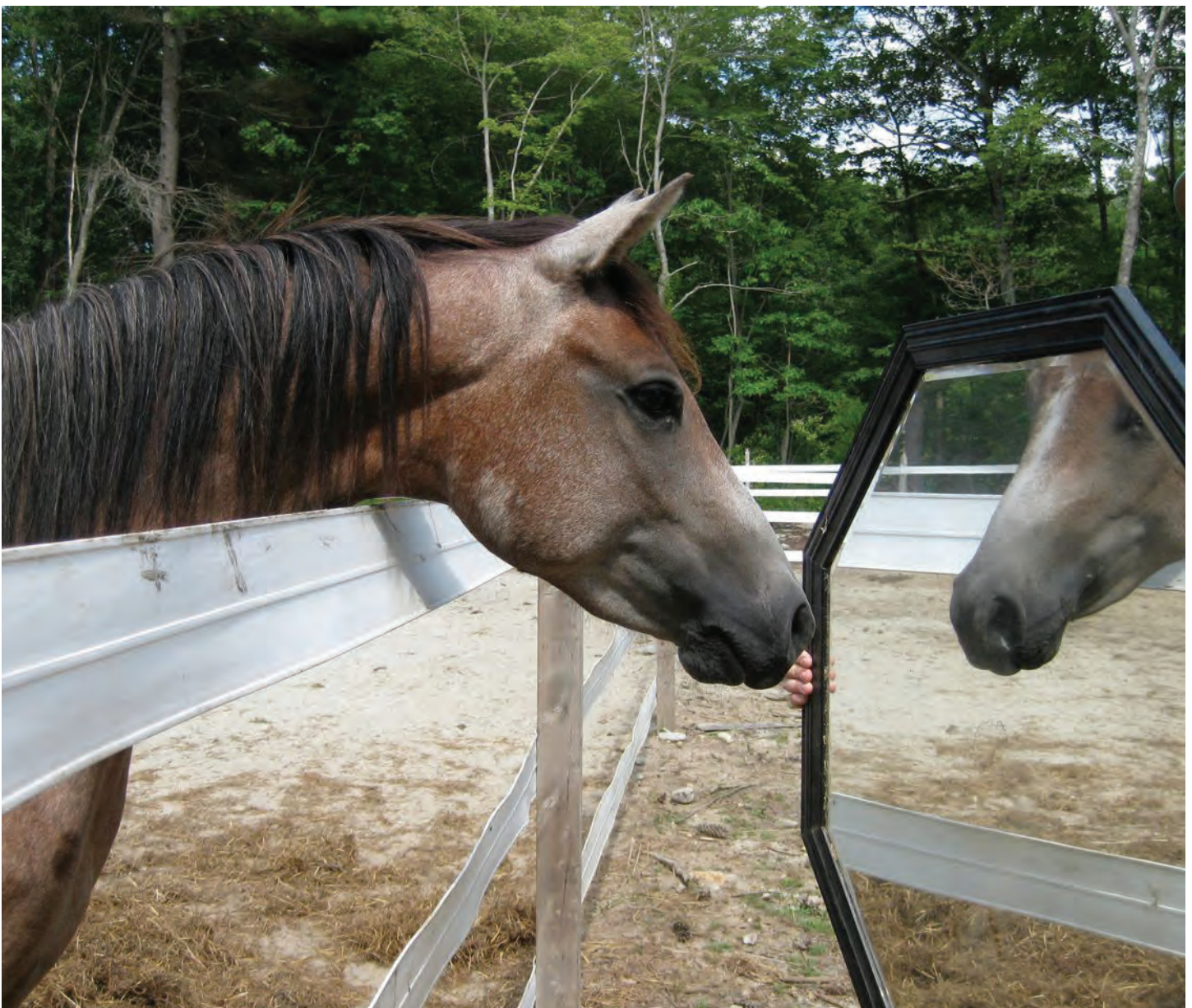
Ledger SHG aka "River"