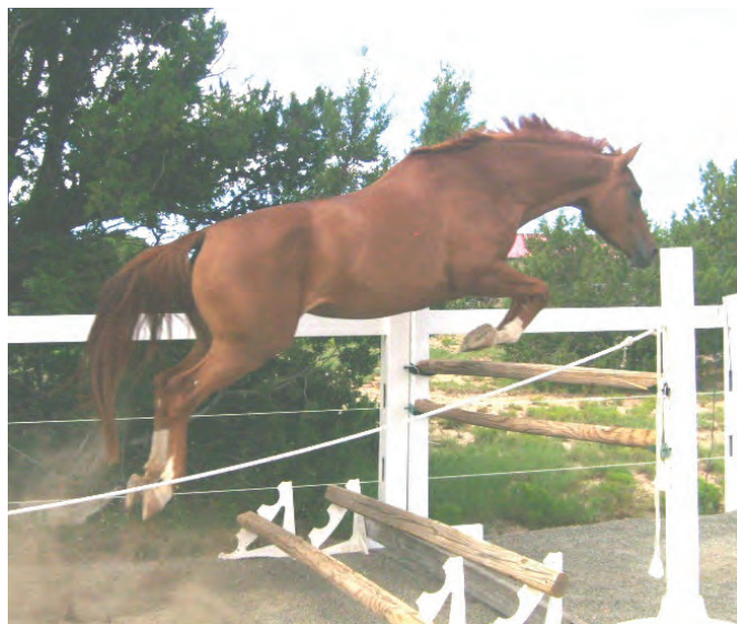
Like mother like daughter! WS Elodie free jumps, too.