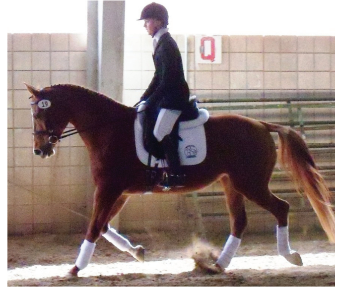
WS Elodie under saddle.