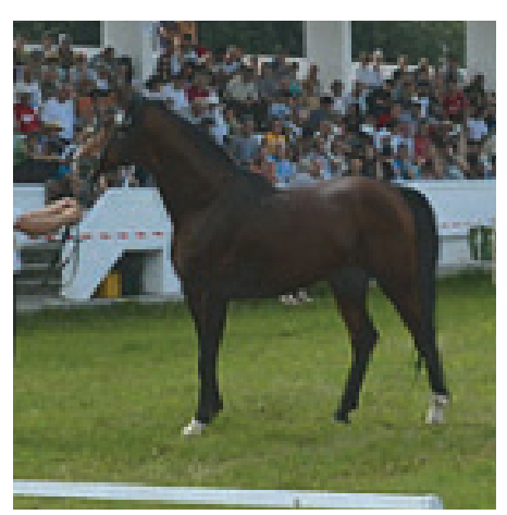
Hadban XXXVII at the Radautz show grounds.

The French Shagya Society has invited the ISG to have its 2012 Delegate Conference in France in June of 2012.