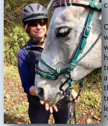
"Nobbin", L'Amor SHG (KS Rubin x *Lutka-62)

🖊 at a walk and a trot. She tells me I do an excellent Job of taking