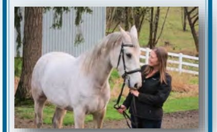
A pony for Christmas? Read this issue's "Journeys" story on page 6.