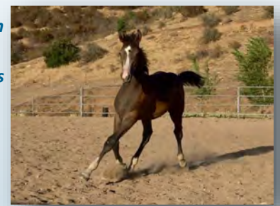
Also for sale is 2017 Trakehner colt Navigator's Song SH

Sterling's Brigadier SH has been sold as an endurance prospect! It was love at first sight with his new owner and we hope to see big things for him. Tevis is her goal.