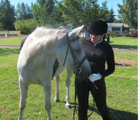
Cantata (Atman PFF x Capri) was approved by NASS in September 2015

SEO believes in letting youngsters mature and get a good start before they are adopted, so Wookie had time to grow up. As the months passed, I started with a little lunging, wearing a surcingle, then a bit and bridle. Finally she was wearing a saddle and working in hand, and I decided to climb aboard. It was all so easy. I figured she would just be that much further ahead for her eventual adoption.