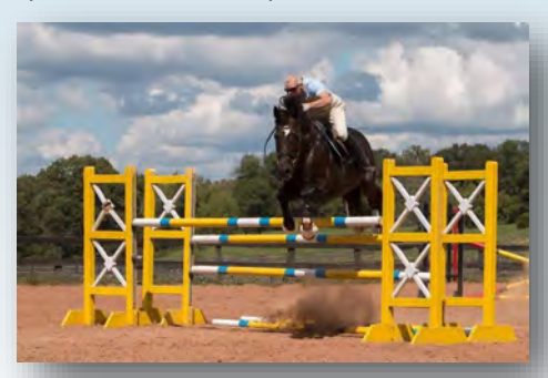
Imported from the EU, *Plutarches has lines that go back to Paris ShA.

A warm welcome to recently NASS registered part Shagya stallion * Plutarches (Perfectum x Cassini).