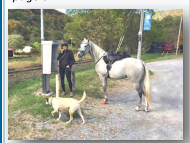
Campfires, creeks and payphones: a young Shagya learns about wilderness camping on page 4.