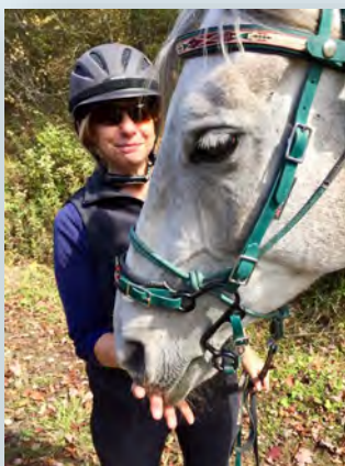
"Nobbin", L'Amor SHG (KS Rubin x *Lutka-62)

I came to live with my mommy two years ago; she needed a dependable horse to help her get back on the trail after a horrible accident. I hear her talk of how it took her six months to walk and talk after her accident. She loves me dearly. I try to guide her gently on the trails at a walk and a trot. She tells me I do an excellent job of taking care of her.