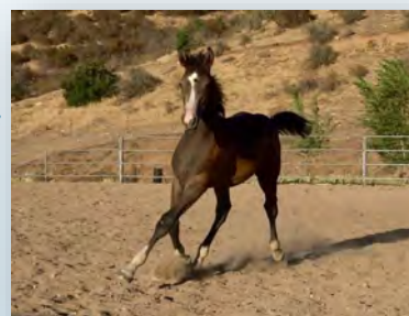
Also for sale is 2017 Trakehner colt Navigator's Song SH

Sterling's Brigadier SH has been sold as an endurance prospect! It was love at first sight with his new owner and we hope to see big things for him. Tevis is her goal.