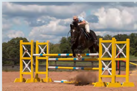
Imported from the EU, *Plutarches has lines that go back to Paris ShA.

A warm welcome to recently NASS registered part Shagya stallion * Plutarches (Perfectum x Cassini).