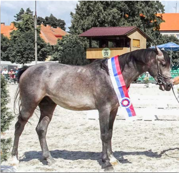
Junior Champion Stallion, Koheilan XV-3, 2019, Bábolna