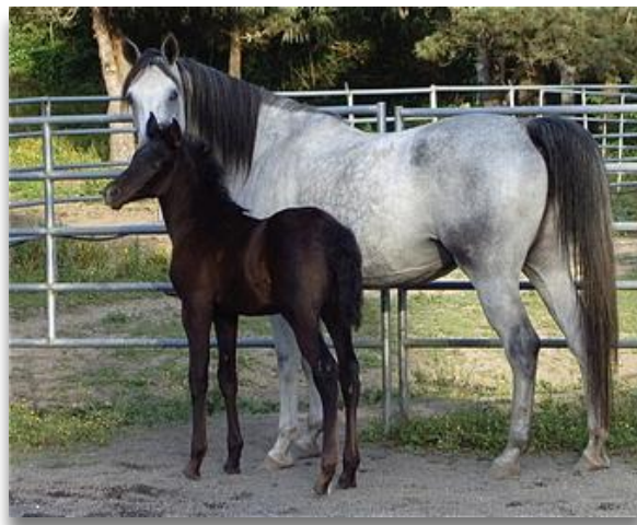
Baby Shaka and mom Shagya's Sza Sza AF