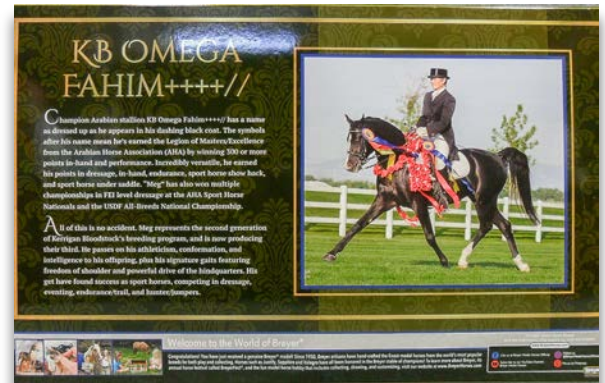
Breyer packaging, featuring "Meg"