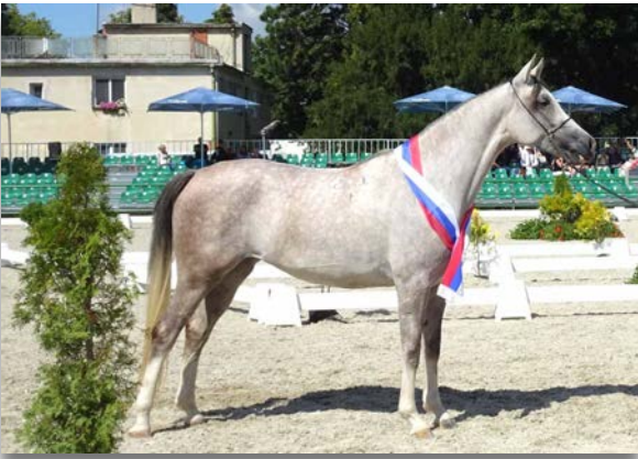
Junior Champion and Reserve Show Champion Mare, Koheilan XV-3, 2018, Bábolna