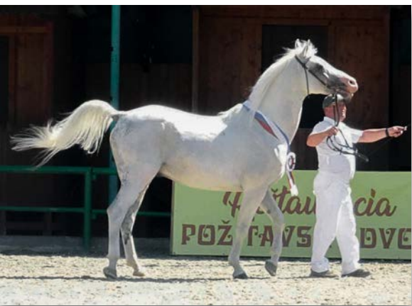
Champion Stallion, 54 Shagya XXXII, 2005, Topolcianky

The breeder's evening at the wine farm could not be missed. Concluding the 100th anniversary on Saturday afternoon, a fine gala program was presented on the racecourse with numerous equestrian games, classical riding, and carriage driving, including historical carriages up to six-in-hand. A special appearance was made by the famous Bábolna five-in-hand carriage featuring matched Shagya-Arabian gray mares.