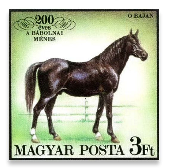
Postage stamp issued in Hungary in commemoration of the 200th anniversary of the founding of the Babolna Stud.