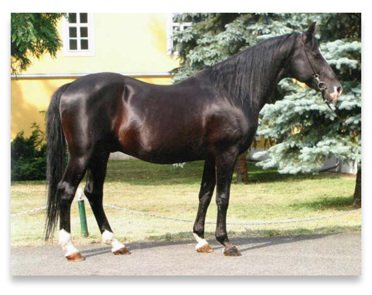
Top: Batan, the only son of Badan, 1984, Himmelried, x O'Bajan I-17, who became O'Bajan XVIII, Babolna

Batan grew up, passed his performance test and became an approved stallion. Among the Shagya-Arabian breeders in Europe, it became known that that there was a real black O'Bajan in Switzerland. A commission from the National Stud in Bábolna travelled to Switzerland, where they saw Batan and decided they wanted him for the stud. Batan , now called O'Bajan XVIII , became the main stallion at Bábolna. Batan has gone to greener pastures now, but he left behind a legacy of 60 offspring listed in the Swiss database.