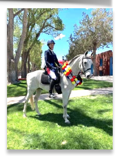
Midas and Lala are full siblings out of MJL Olivia by Santana AF ox.

Lala (bottom left) won Dressage Type Open, Dressage Type ATH, Hunter Type Open and Hunter Type ATH.