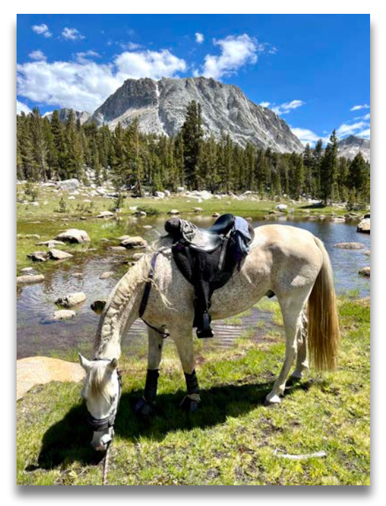
Theo enjoying a snack break with Vogelsang in the background

The last few miles from Vogelsang back to the trailhead were gentle single track punctuated by granite steps. All told the loop was just under 20 miles, and had 13,270' of total elevation change. We only walked, so the total ride time was about seven hours. We also stopped every hour or so for Theo to munch on the copious meadow grass, so that added another 2 1/2 hours to the day. It was nice to have easy access to water and grass for most of the ride and Theo really enjoyed that aspect! One thing he did not enjoy were the insects - there were really bad mosquitoes and horse flies. Next time I plan to ride with Theo in a fly mask and bring fly spray.