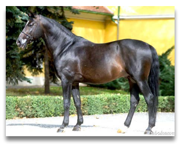
O'Bajan XXIV 1997 Babolna

at Babolna, and I didn't know his pedigree when I first looked at him. He