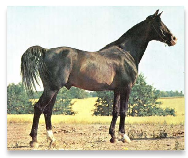
O'Bajan DK (born O'Bajan X-5, Babolna x 36 Siglavy VI), exported to Denmark, where he became O'Bajan I, DK