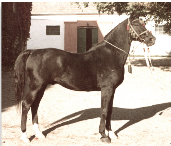
O'Bajan XIII 1949 Bab. (O'Bajan X x 242 Kuhailan Zaid)

line has produced many notable horses. In the USA, the line is represented through the Bajar grandsons * Oman (by O'Bajar ) and * O'Bajan Spirit (by Pamino ), and it is considered especially prepotent for its own “ Bajar type”, because Bajar was the inbred product of an O'Bajan VII grandson ( Sultan ) bred to his full sister ( Gama ). O'Bajan VII 's son O'Bajan X produced both O'Bajan I DK , mentioned previously as the sire of O'Bajan I-10 , and also the famous O'Bajan XIII , sire of the circus horse Badan , and grandsire of Batan . Both are good representatives of “ O'Bajan type.” Since Batan 's dam O'Bajan I-17 is also linebred to O'Bajan X , many of the characteristics for which this line is recognized were reinforced.