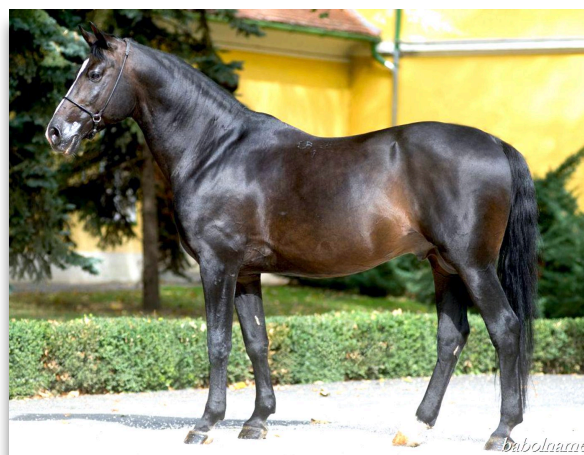
O'Bajan XXIV 1997 Babolna