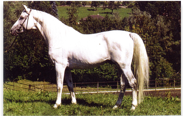
O'Bajan 1-10 1970 Barthahus (O'Bajan I DK x 178 Shagya XXXII, Bab.)