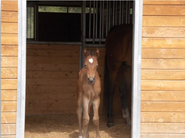
Rexanne Star AF at five days old

When you truly love an animal, it means always believing you have more time. Sweet girl, I truly thought we had more time.