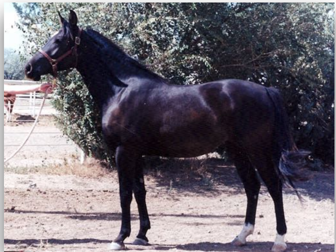
Shaleez as a two year old at NASS Inspection