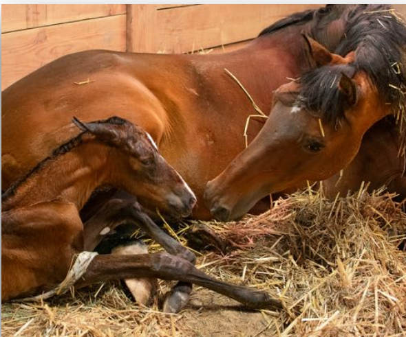
Minutes after giving birth to Shagya Raina, May 7, 2020