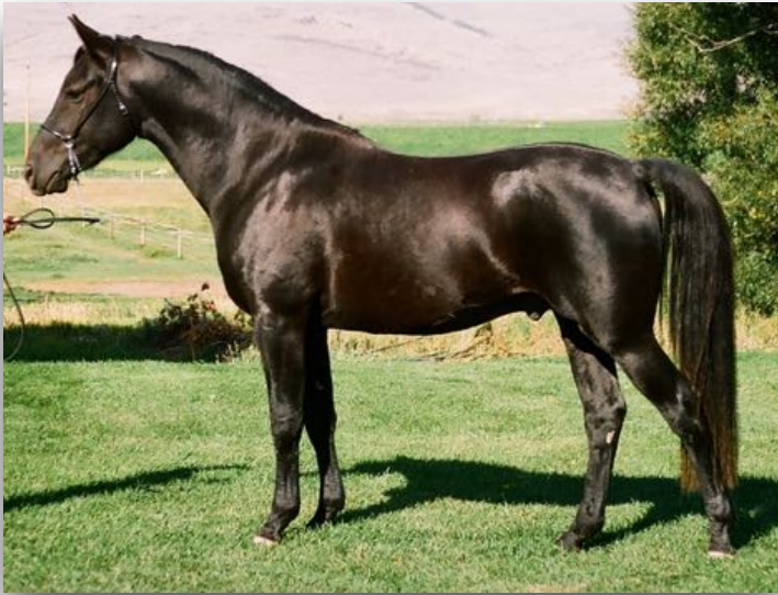
Onyx AF (Janos x MJL Shaleez at NASS Inspection 2007 Fully recovered from his catastrophic injury!