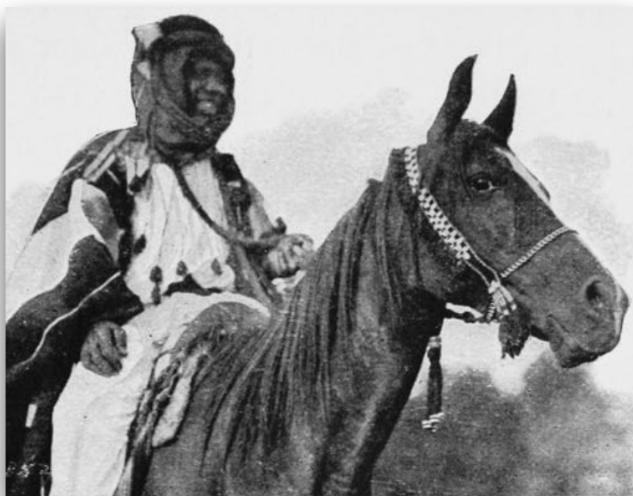
Wadudda d.b. 1899, the famous war mare Homer Davenport brought to America