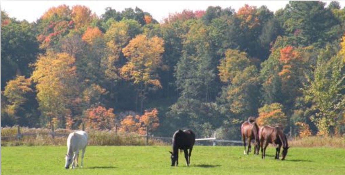
Shaleez in Quebec with her pasturemates, left to right: Jewel (*Amurath Samurai x *Suroor), *Suroor (Haram Ibn Halima (ox) x Sabah) and Shamballah (*Oman x *Suroor)

“She integrated very well with my 3 other mares, *Suroor, Shambhalla, and Jewel, whom I had at that time also. When we lost her last equine friend Jewel in 2021, she developed a funny and very close relationship with our dog and the sheep. She was like a mother to them and they were always together. Shaleez was often free around the house, like my other horses, and followed us when we did garden or farm work or when she was eating apples under the apple trees in autumn. She loved when I gave her osteopathic treatments (I am an osteopath), and we shared these silent and close moments.