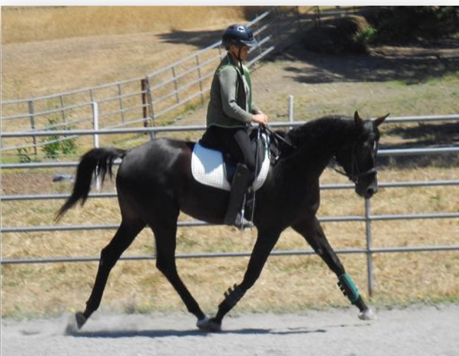
KB Sequoia Fahim (Shagya Royal AF x KB Salim Fahim (ox))

“Eleven years ago I sold a very special mare. On January 1 of this year, I got the opportunity to purchase her back. After quarantine, Sequoia and her April Shagya foal, she is carrying, will be coming home. This is a photo of me riding Sequoia in 2013. For more information about the foal, contact me at fahim@humboldt1.com or see www.kerriganbloodstock.com “