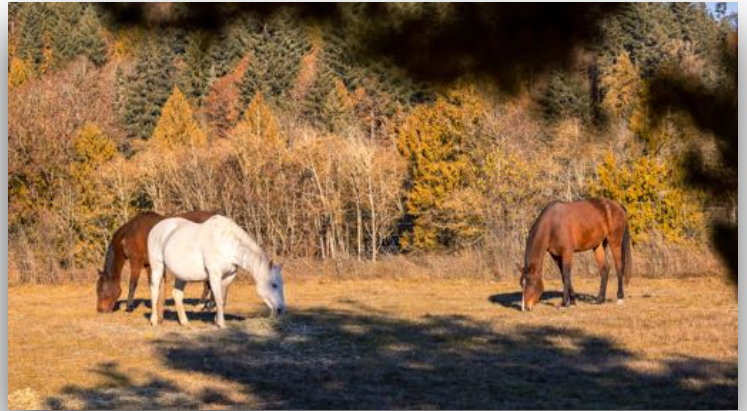
Back home for good and getting reacquainted, November 2022. From L to R: Rexanne Star AF, Hera AF, Shagya Raina