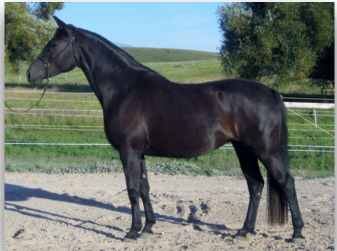
Shandor's Shadow all grown up at the NASS Inspection