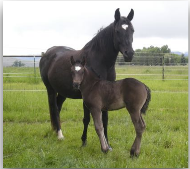
Shandor's Shadow AF by Shagya Royal AF x Shaleez

Shaleez's last foal was born in 2008, and this time we were lucky to get a filly I named Shandor's Shadow AF because she is linebred to her grandsire *Shandor. Her father, Shagya Royal AF is by *Shandor and Shaleez was also by *Shandor. This is the first and only time that I linebred to the grandsire, and in this case, it was successful, proving the strength of the genetics, as Shadow was a large, correct, and vigorous foal showing no depression from linebreeding