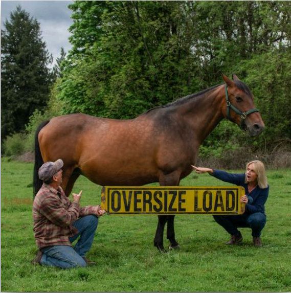
Expectant mama in Washington State

In May 2020, right in the midst of Covid, Rexanne gave birth to our very big bay filly Shagya Raina , sired by Nicolette's Revelation AF ( Shagya Royal AF x *Nicolette ). It was a once-in-a-lifetime experience for us, and I do mean, once.