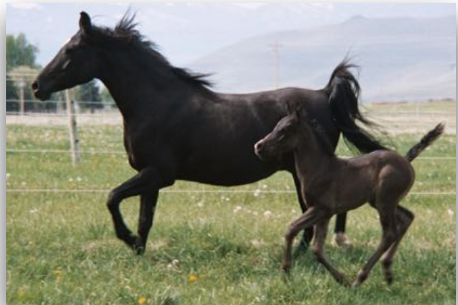
Shaleez with Onyx AF by Janos, shortly before his injury

The next year Shaleez produced another black colt I named Onyx AF , and this one looked like a stallion from day one. Some bad luck struck, however, when he was just a few days old. He was out in pasture with his mom and apparently got kicked in the left stifle. Surgery was performed and it revealed significant damage to his cranial cruciate ligament and medial meniscus, with a poor prognosis for soundness.