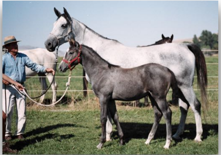
Shagya's Sisu AF and daughter, Sylvan Star AF