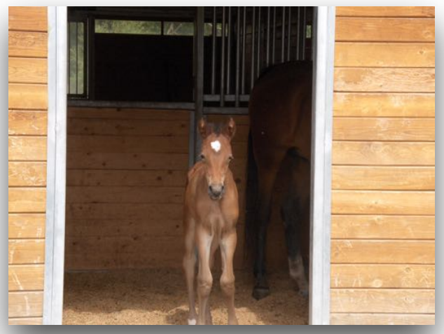
Rexanne Star AF at five days old

Rexanne Star AF July 6, 2007 - December 21, 2024 When you truly love an animal, it means always believing you have more time. Sweet girl, I truly thought we had more time.