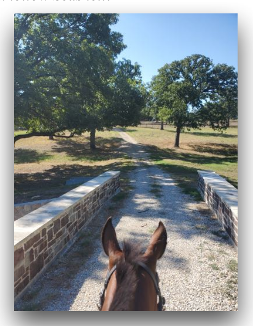
Griffin out and about exploring a farm near Fort Worth, Texas.

"Griffin is by the purebred Shagya Arabian, Under Milkwood out of Cleveland Bay, Foxhollow Seashell."