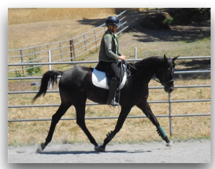
KB Sequoia Fahim (Shagya Royal AF x KB Salim Fahim (ox))

"Eleven years ago I sold a very special mare. On January 1 of this year, I got the opportunity to purchase her back. After quarantine, Sequoia and her April Shagya foal, she is carrying, will be coming home. This is a photo of me riding Sequoia in 2013. For more information about the foal, contact me at <a href="mailto:fahim@humboldt1.com">fahim@humboldt1.com</a> or see <a href="mailto:www.kerriganbloodstock.com">www.kerriganbloodstock.com</a> "