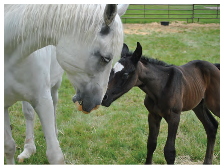
Empress Estelle AF and her colt by Onyx AF