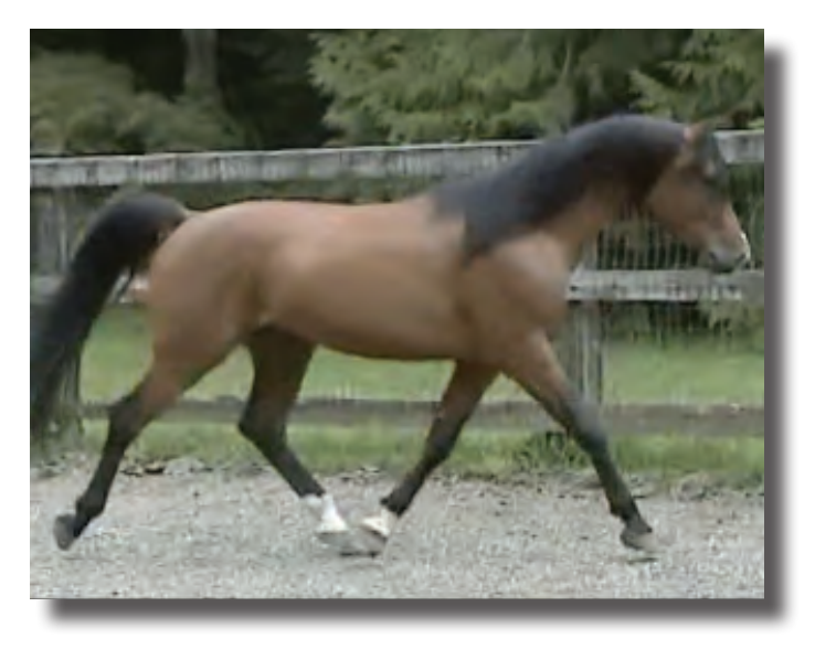
RISING STAR (Starwalker/Ramona AF by *Oman ) Purebred Shagya-Arabian Colt NASS/ShA-08-264

OLYMPIA, WA 360-943-8769 EMAIL: PLBETTS@O.COM