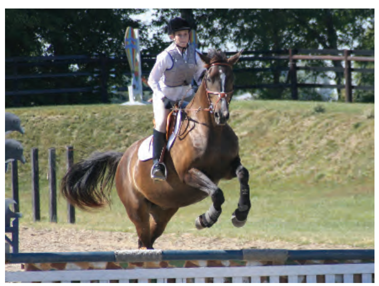
Holiday Star AF shown by one of Lily Davis's students in a hunter class.