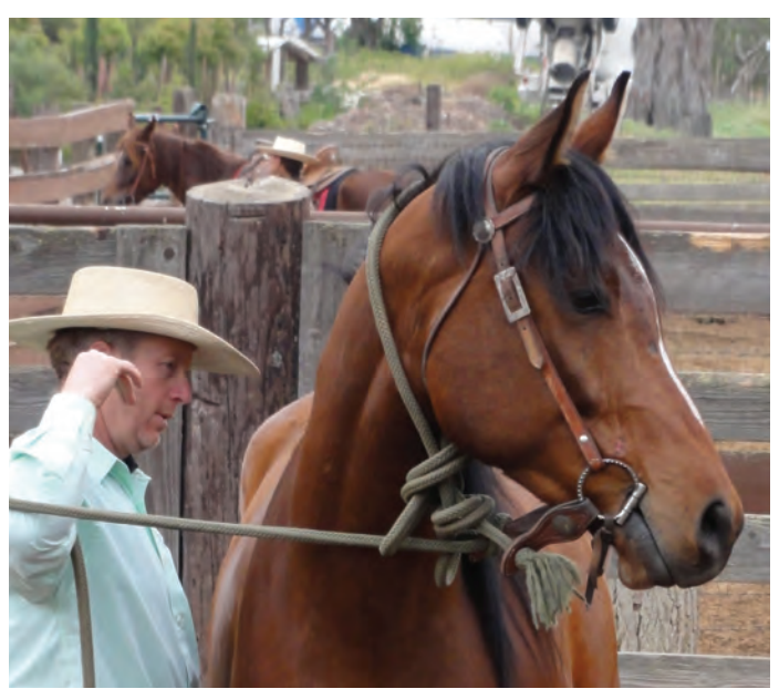
Reveille SH at the colt clinic