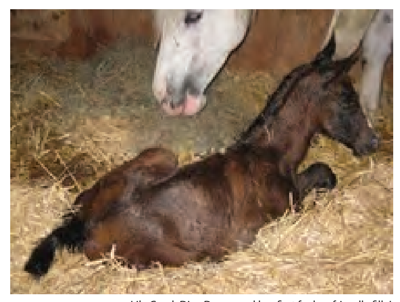
Lily Creek Diva Dance and her first foal - a friendly filly!

On March 13 we were blessed with a new filly from our mare Lily Creek Diva Dance (Sarvar PFF/Dynamos Dancer ox by PR Dynamo ox). This foal was sired by Olympic hopeful Trakehner Patras vom Rappenhof so therefore has Shagya on both sides of her pedigree. (See Fall 2010 issue for more details.) Turning grey, she has been the friendliest of foals and we hope she keeps that attitude! May want to be an eventer like father - already jumping manure piles!