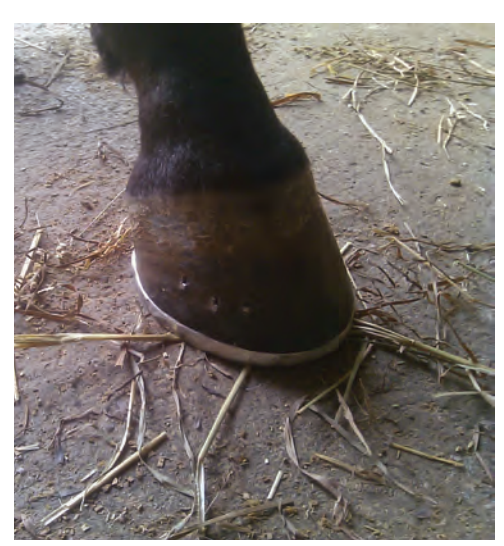
Skamp's first set of "Air Jordans" - aluminum support shoes.