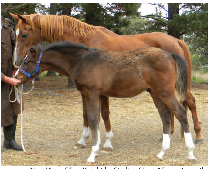
New Moon Silver Knight by Sterling Silver AF, age 3 months First Shagya born in Australia! Congratulations!