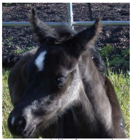
Looks like a future sport horse!