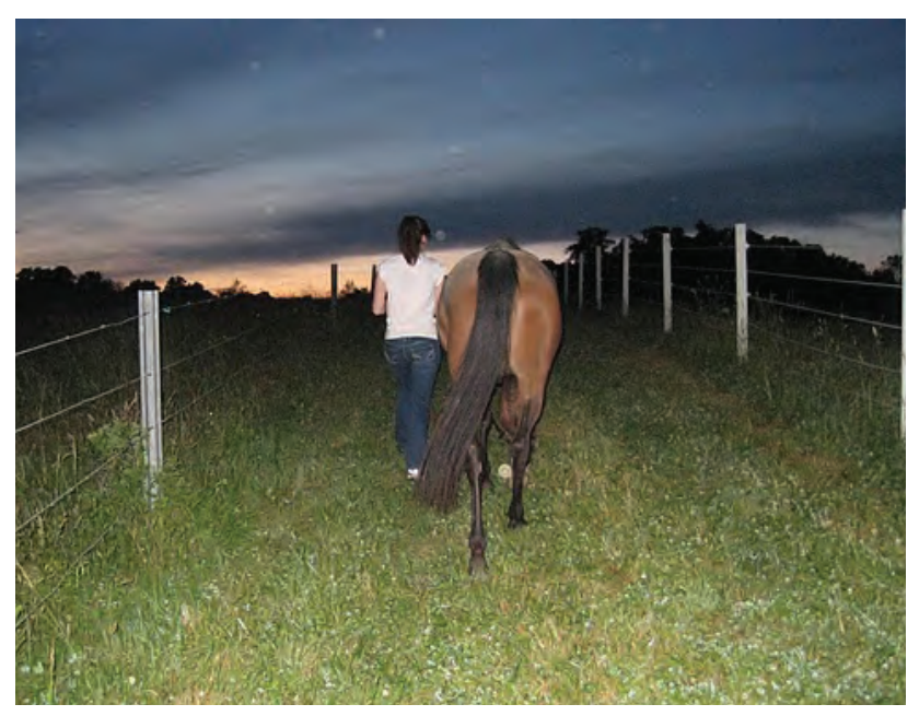
"Sunset walkabouts" became a special time to bond, relax and reflect.

For more photos, video and expository, always feel free to check out my blog: www.tevisorbust.blogspot.com