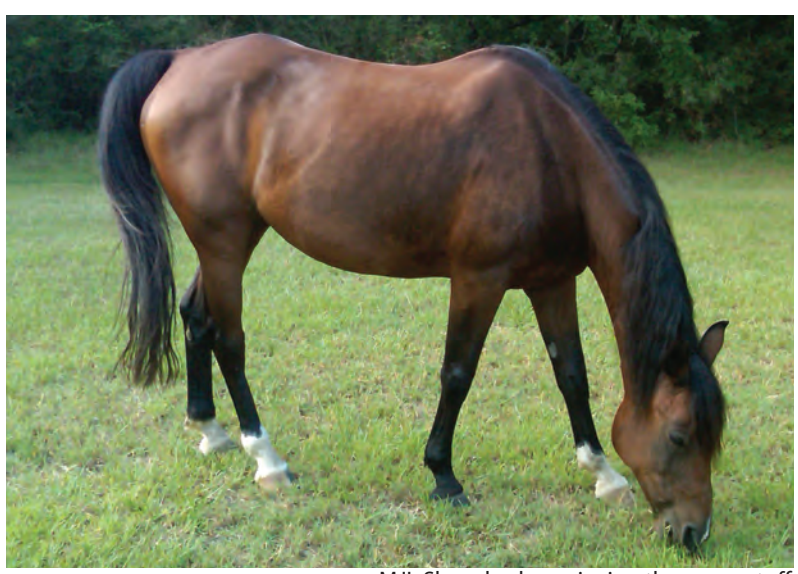
MJL Shagala also enjoying the green stuff