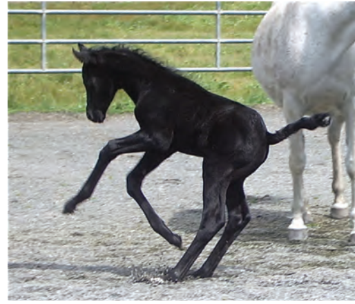
KB Sharif Fahim showing off!