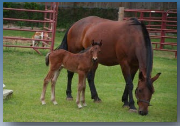
Under Milkwood's first North American foal, Griffin, a Shagya-Arabian x Cleveland Bay