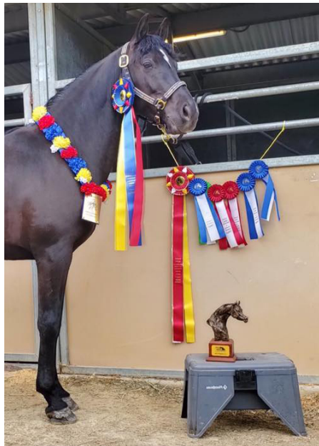
KB Thor Fahim