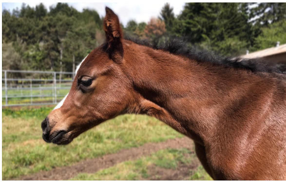
KB Sultan Fahim