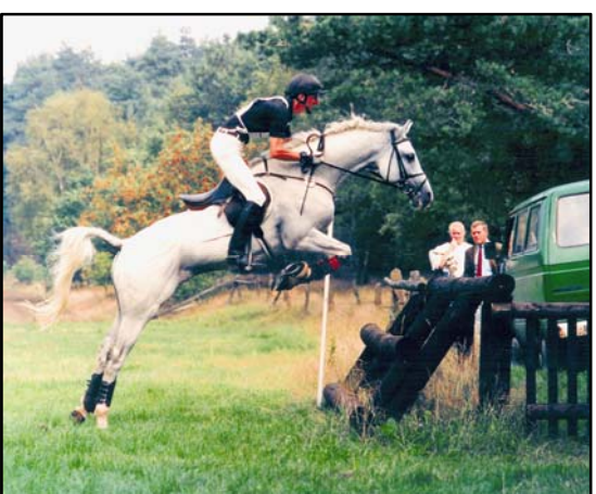
German-bred Shagya stallion Ghazzir placing 10th in the German National Championships for young horses in 1990.