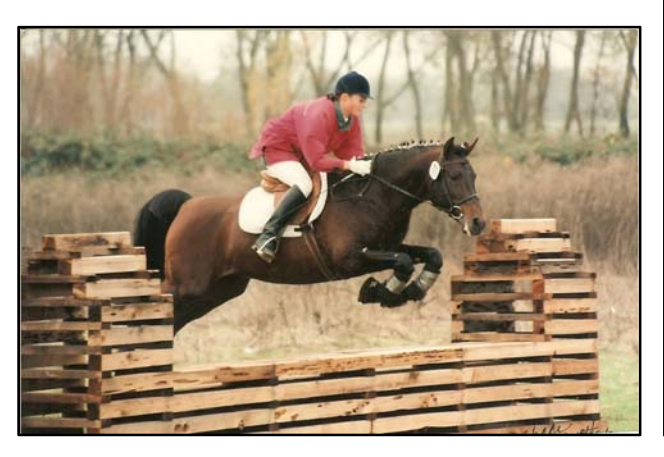
The German-bred Shagya stallion *Oman successfully completing the 100-day test at Rancho Murietta. He has many NASS registered purebred and part Shagya offspring in the U.S.A.