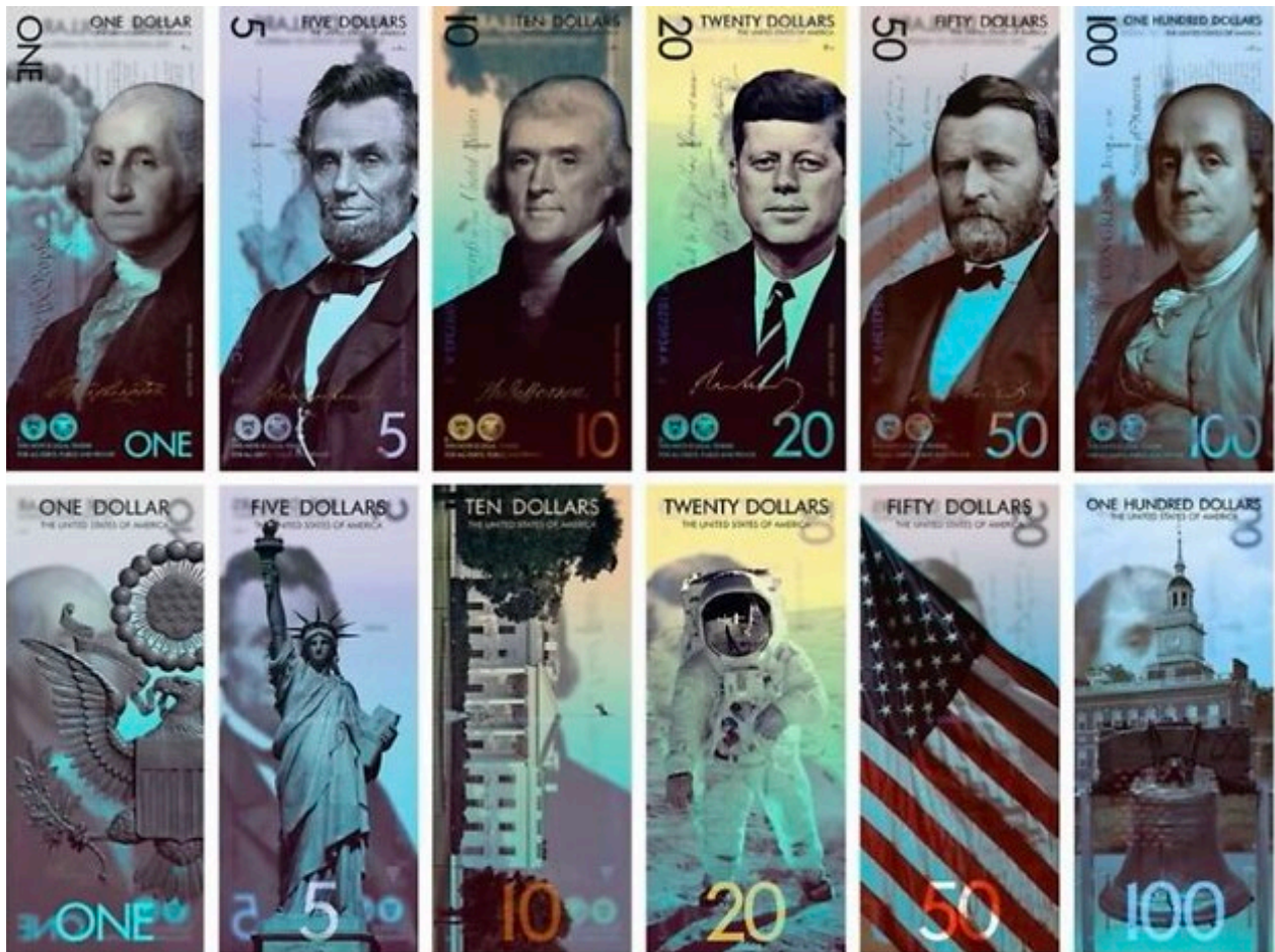
Figure 5—The term Rainbow Treasury Note is a designation to the above denominations that will have the backing of gold, silver, and platinum, hence light of the yellow, silver, and white spectra—, colors within a rainbow.