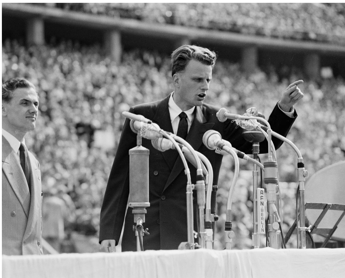
Figure 2--Graham speaks to 100,000 Berliners at Germany's Olympic Stadium, June 27, 1954. His ecumenical strategy was to build consensus and "reach across the aisle," while not stepping on any toes. This approach was just what Rome wanted from someone with Graham's credentials, charisma, and oratorical acumen. He was the pied piper of the Vatican . As a Mason, Graham sincerely believed he could don the hat of a 'Christian,' while at the same time embrace the Mason's creed of, "Forever conceal, and never reveal."