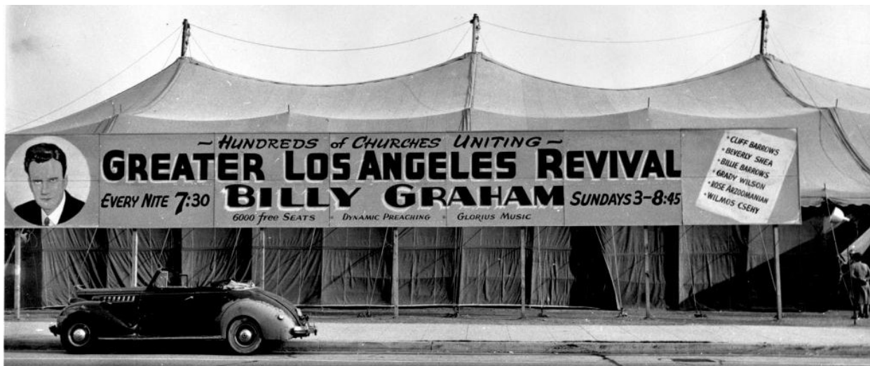
Figure 1--Venue for Graham's crusade in L.A. in 1949