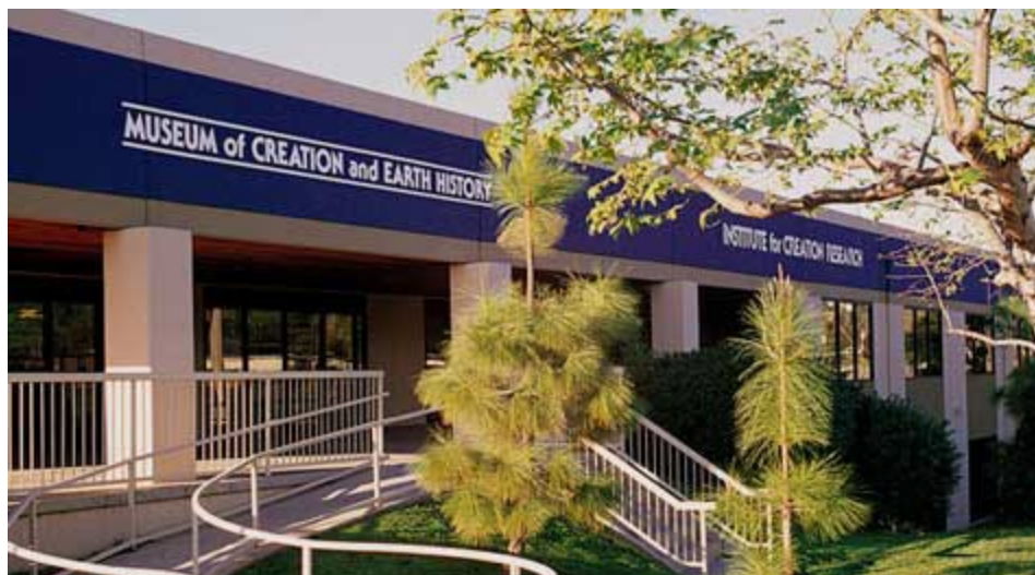
Figure 1-The Institute for Creation Research in Lakeside, CA before their relocation to Dallas, TX