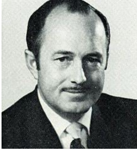
Figure 3-Republican and Independent, John G. Schmitz. My folks had a fundraising campaign for him in our home. This was my first exposure to government and politics.