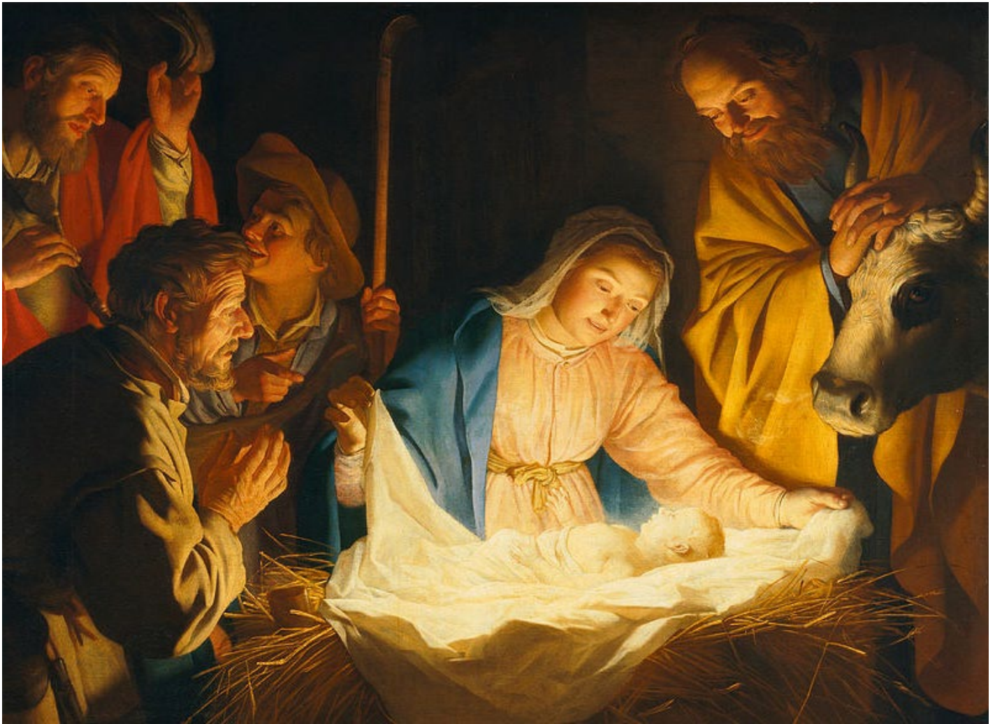
“Adoration of the Shepherds,” Gerrit van Hornthorst