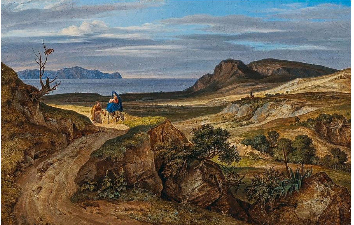
“Flight into Egypt,” Harold Copping