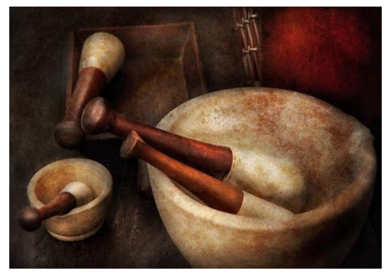
The Biblical Apothecary: Natural Remedies Instead of Lab Created

An individual possessing the knowledge of compounding God's natural ingredients in set proportions was noted as an apothecary. Recognizing the human body was created by God and that man was fearfully and wonderfully made, designed by the Great Physician himself, the apothecary's objective was ultimately to honor man's temple through man's voluntary consent in the administration of natural remedies, boosting man's immune system, while increasing the body's overall capacity to fight infection. Given the intricacies of man's immune system, it was discovered the human body could virtually conquer any ailment sent its way. This would be augmented with God's hand overseeing the recovery process as well as those trained and educated in the art of biblical compounding and naturopathic medicine.