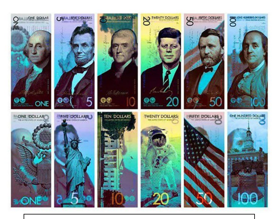
U.S. RAINBOW TREASURY CERTIFICATES--The various U.S. denominations that will be backed by gold, silver & platinum reserves & printed by the U.S. Treasury