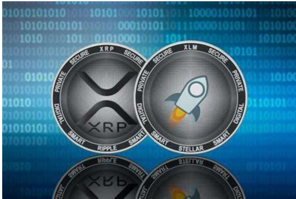
Figure 3—XRP and XLM tokens will be backed by gold and silver, not the empty promises of the Deep State, and will have so many tokens made based on reserves of their precious metals' backing. This of course, is done to eliminate the Deep State practice of unlimited coining, untraceable origination, and the creation and bloating of unauthorized black budgets supporting such Deep State activities as: D.U.M.B. (Deep Underground Military Base) construction, human cloning operations, cross border human trafficking, adrenochrome & organ harvesting activities, as well as South American drug smuggling cartels, etc.