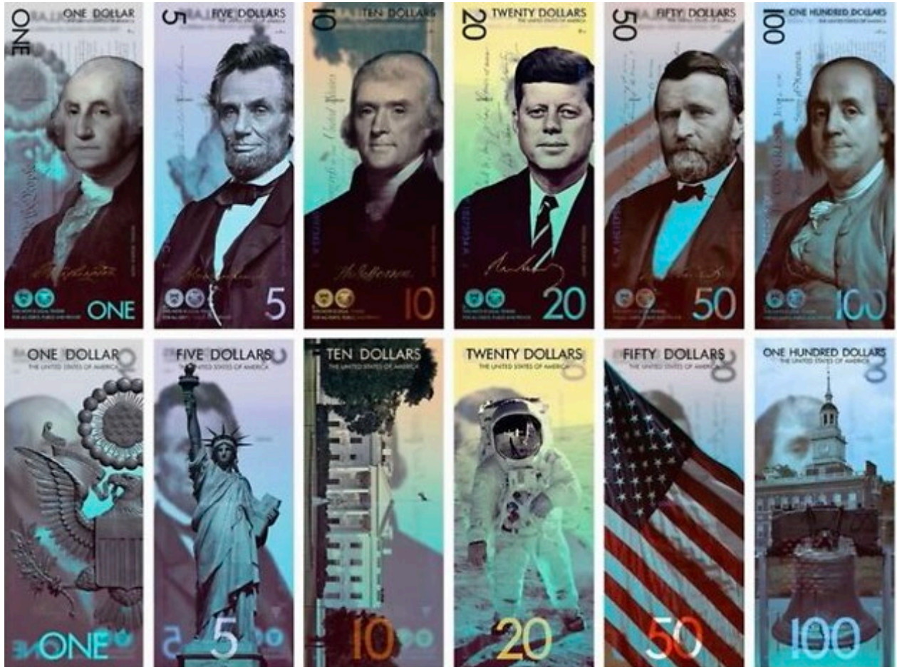
Figure 5—The term Rainbow Treasury Note is a designation to the above denominations that will have the backing of gold, silver, and platinum, hence light of the yellow, silver, and white spectra—, colors within a rainbow.