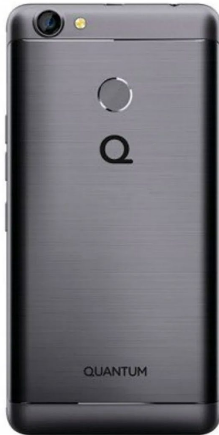
Figure 4—The Quantum Phone, a collaborative effort of White Hat military computer engineers, witness protection survivor and former Apple C.E.O. Steve Jobs, along with White Hat Elon Musk, C.E.O. of X, Tesla and Space X, as well as other key software coders, is set to revolutionize the communication, finance, and photo industries with a storage capacity of 2TB and a camera resolution rating of 256 pixels. In communication with quantum Starlink satellites, language between electronic devices will be by means of photonic-laser light and stellar blockchain ledgers. Digital currency will be backed by precious metals thereby eliminating Deep State credit. This technology is designed to eliminate latency and the middle-man from financial transactions, while assuring security, unsurpassed speed, transparency, and cross border transactions, all of which by the way, Deep State actors hate because of its grounding in a decentralized, operational platform, with the protection from Deep State actors by Space Force .