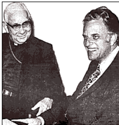
Oakland Tribune, July 29, 1971

I often read the scripture: "Whosoever, therefore, will be a friend of the world is the enemy of God." The newspapers never really blasted Billy Graham. Magazines said he was one of the world's most loved men. Somehow, I kept getting a "tilt" sign flashing in my mind. I've loved Billy, prayed for him and supported him. But I sensed something was wrong.