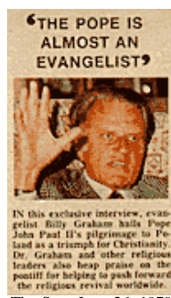
The Star, June 26, 1979

"Following the New England Crusade, thousands of those who came forward are now in the process of being integrated into the Catholic church. Meetings have taken place between the Graham Association and Catholic clergy for the transfer of these people to the Roman church. One such meeting took place at Pope John XXIII Seminary in Weston, Massachusetts, on the evening of June 9, 1982, when the names of 2100 inquirers were given to priests and nuns."