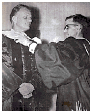
Billy Graham and the Church of Rome

Billy Graham at Roman Catholic Belmont College receiving the yoke from ROME. Graham was granted an honorary doctor's degree from this Roman Catholic College. Graham told his audience that the 'Gospel that founded this college is the same gospel which I preach today.'