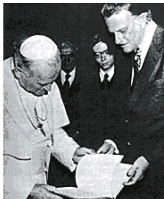
Faith for the Family, Nov. 1982

Jesuits in Central and South America telling them to fill the stadiums with Roman Catholics whenever Billy Graham spoke. Millions were spent to promote Billy Graham as the world's greatest evangelist.