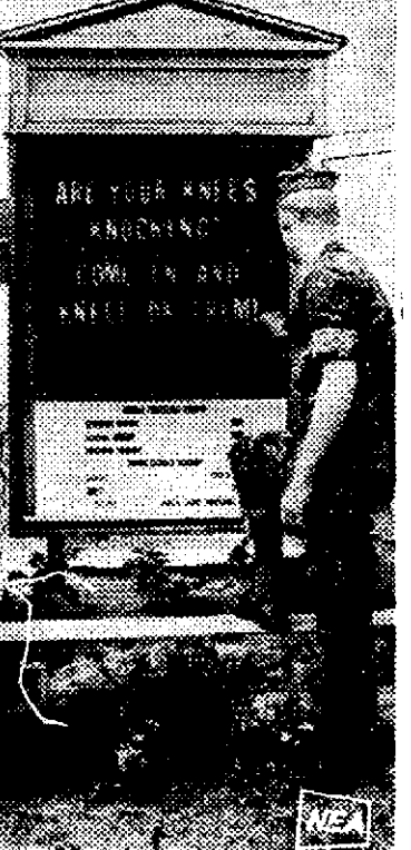
CHAPLAIN'S ASSISTANT puts finishing touch on chapel's bulletin board message, which reads, "Are your knees knocking? Come in and kneel on them!"