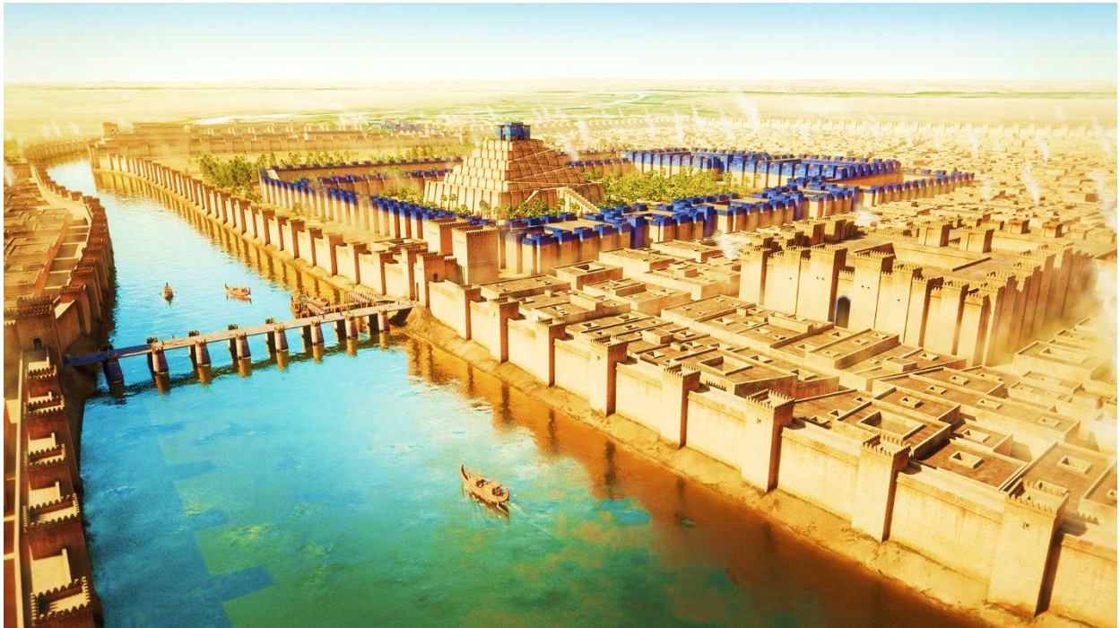
Figure 1— Babylon, the Etemenaki or the Tower of Babel, 550 BC. by J.R. Casals

By Paul J. Wickliffe Sunday, January 28, 2024