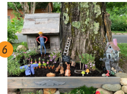
6 "Farming Frustration" by Gail Roberge 26 Main Street