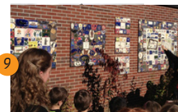
9 Tile Mural by Beckie Kravetz Berkshire Trail Elementary School 2 Main Street