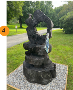
4 "A Conversation" by Ana Busto & Steven Schiff Cummington Community House 33 Main Street