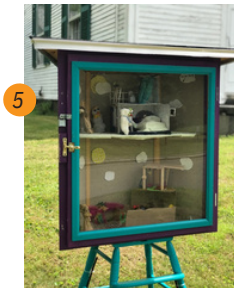
5 "The Little Gallery" by Village Homeschool Cooperative Cummington Village Church 32 Main Street