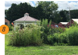
8 Community Pollinator Garden Pettingill Park 14 Main Street