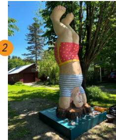
2 "Everything is Upside Down" by Sergei Isupov Project Art 54 Main Street