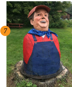
7 "Friendly Farmer" by Beckie Kravetz Cummington Supply 18 Main Street