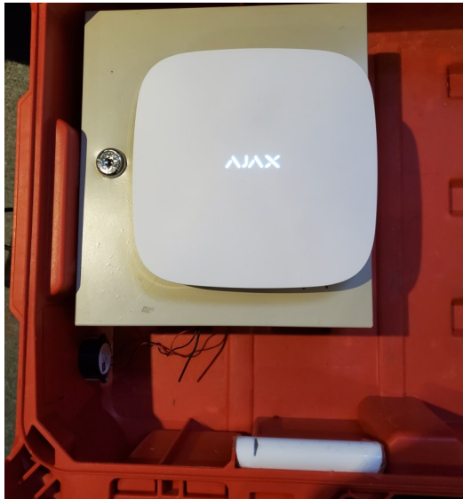
200 zone professional alarm HUB with wireless receiver & GSM

Patten Pending (January 2023) Spectrum Systems