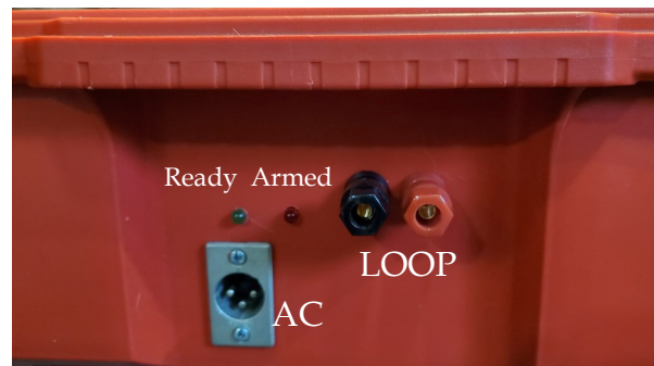
Input panel with system status LEDs