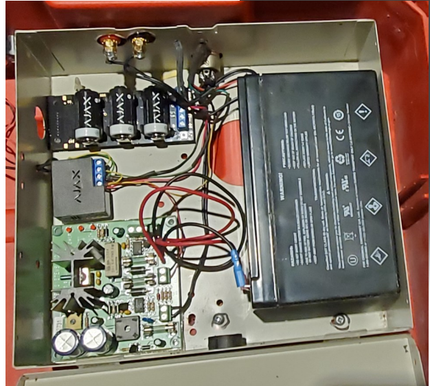
Rechargeable 7 AH battery with power supply charger, input & output circuits