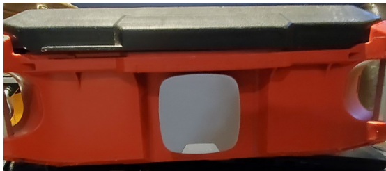
Sirens mounted on side of case