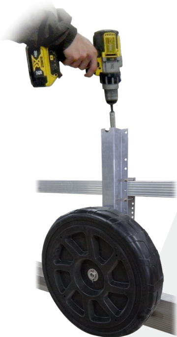
ADJUSTABLE SCREW LEG Simple cordless drill operation