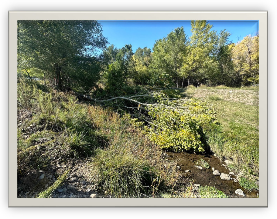
Figure 1 (Above) Fallen cottonwood blocking flow of the river in San Patricio, NM.

The Rio Ruidoso Restoration and Management Agreement is a riparian restoration program along the Rio Ruidoso River in Lincoln County. This program benefits individuals who own land and have been affected by flooding, high winds, erosion, or fire that has caused damage to watersheds, acequias, the Rio Ruidoso or surrounding area.