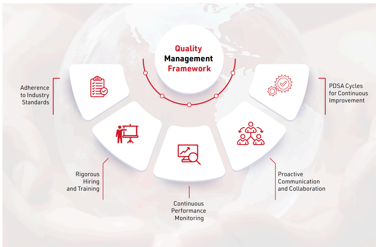
Figure 3: Quality Management Framework