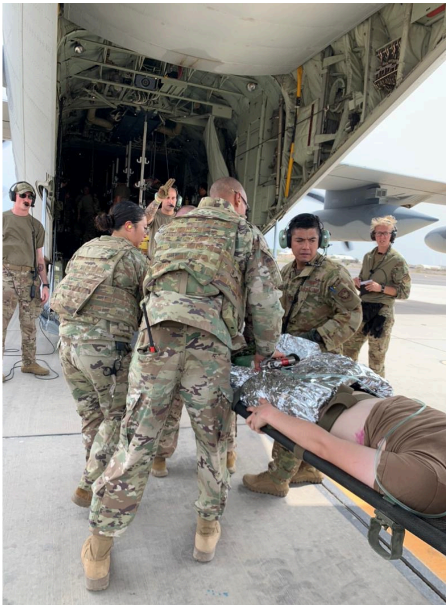
WWS Personnel involved in a mass casualty exercise in Afghanistan