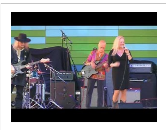
"Mr. Blues" https://www.youtube.com/watch?v=ym17EcEVI8w