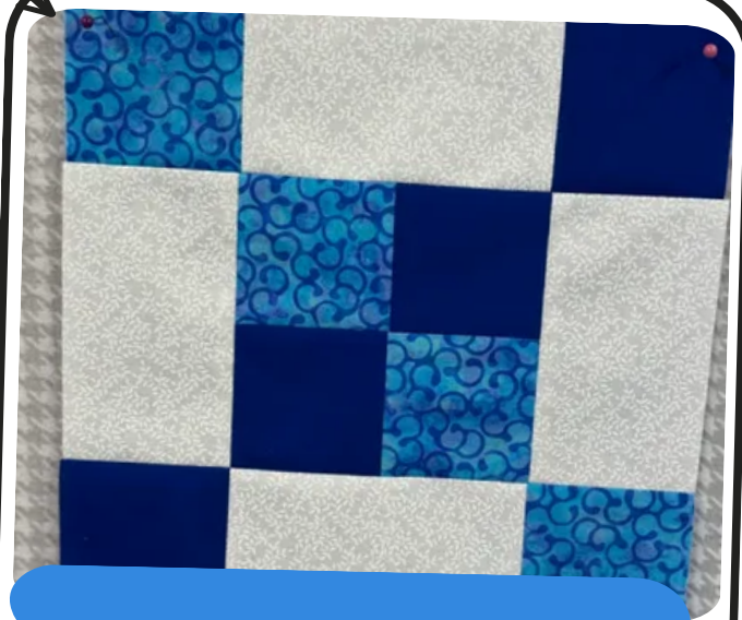
Chain 4 Patch