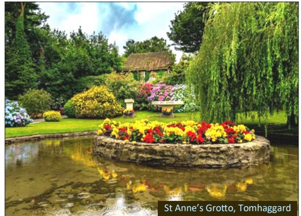
St Anne's Grotto, Tomhaggard