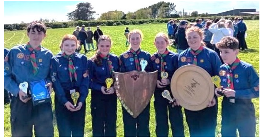
Hearty Congratulations to Kilmore Team 1 who won the Co Wexford Shield this week and will represent Wexford at the National Phoenix Competition in Castlesanderson in August. They also won "Spirit of the Shield" and "Best Bases" awards along with a Gold Standard. Team 2 achieved a Silver Standard in their first Scout Shield, a fantastic achievement for such a young team.

Your job is not to judge. Your job is not to figure out if someone deserves something. Your job is to lift the fallen, to restore the broken and to heal the hurting.