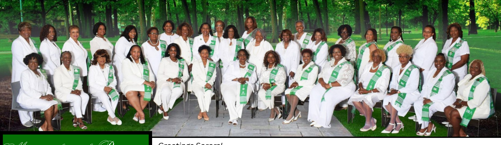
Message from the President

Theme: "Business and Professional Women Empowering Others by Reflecting on Our Accomplishments, Upholding Our Legacy, and Celebrating What Is To Come!"