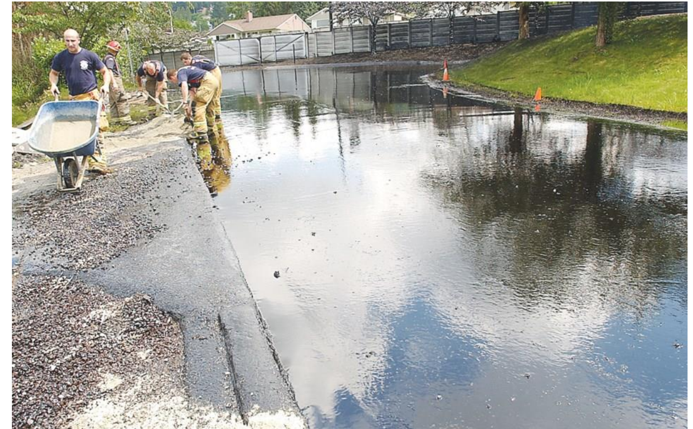
Blocking storm drains on oil spill site to prevent runoff into Burrard Inlet - July 2007