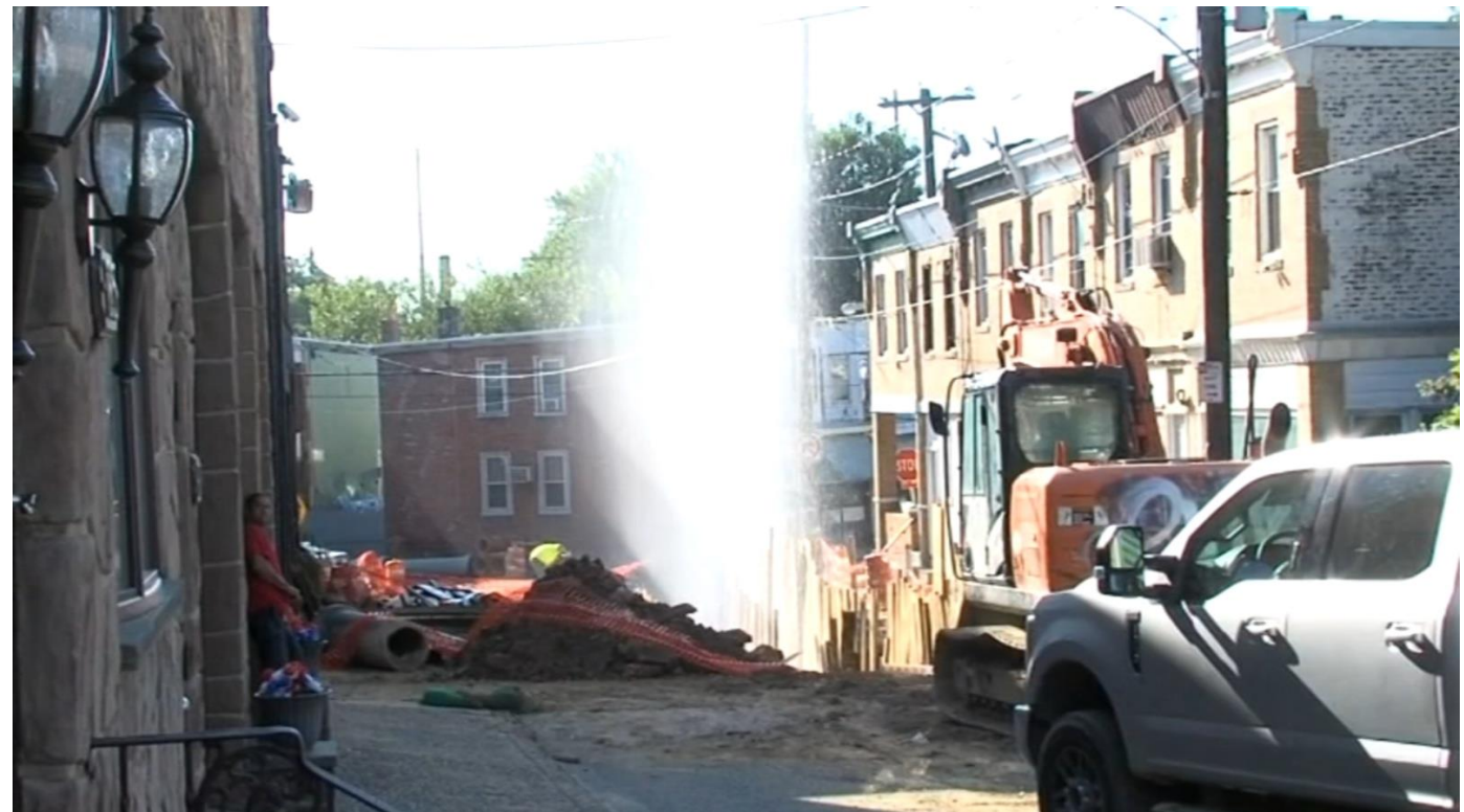
Construction crew strikes water main, creates Frankford geyser: as seen on Action News Mornings