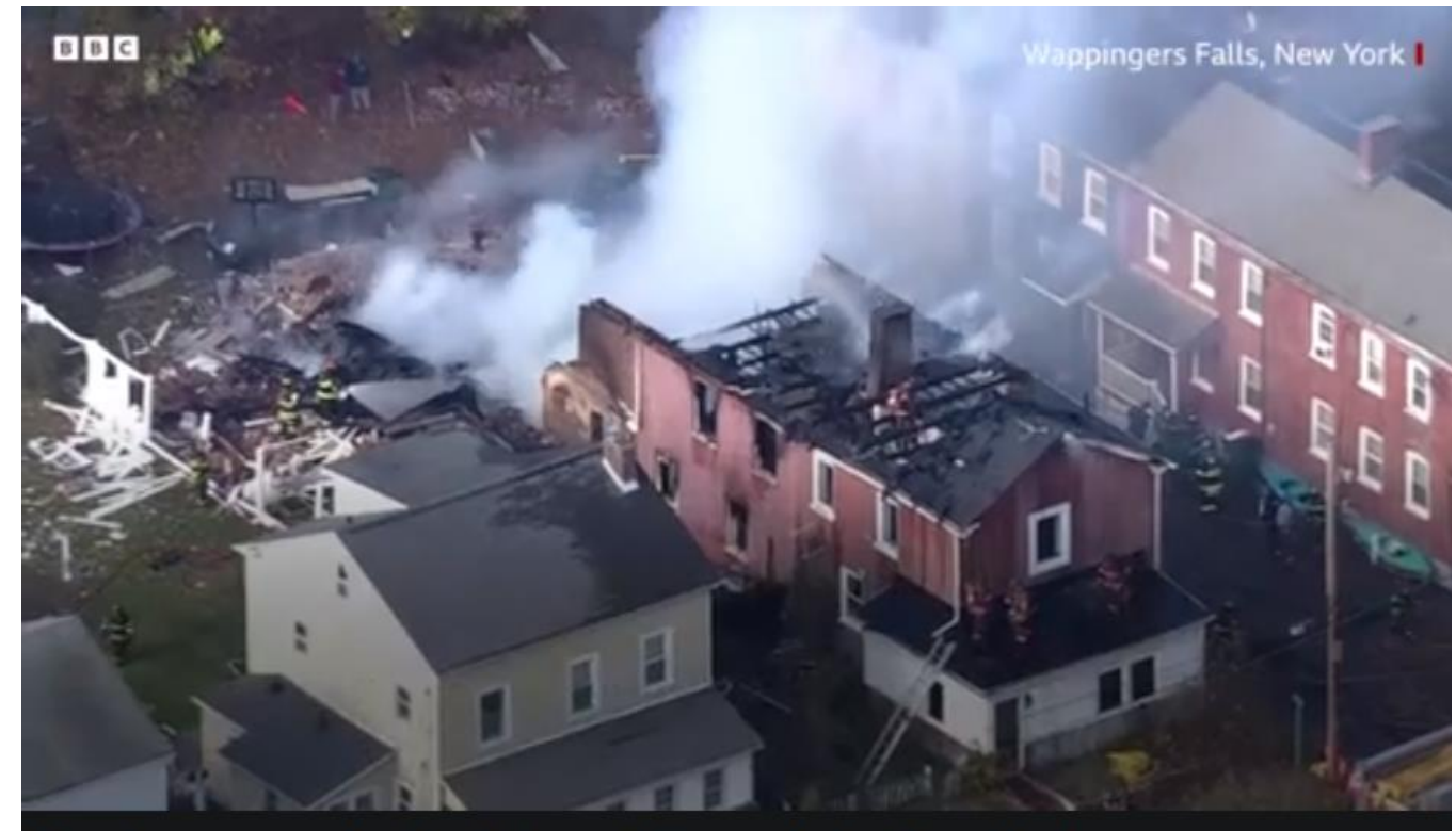
Massive gas explosion injures 15 people in New York