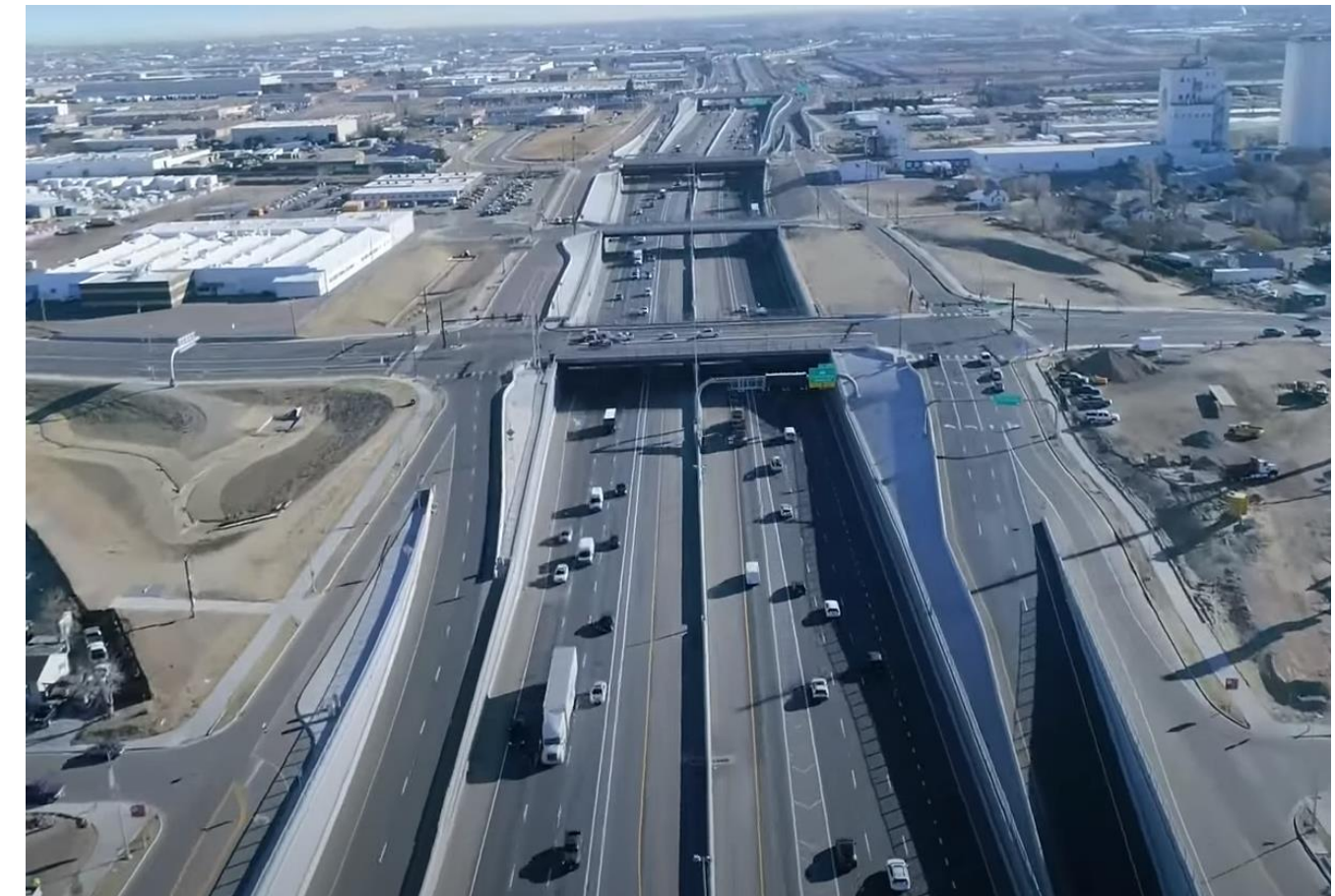
Central 70 Hwy in Denver