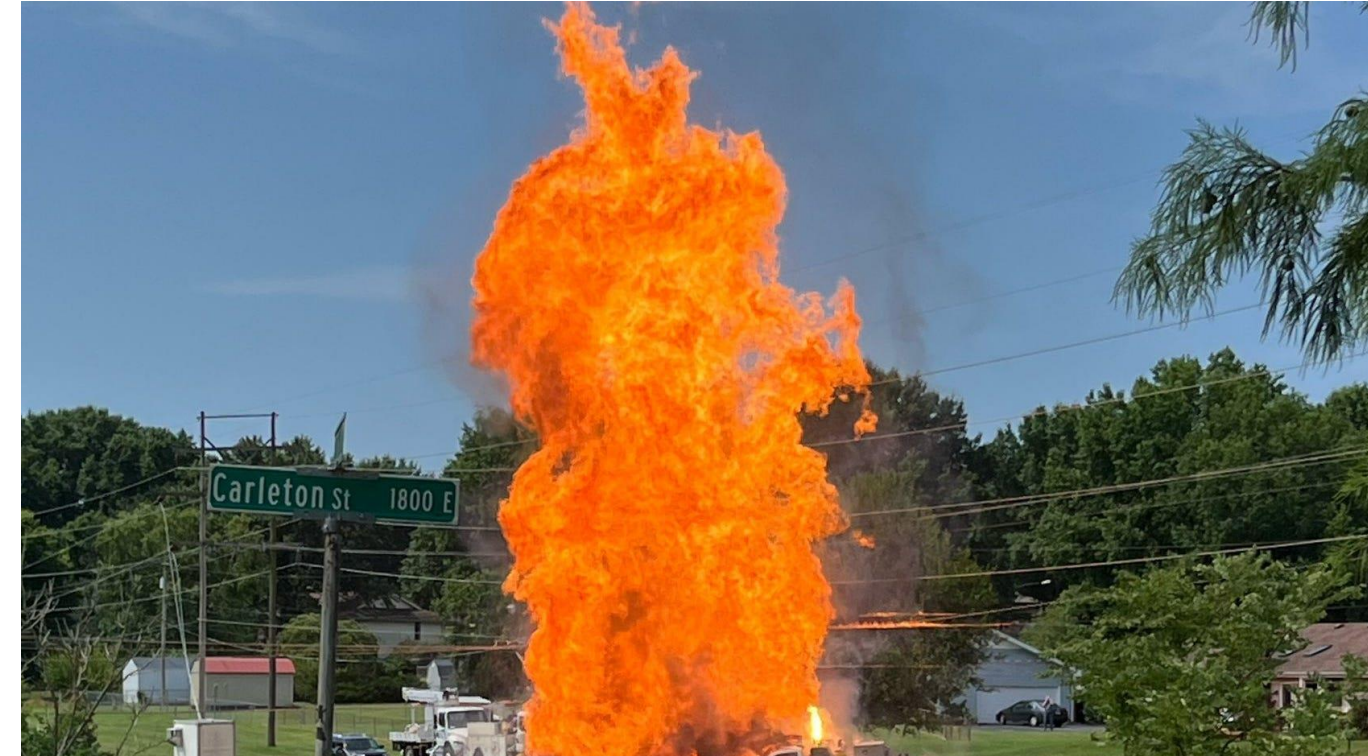
Gas Line strike in Missouri