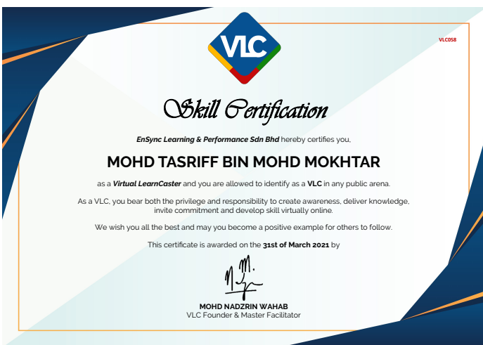
Virtual LearnCaster (VLC)