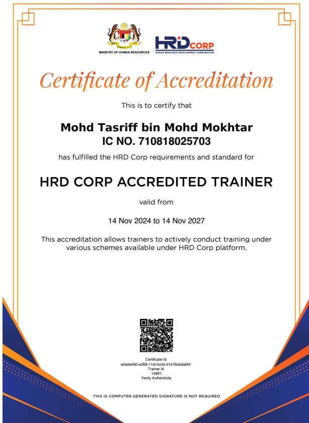
Accredited Trainer – HRD Corp