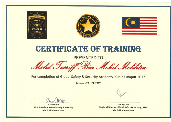
Certified Loss Prevention Champion Marriott Hotels and Resorts