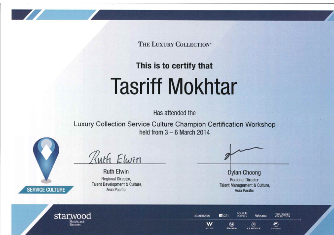
Certified Service Culture Champion Starwood Hotels and Resorts