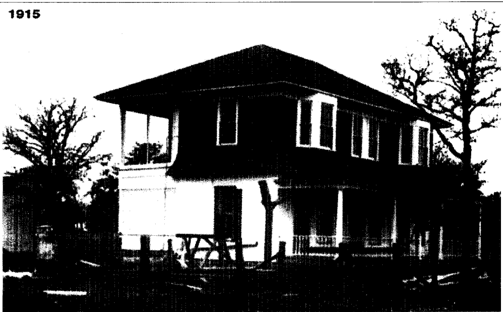
Langford Home – 1915