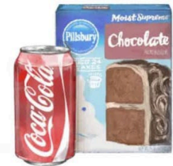
COCA-COLA & CHOCOLATE