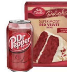
DR PEPPER & RED VELVET