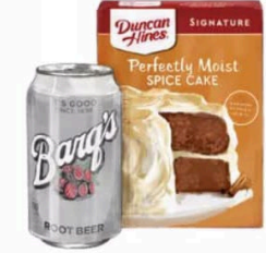
ROOT BEER & SPICE