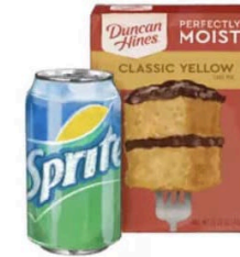
SPRITE & CLASSIC YELLOW