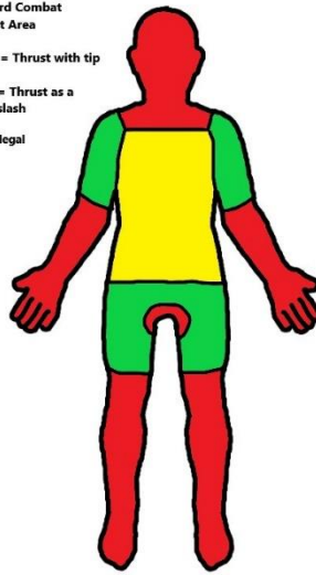
Standard Combat Combat Area

Yellow = Thrust with tip Green = Thrust as a draw/ slash Red = Illegal